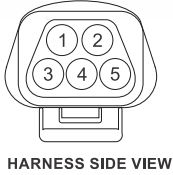
HARNES SIDE VIEW