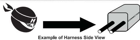
Example of Harness Side View

Use Haltech Calibration file: Pressure - 150 PSI (10 Bar) Motorsport HT010910.cal