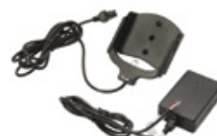
89AXL-UMK-3 In-Cab Active Holder