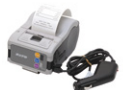
89AXL-WP Printer Kit, MB200i