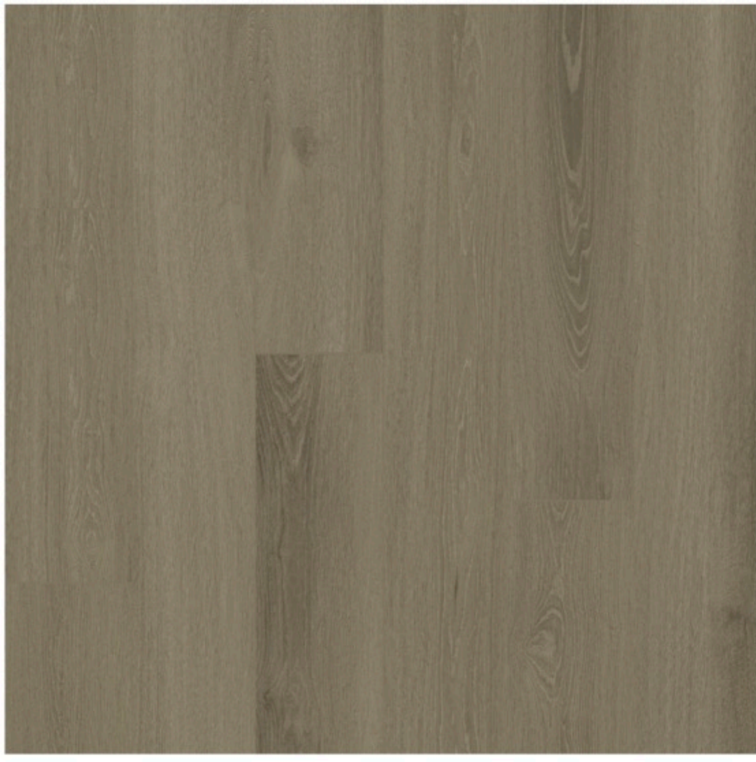
WTX 09 RIVER