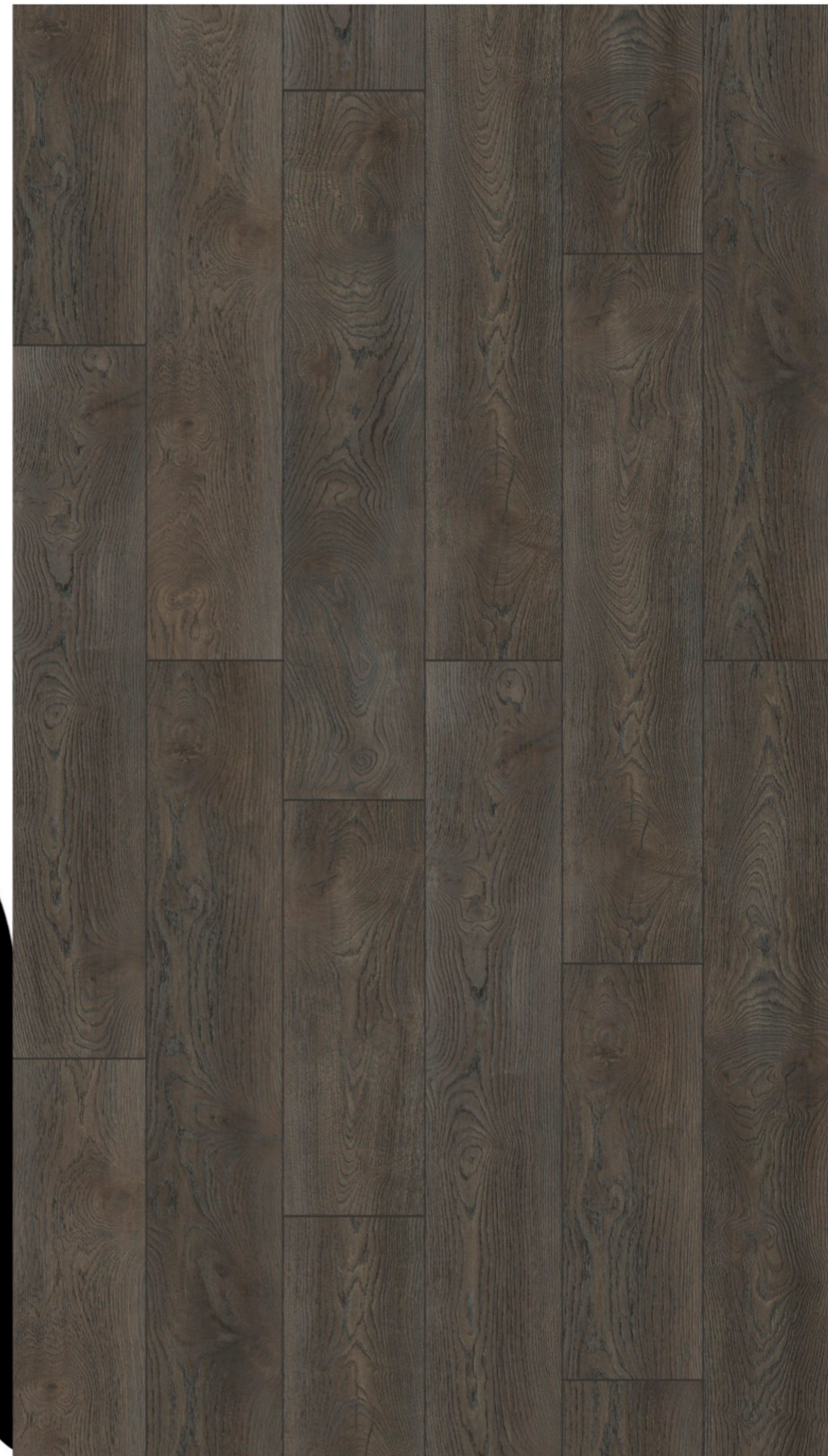
WTX 03 HELENA