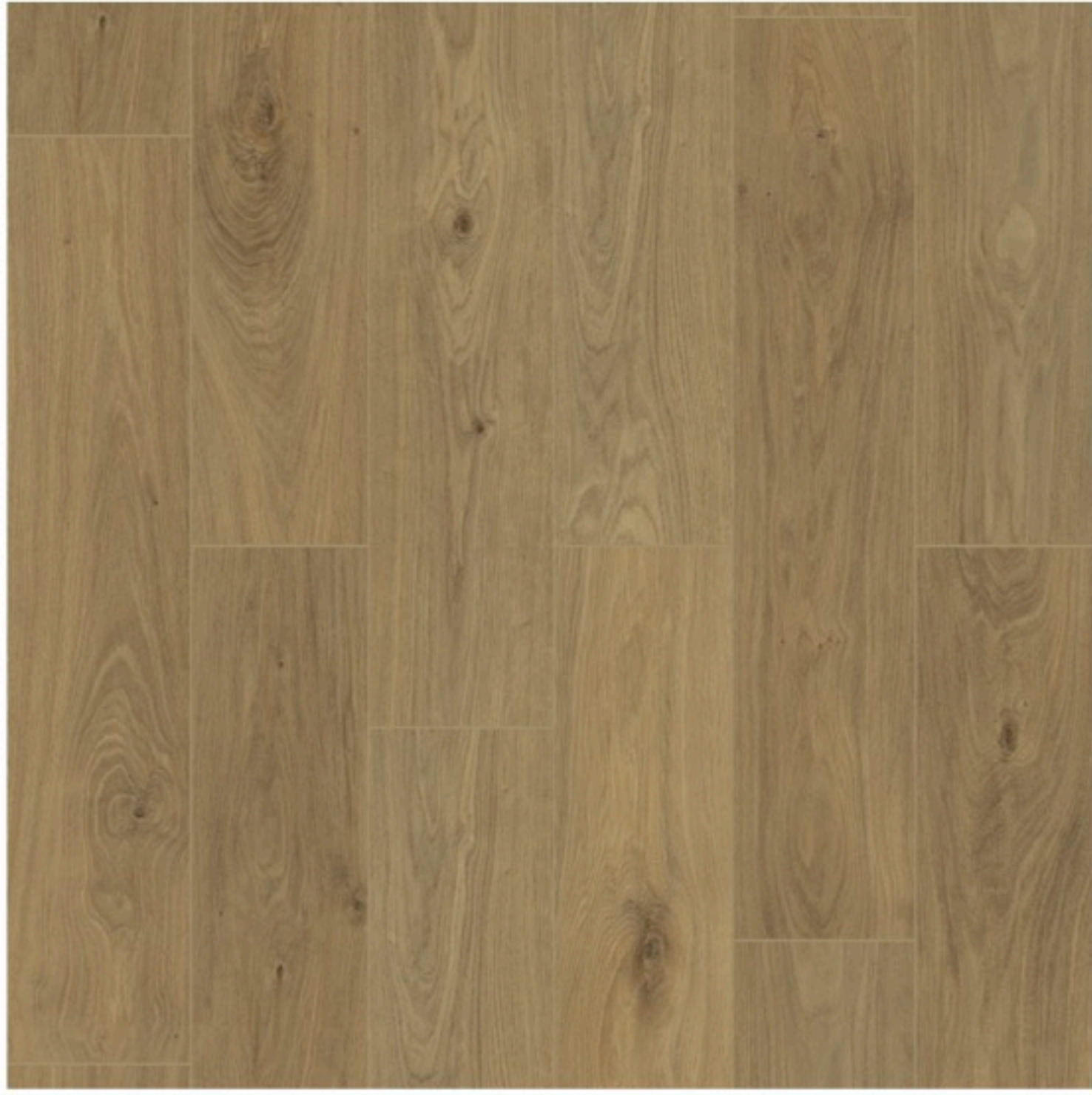
WTX 05 SYLVA