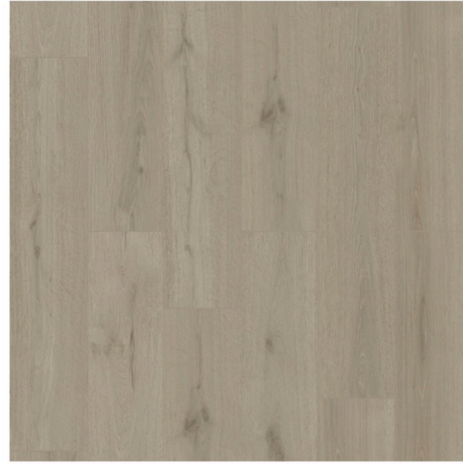
WTX 08 ASH