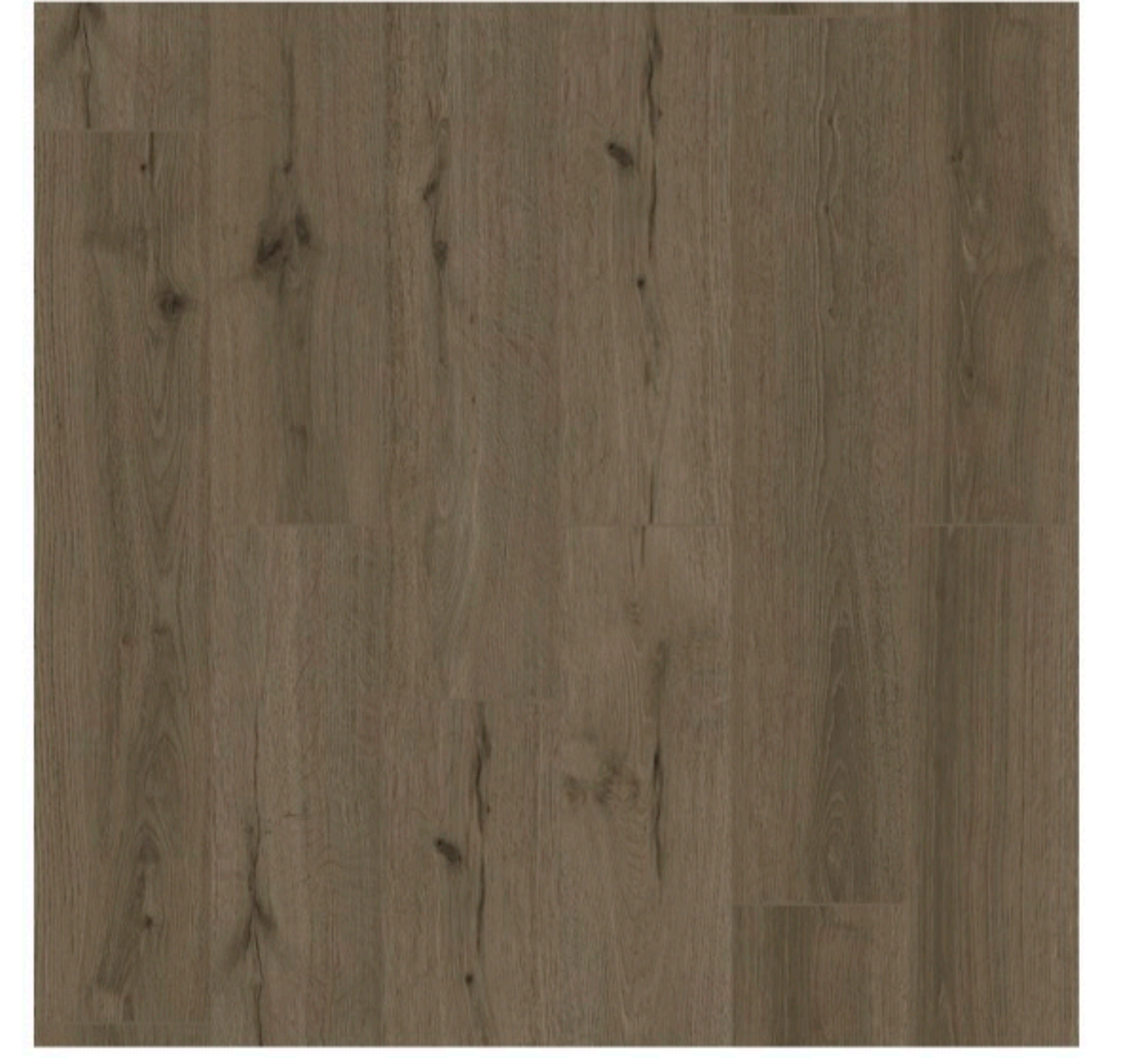
WTX 06 CALHOUN