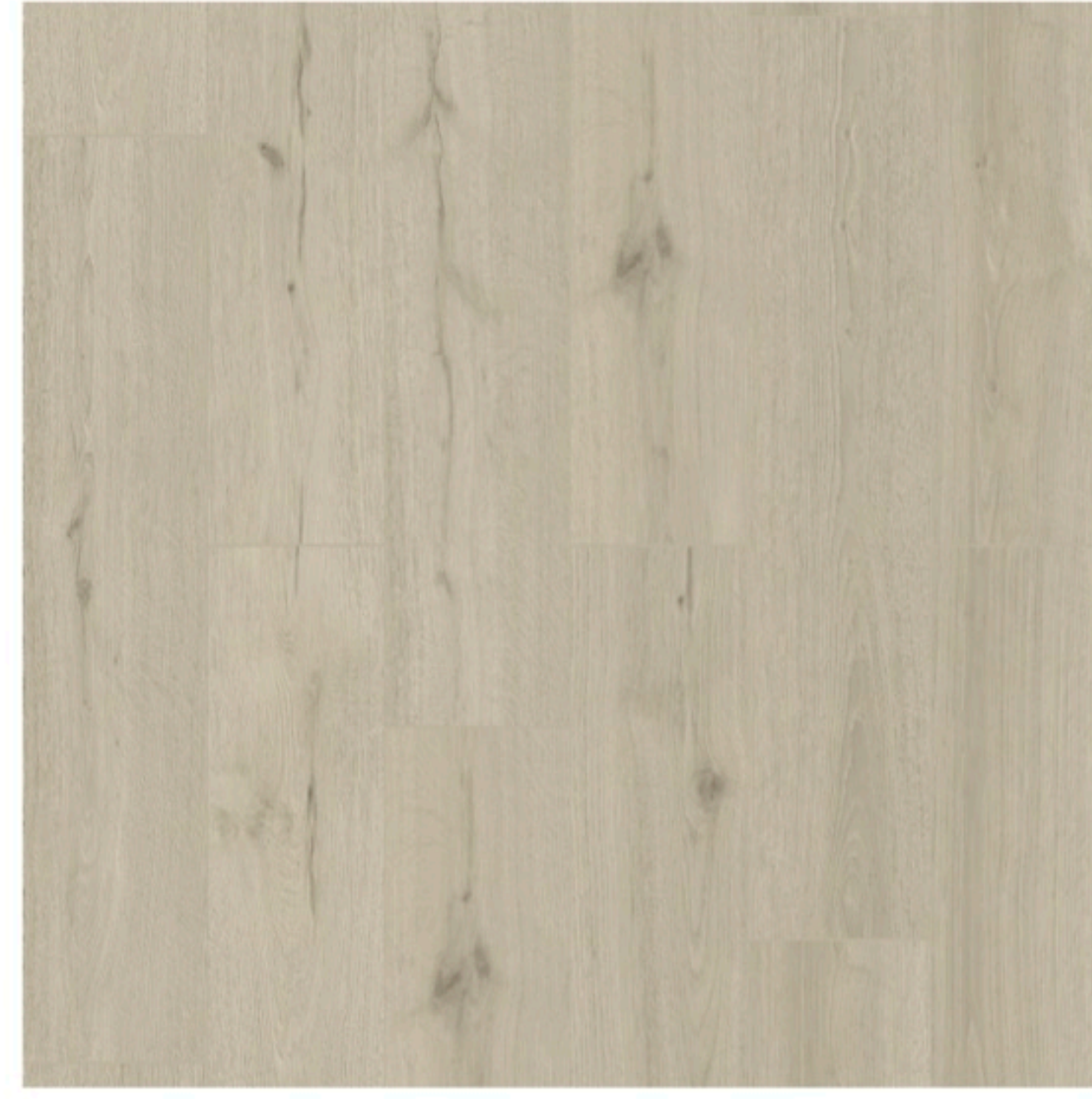
WTX 07 ELM