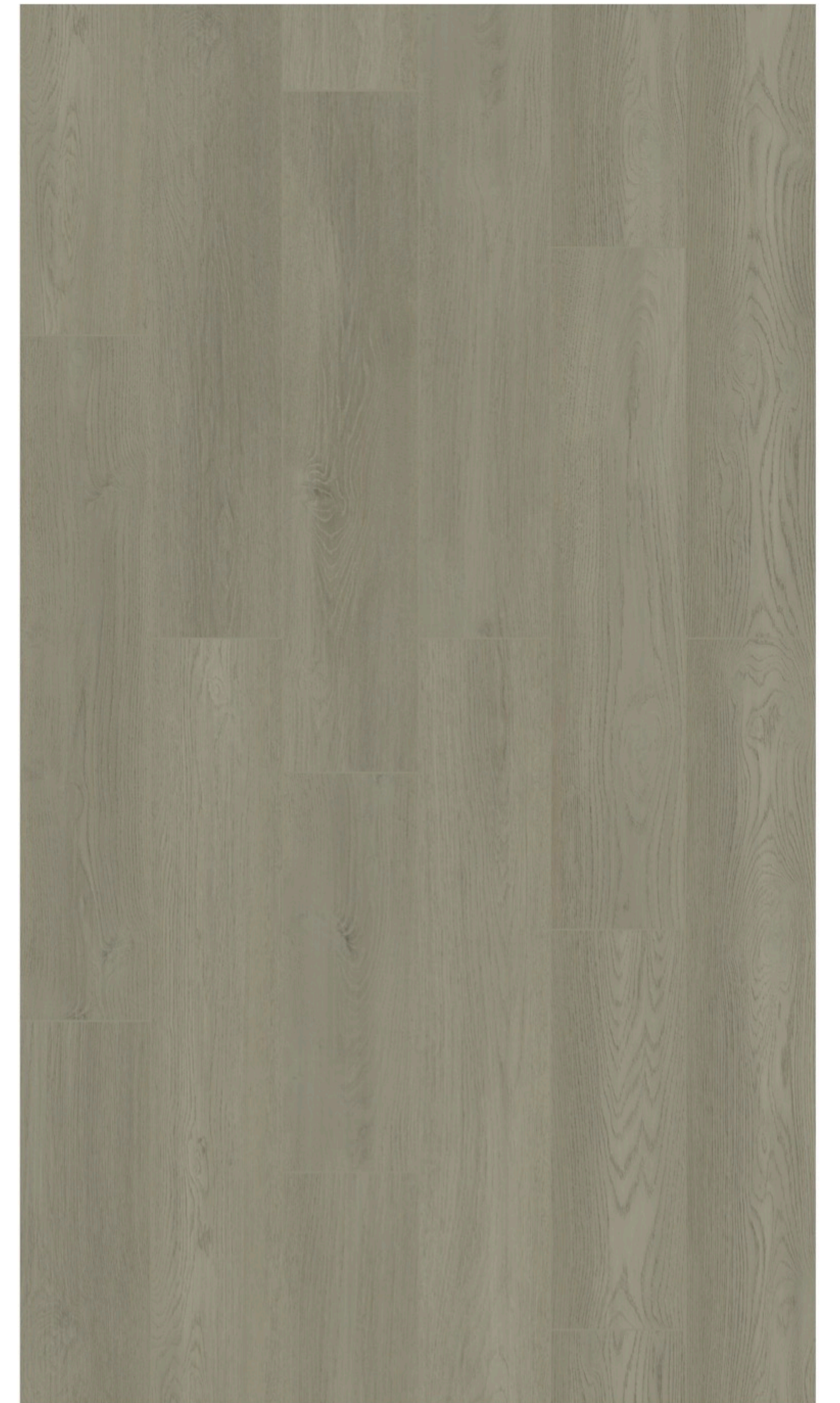
WTX 10 IVY