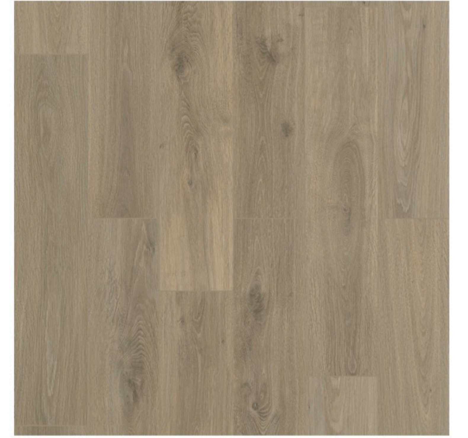
WTX 02 AMBER