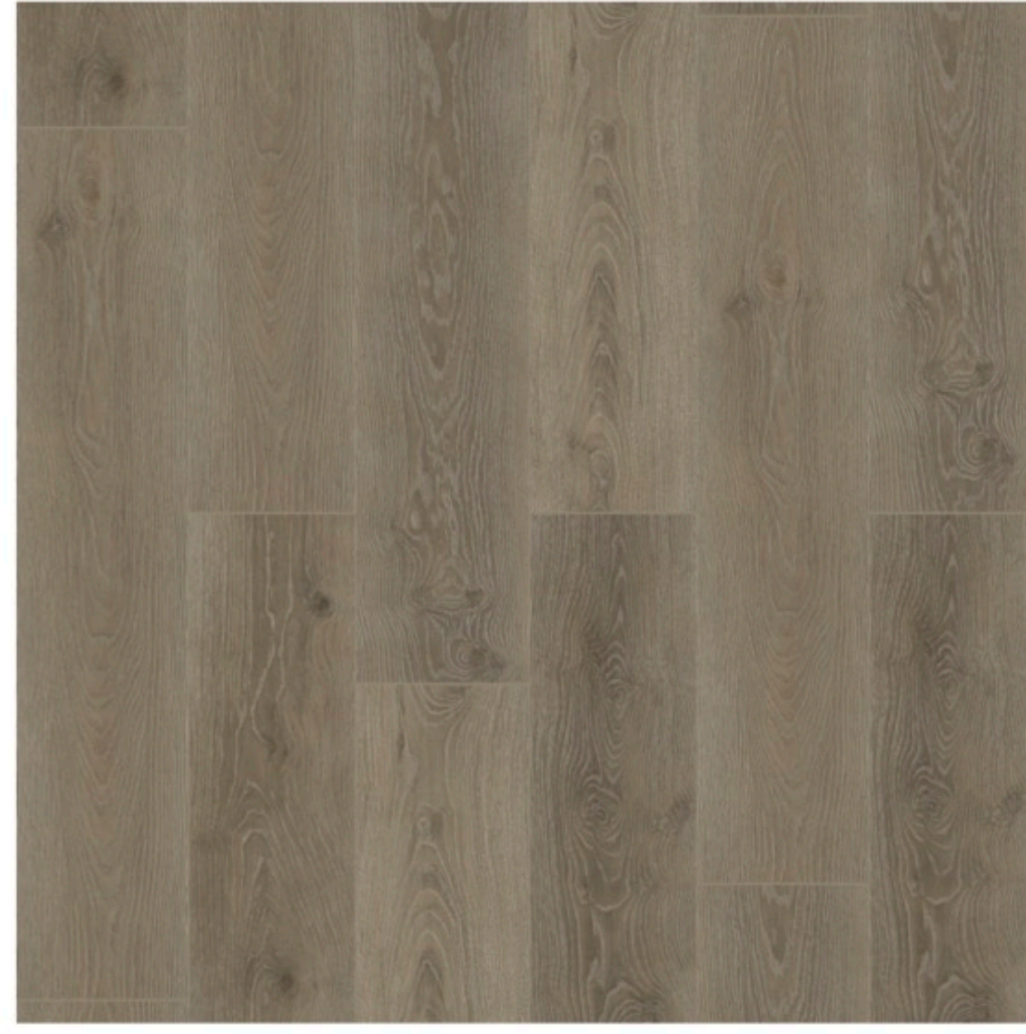
WTX 04 MAPLE