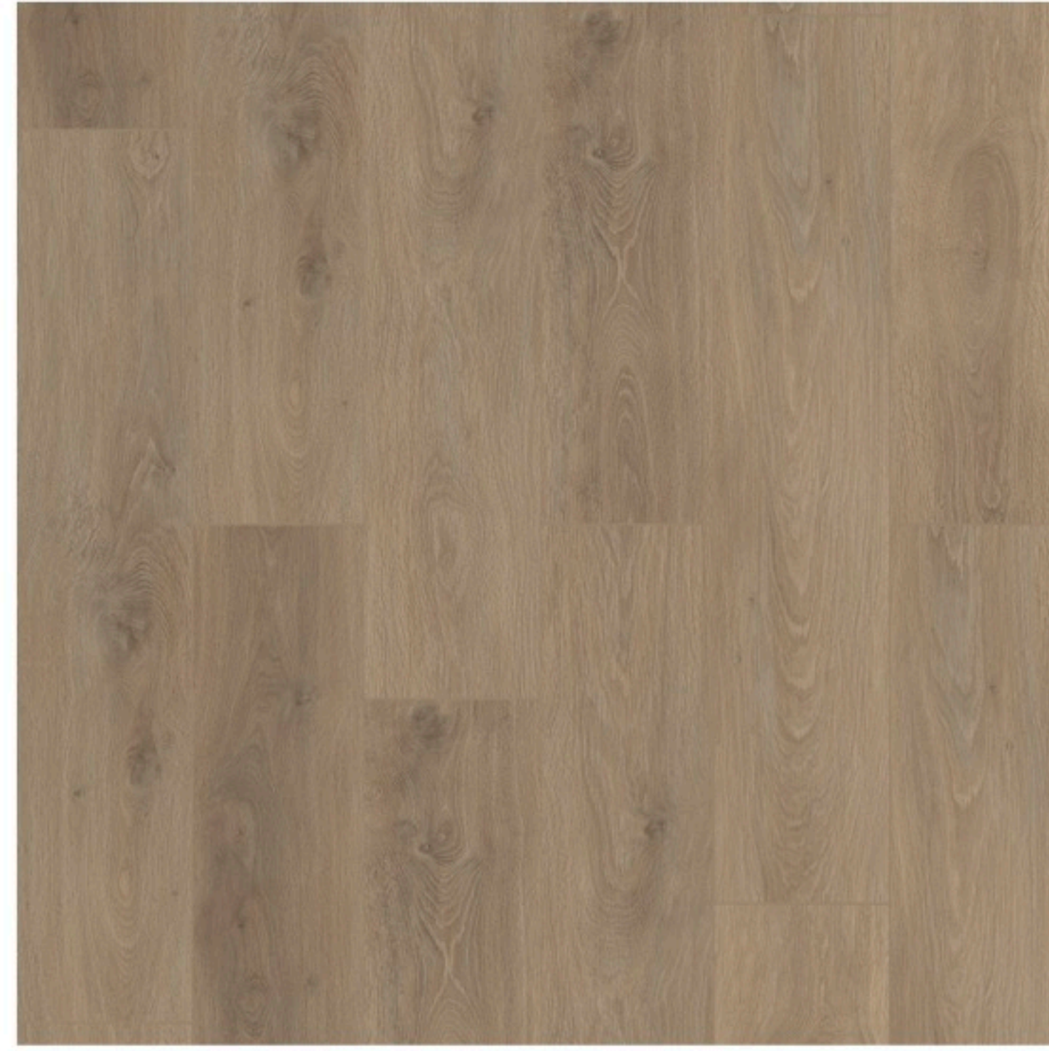
WTX 01 HAZEL