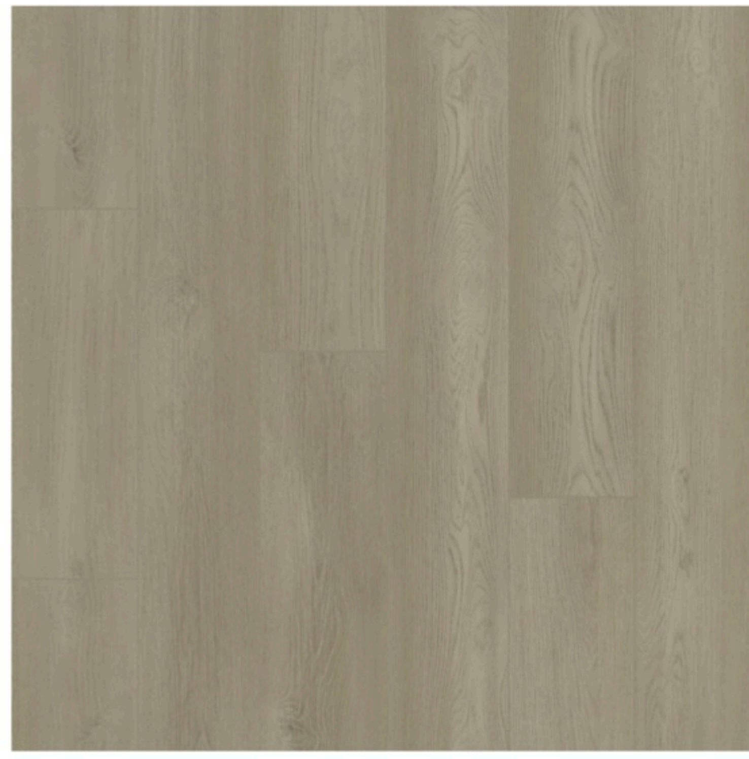
SW 706 MAGNOLIA