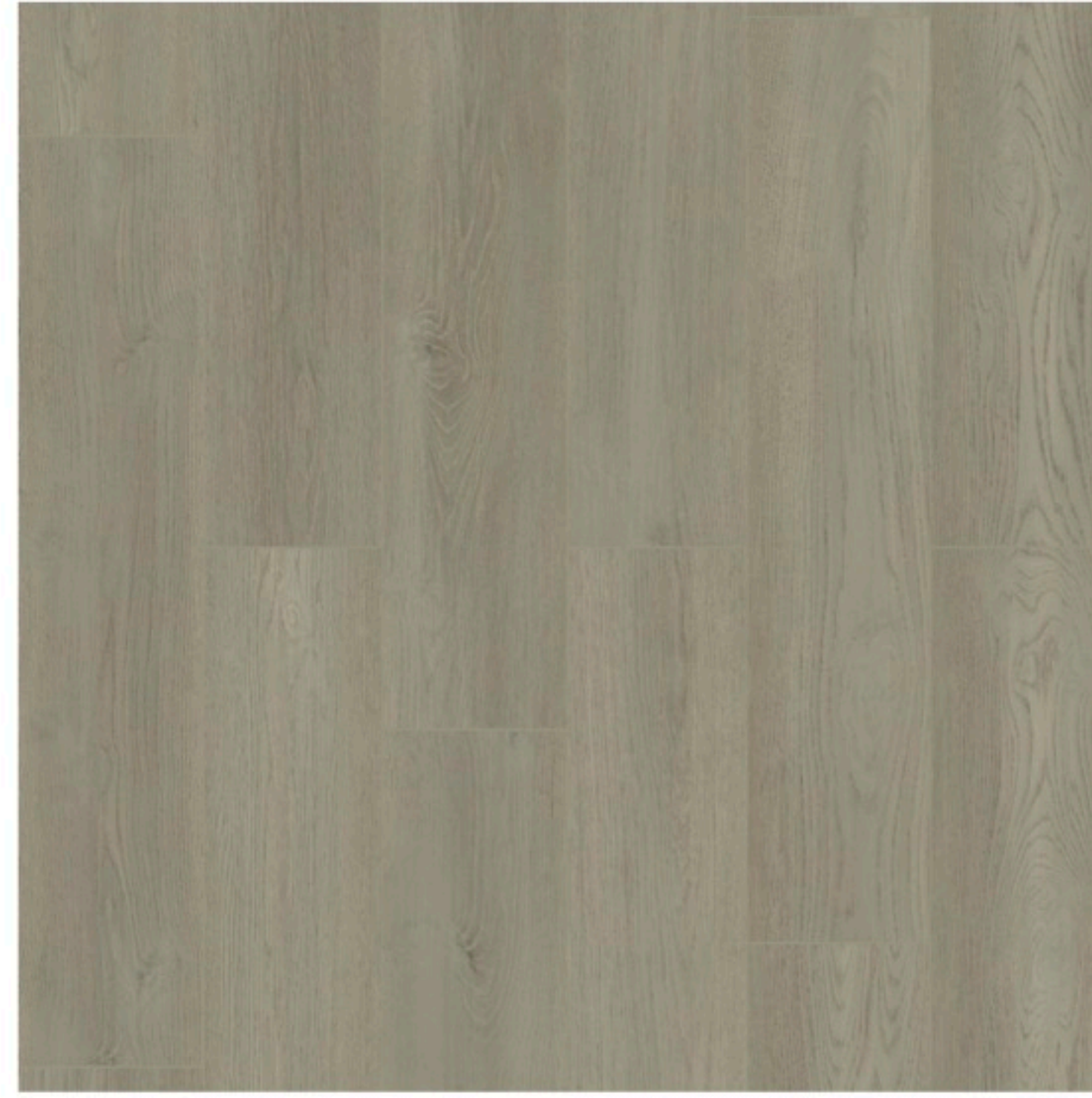
SW 710 SLATE