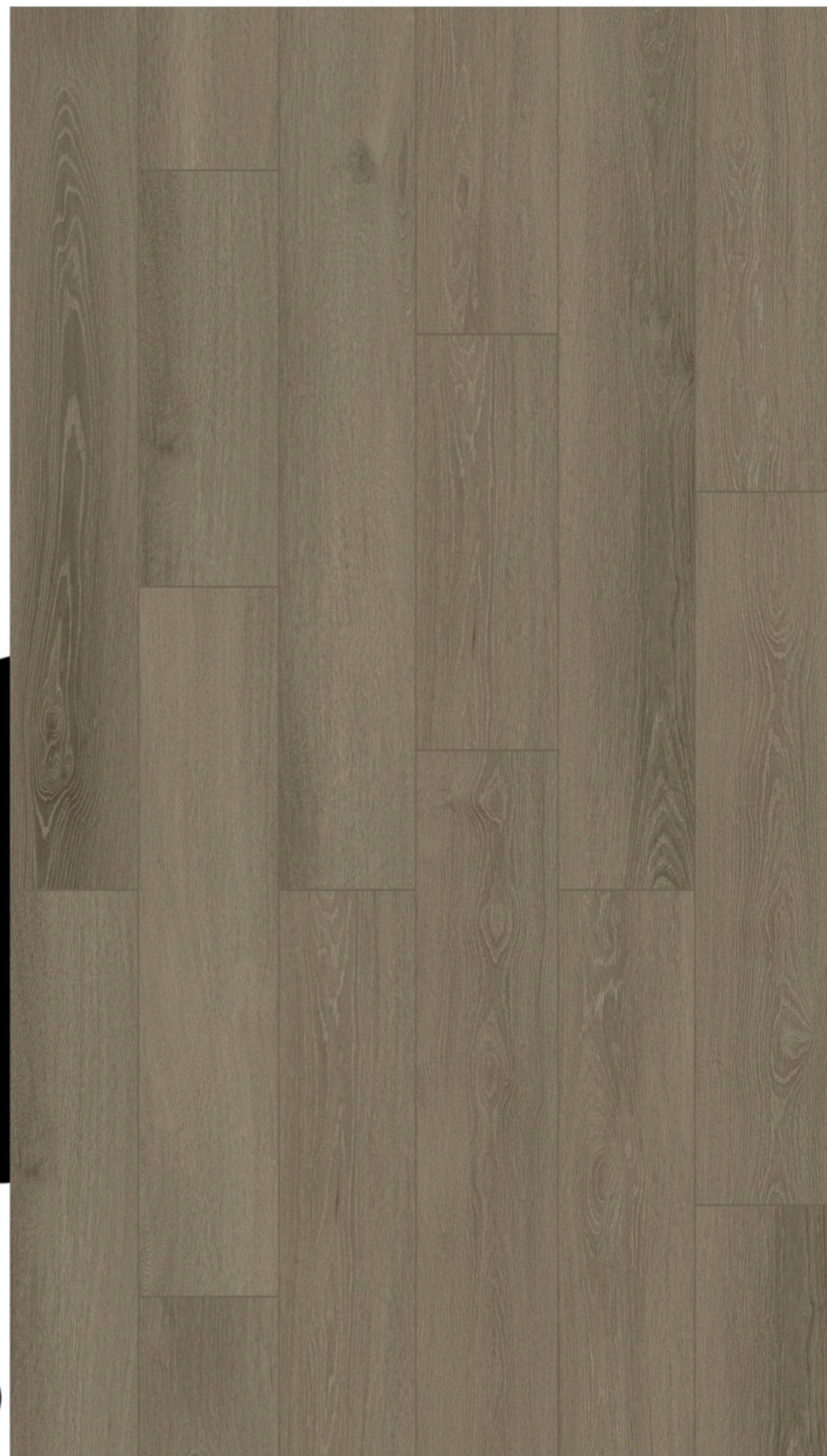
SW 601 WILLOW