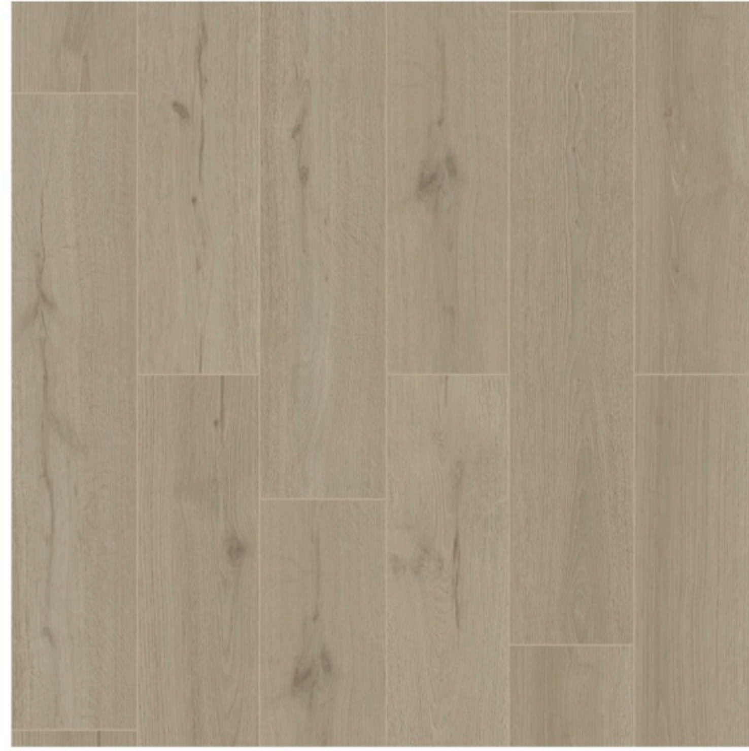
SW 309 PALM