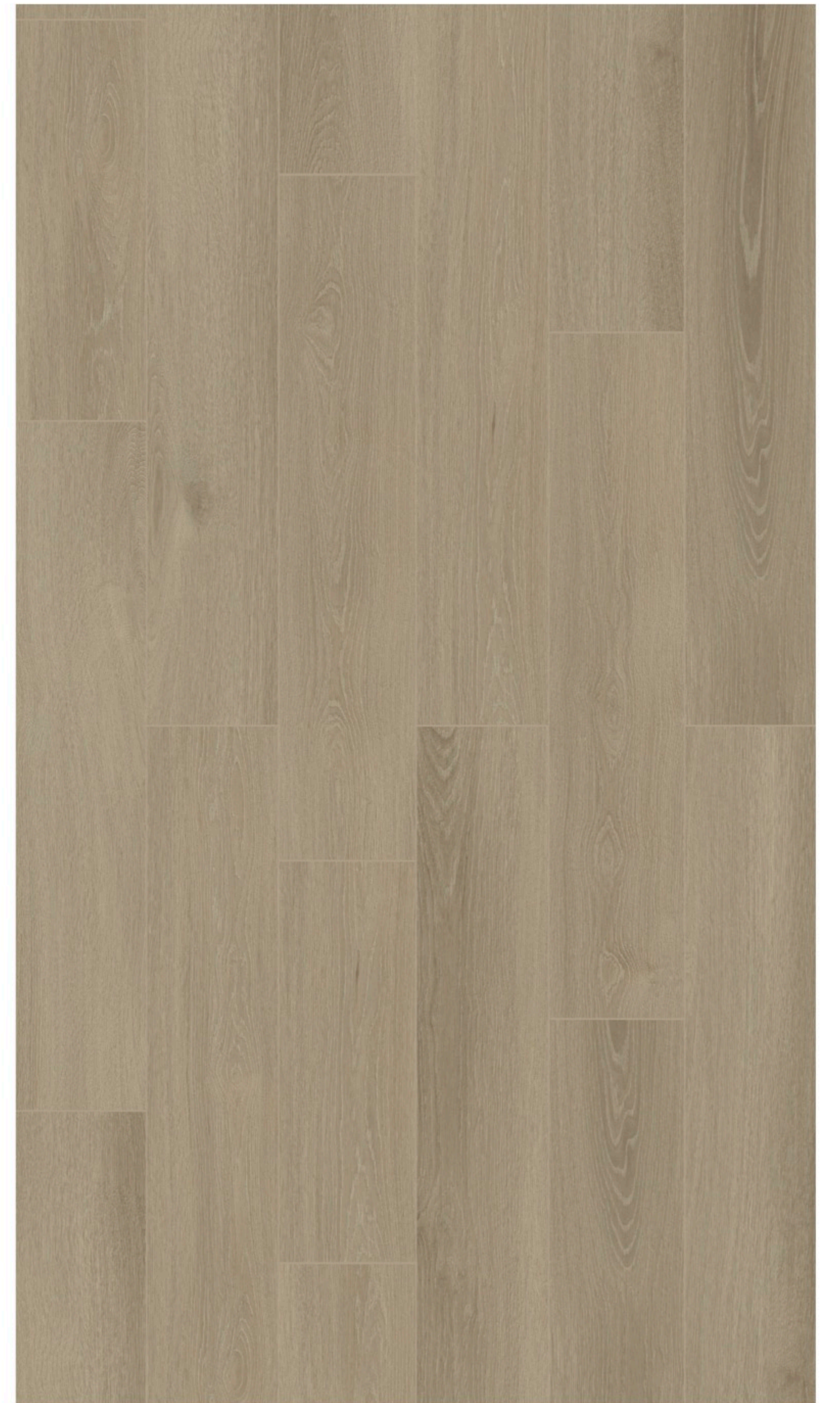
SW 607 JUNIPER