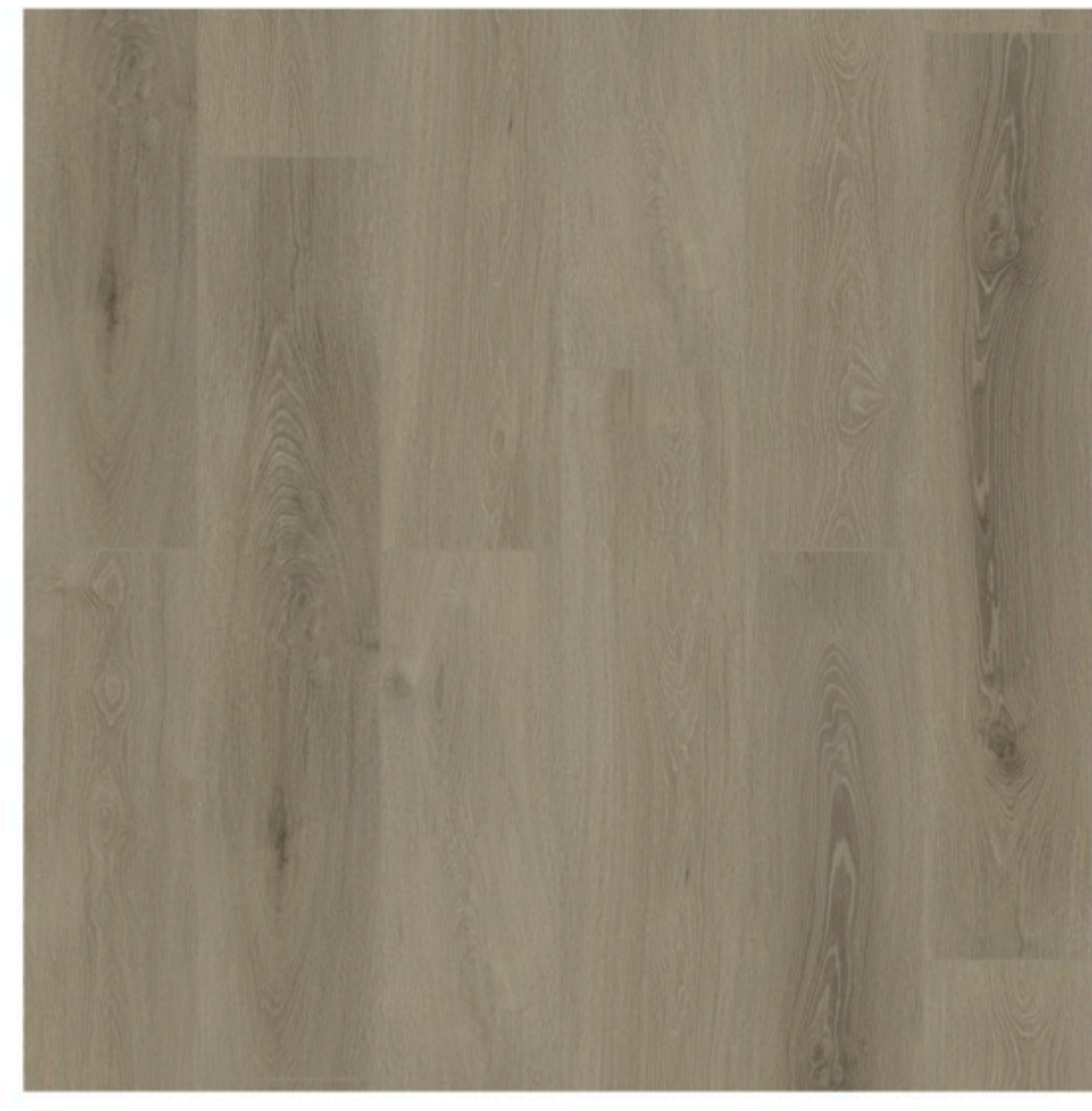
SW 602 ROSEMARY