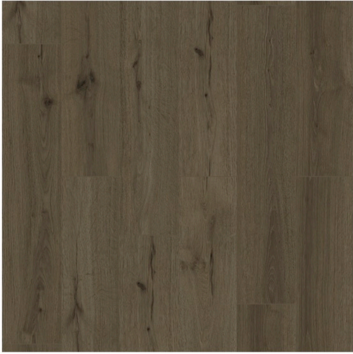
SW 301 CEDAR