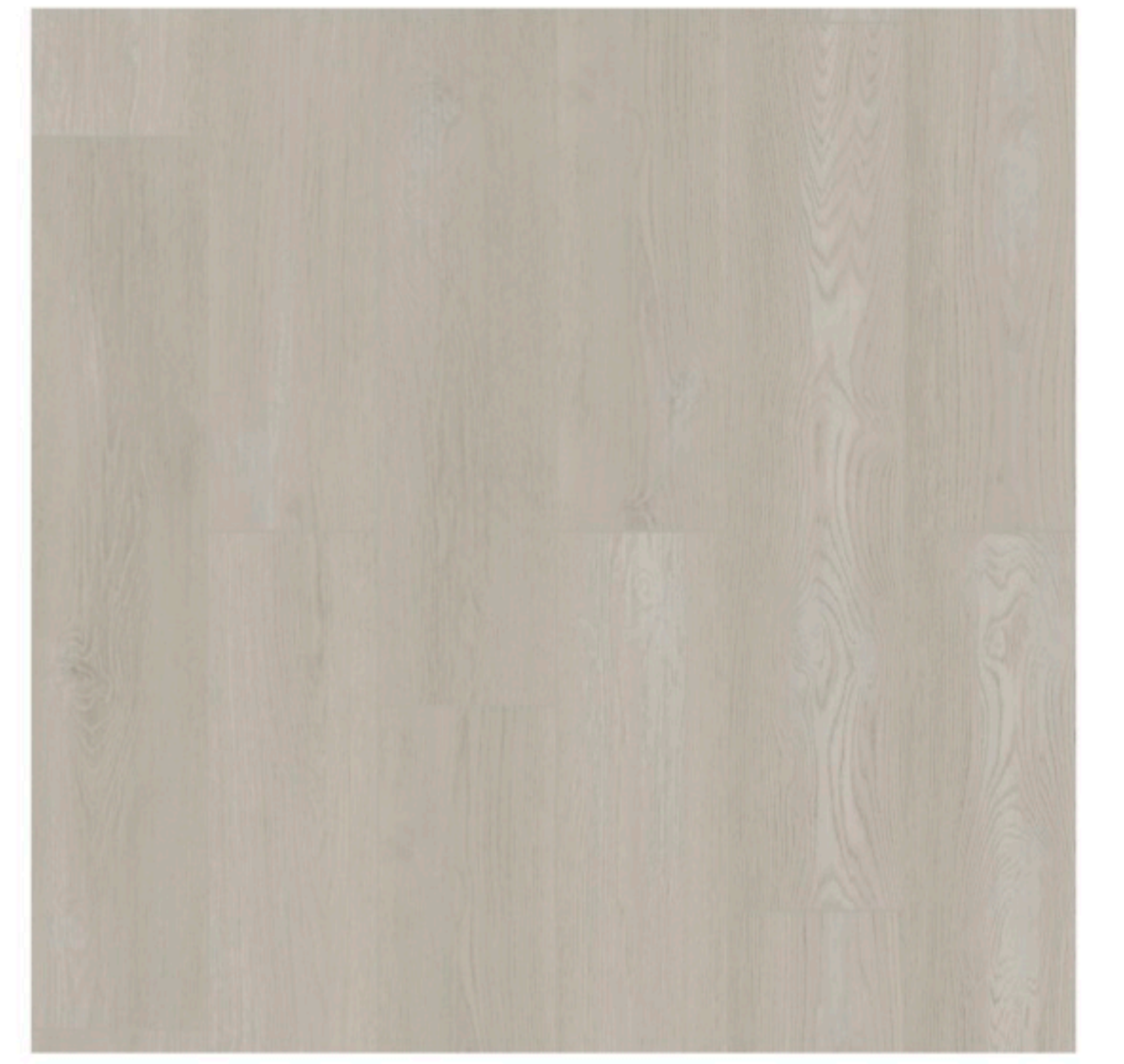
SW 708 CHALK