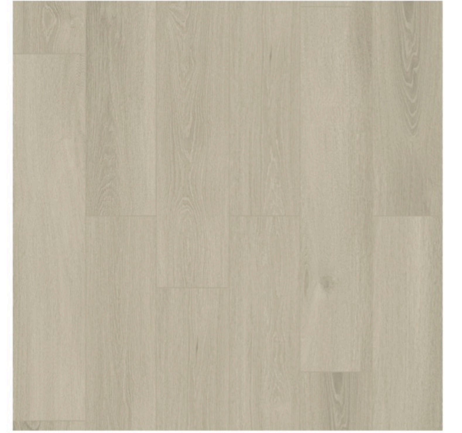
SW 604 EUCALYPTUS