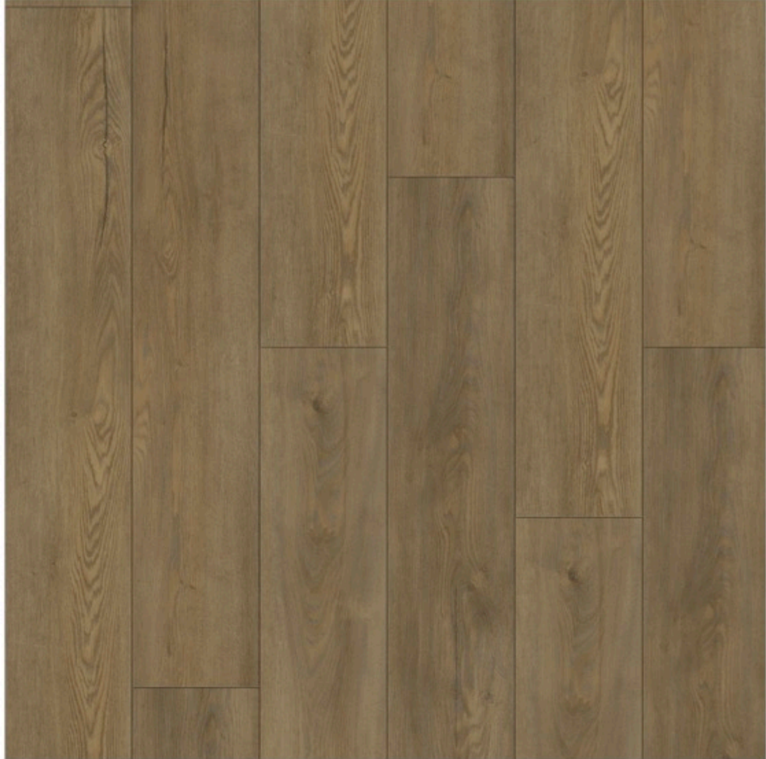
GEN 813 VAIL