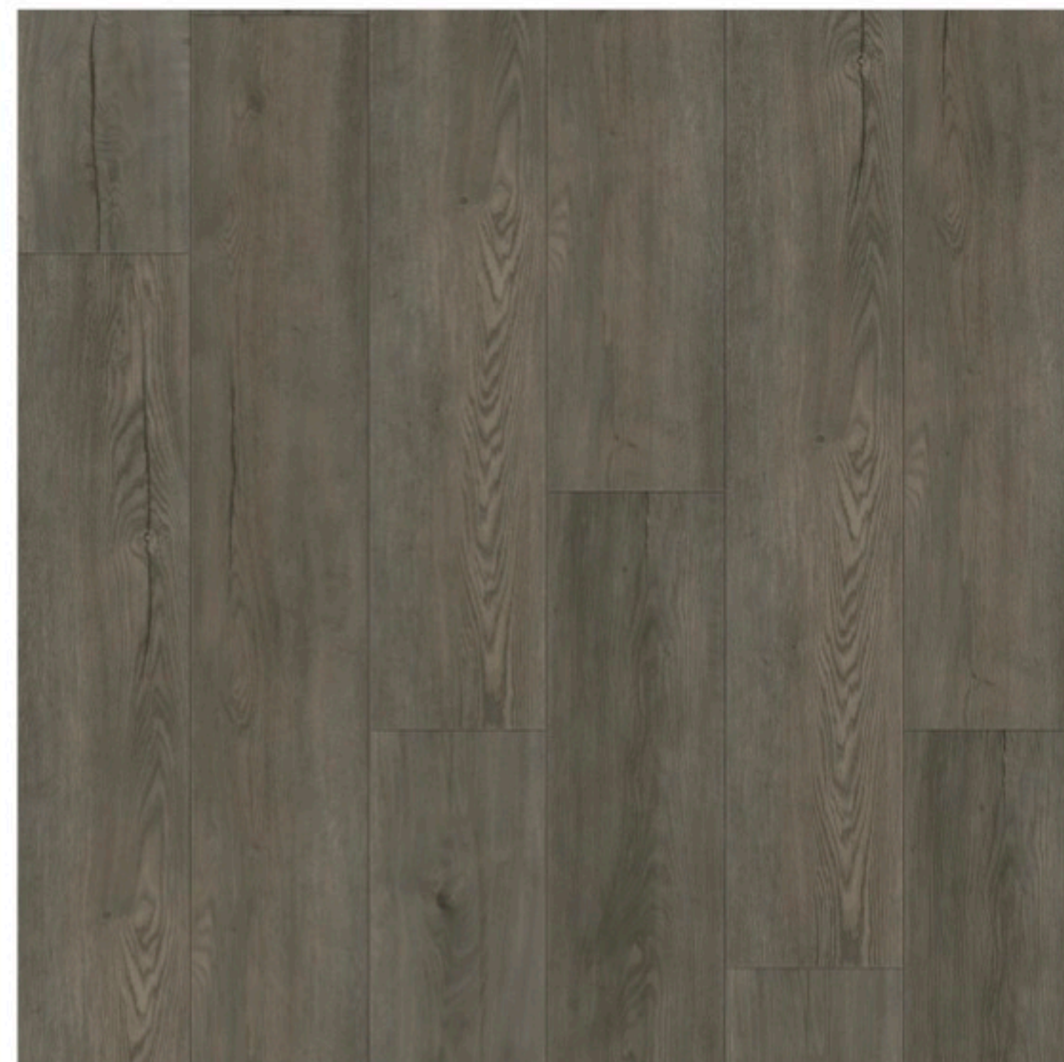
GEN 809 AVON