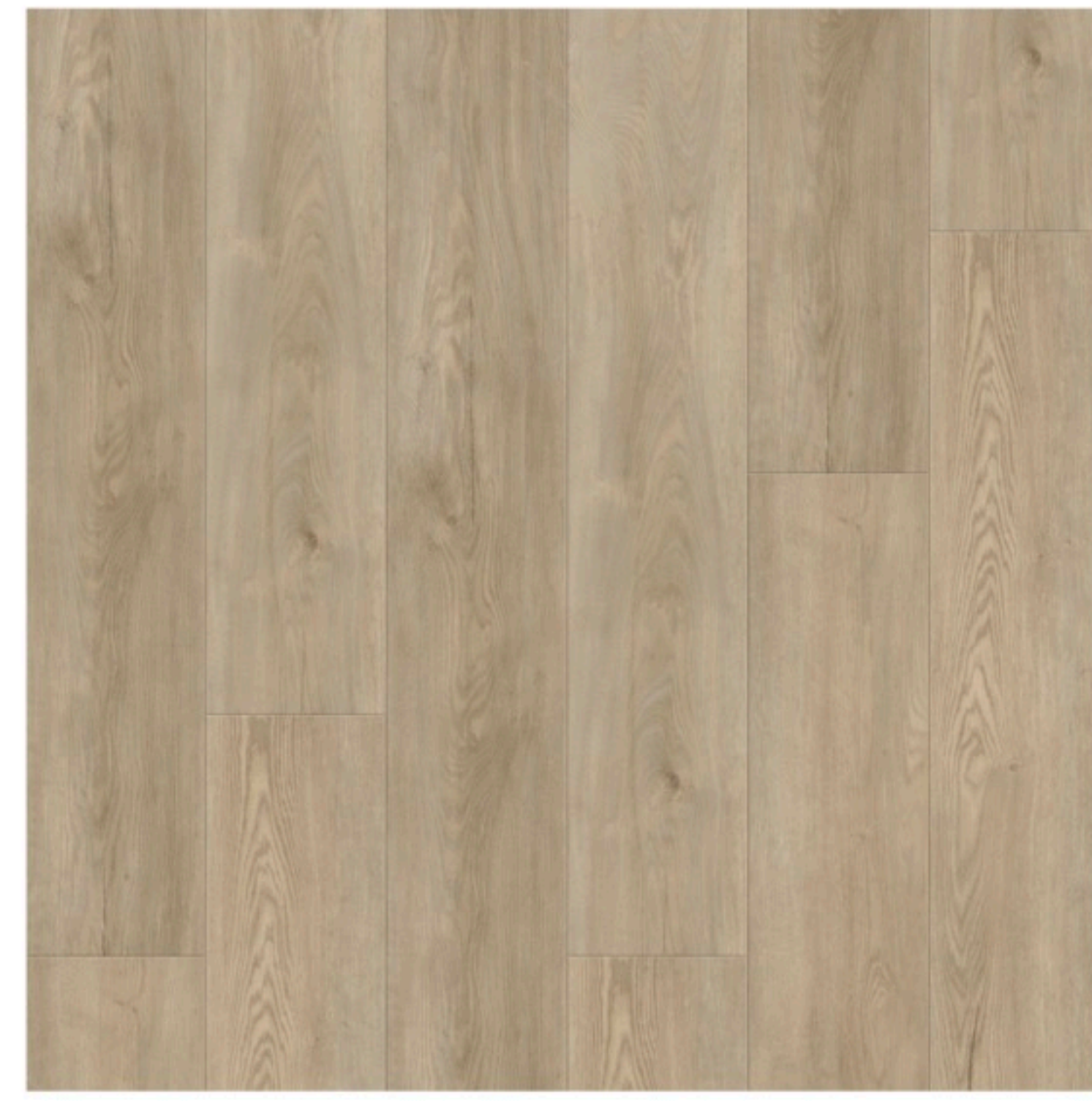
GEN 817 SEDONA