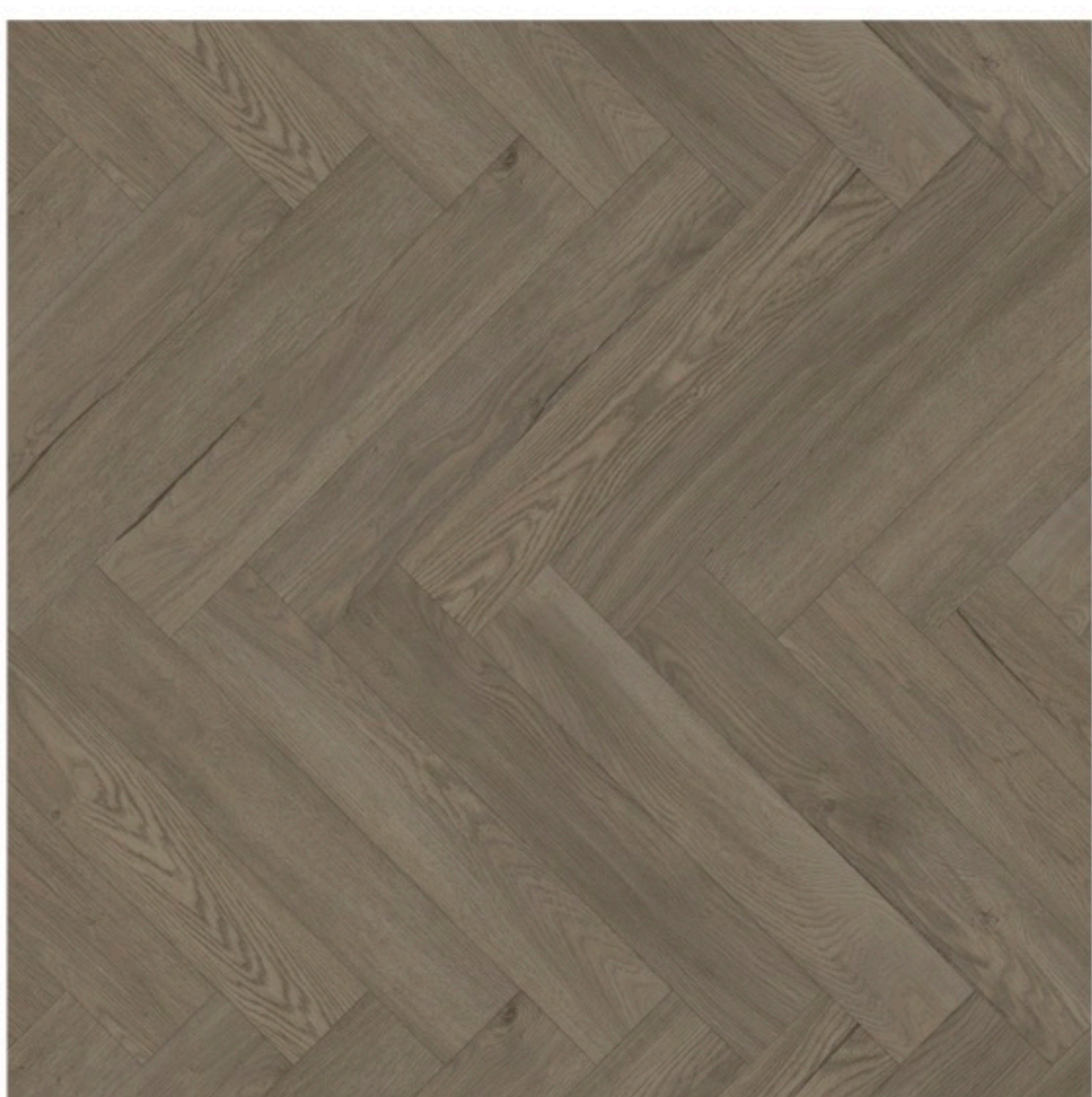
ACX 503 PARK SLOPE COORDINATES WITH ROCKY