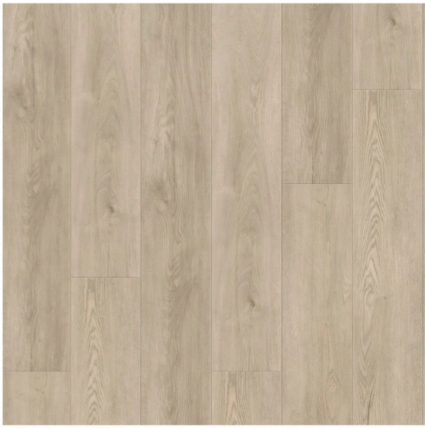
GEN 816 DESERT DUSK