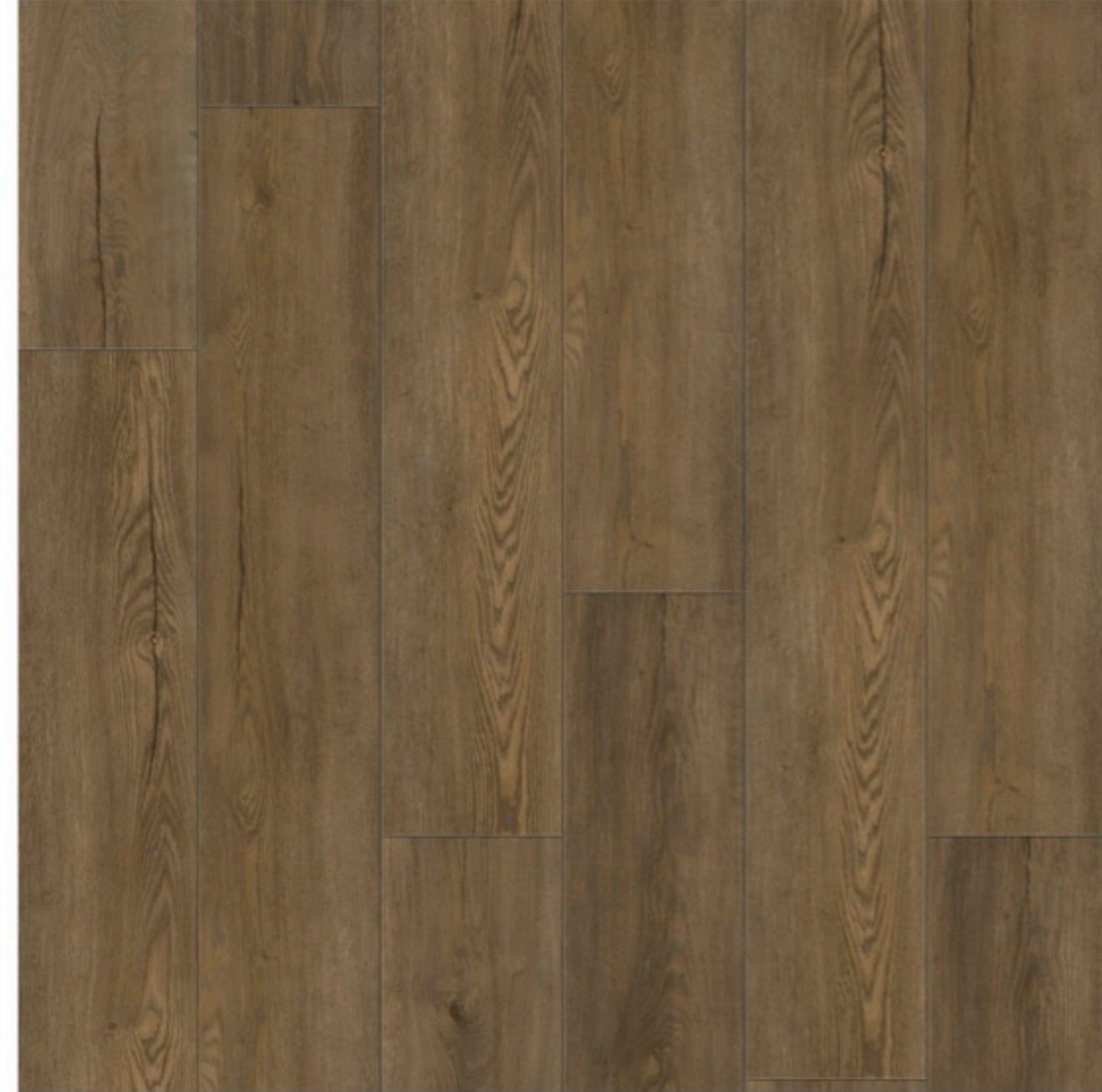
GEN 810 BROOK