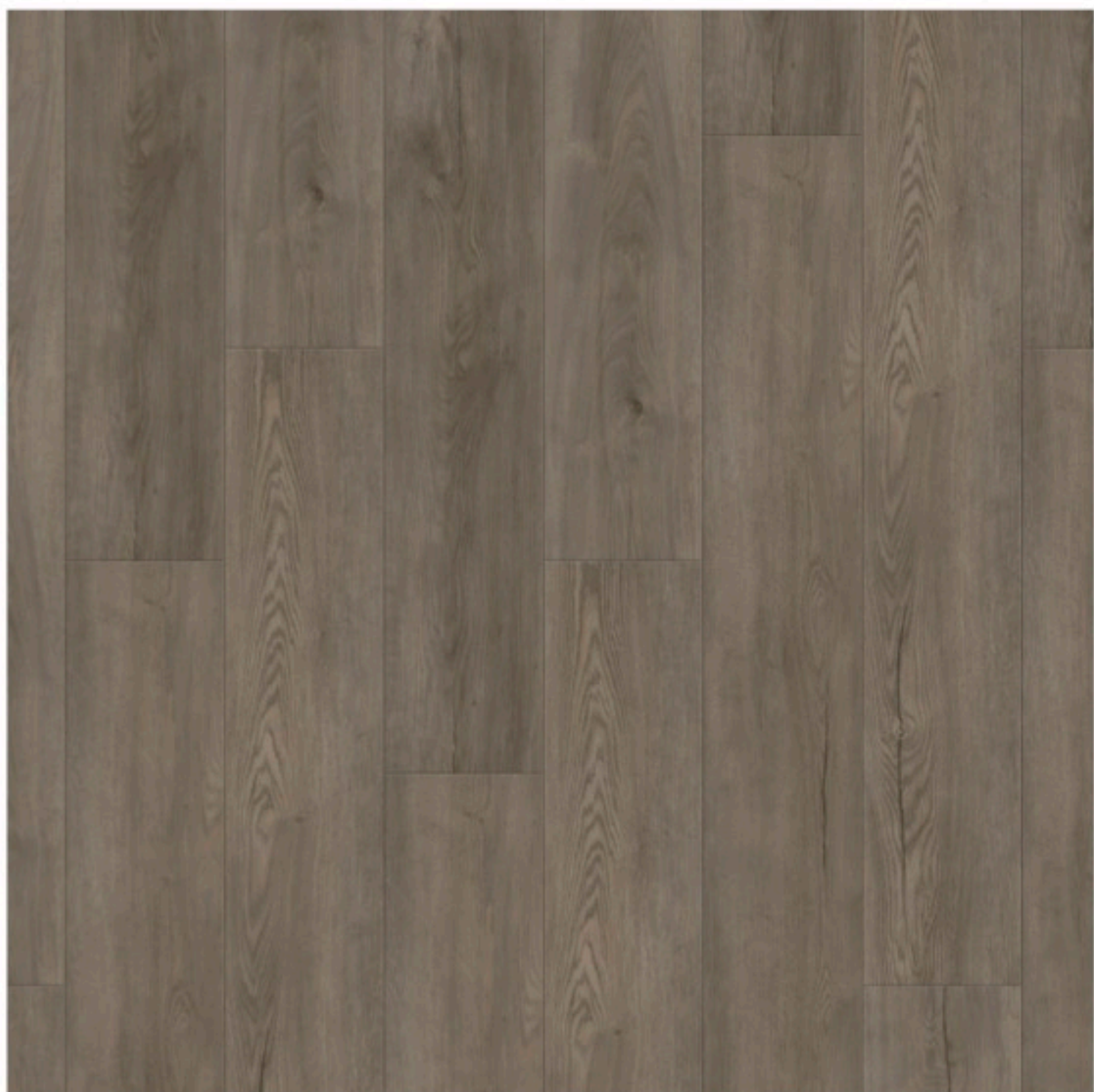
GEN 808 ROCKY