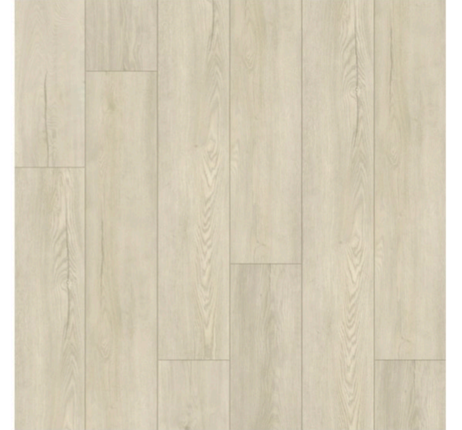
GEN 812 BRECKENRIDGE