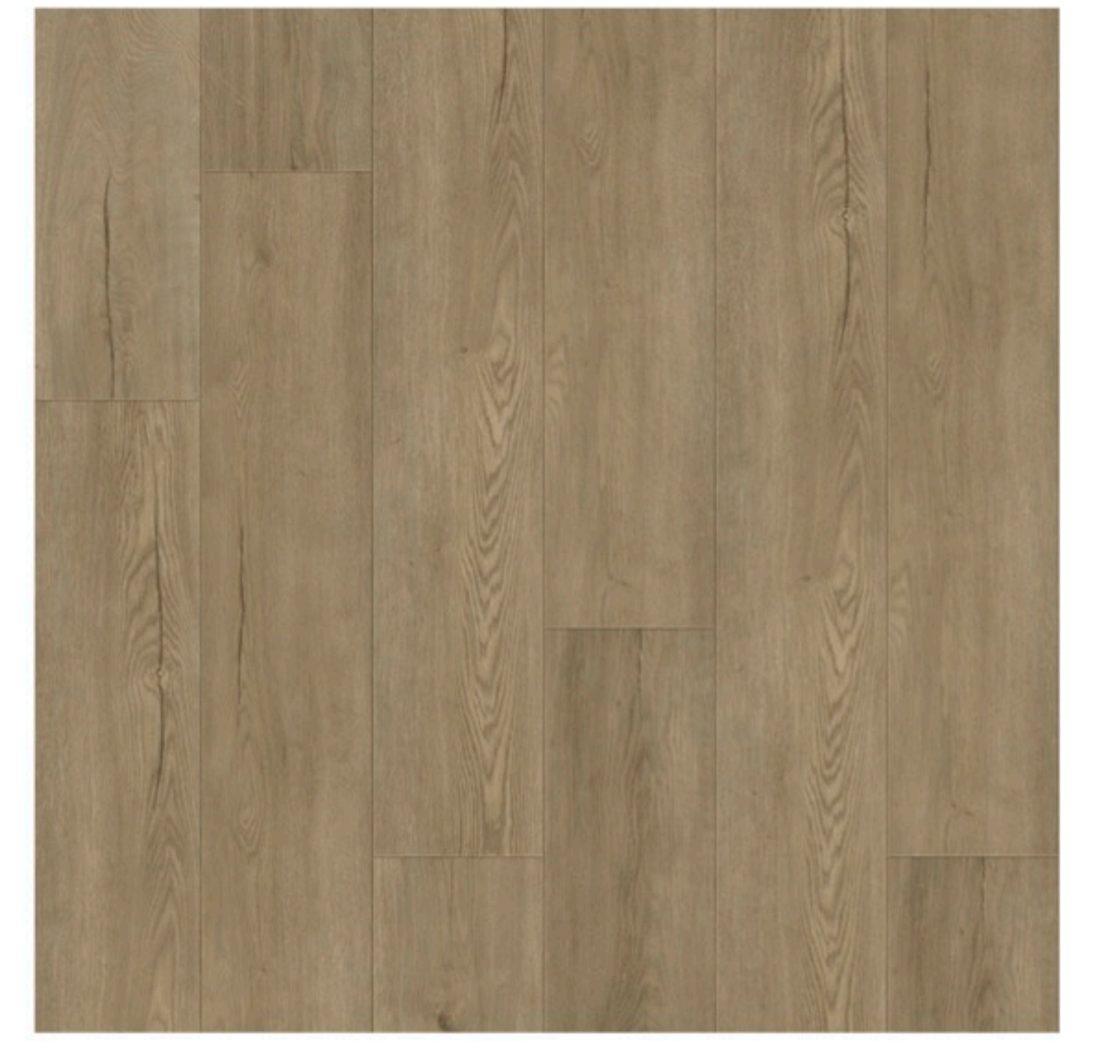
GEN 819 ST. JOHN