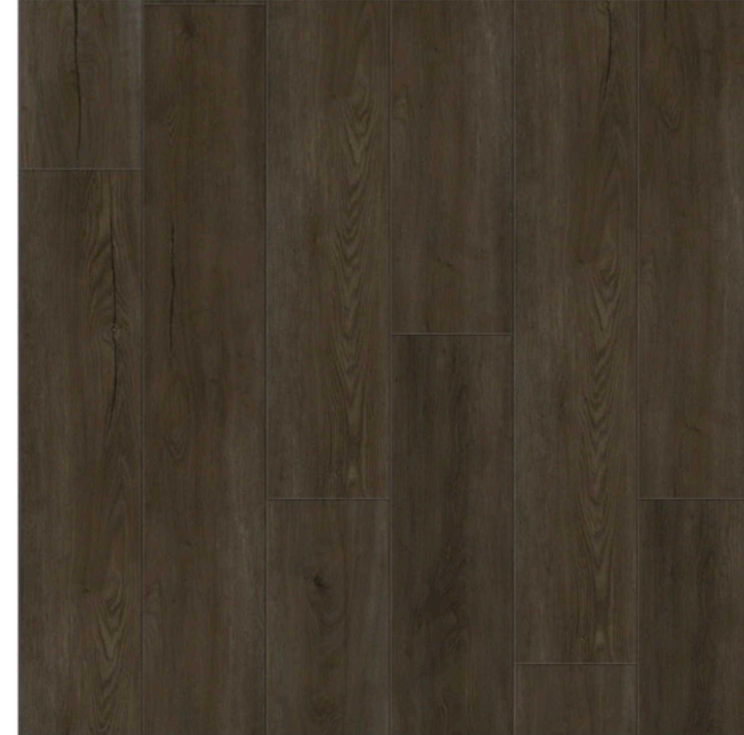
GEN 811 ROAN