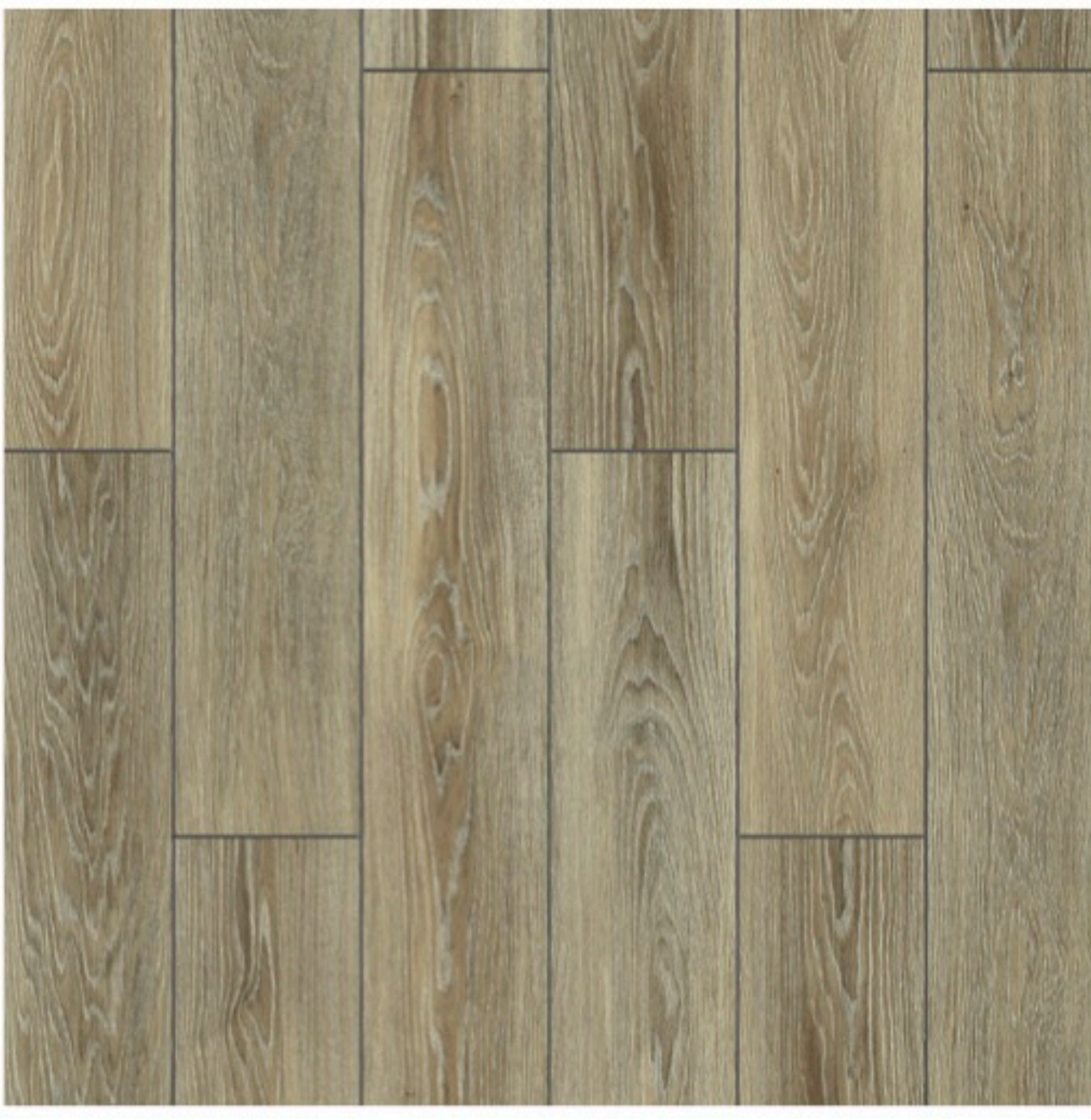
FN 17 FAIRBANKS