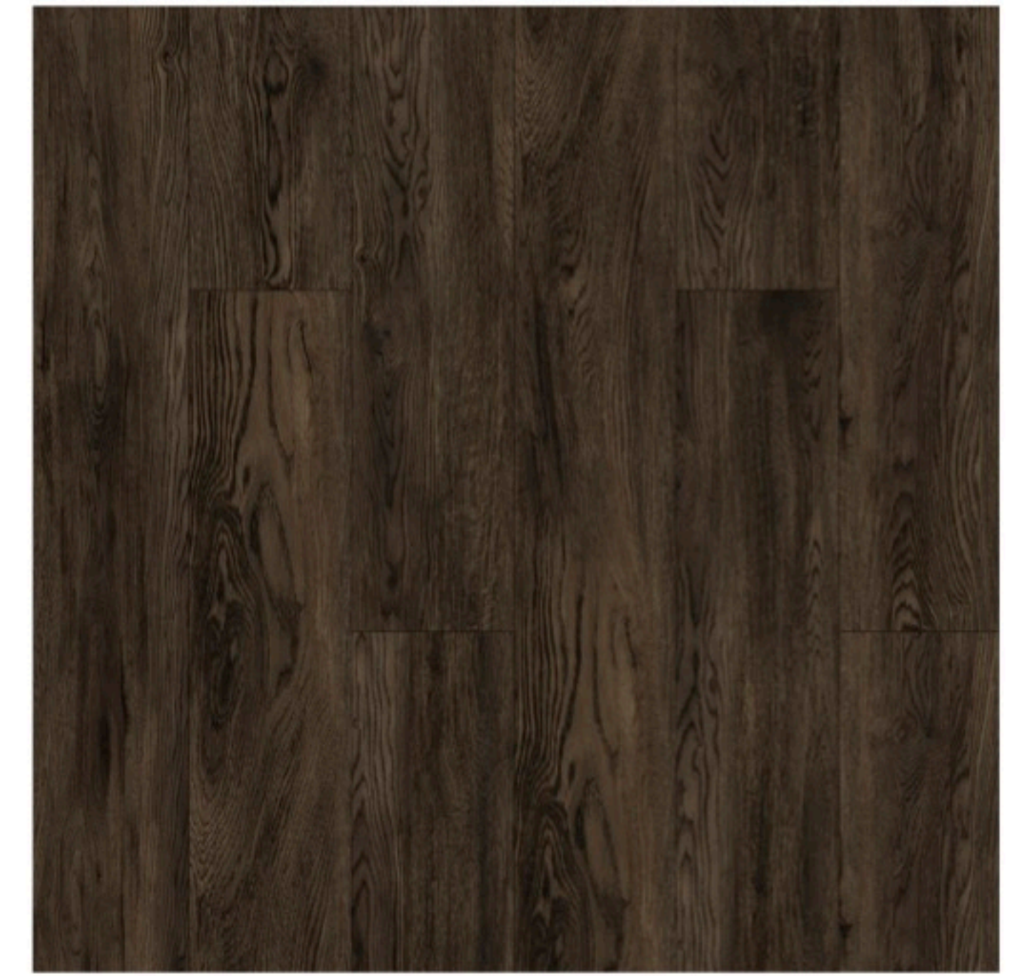
FN 12 CANYON