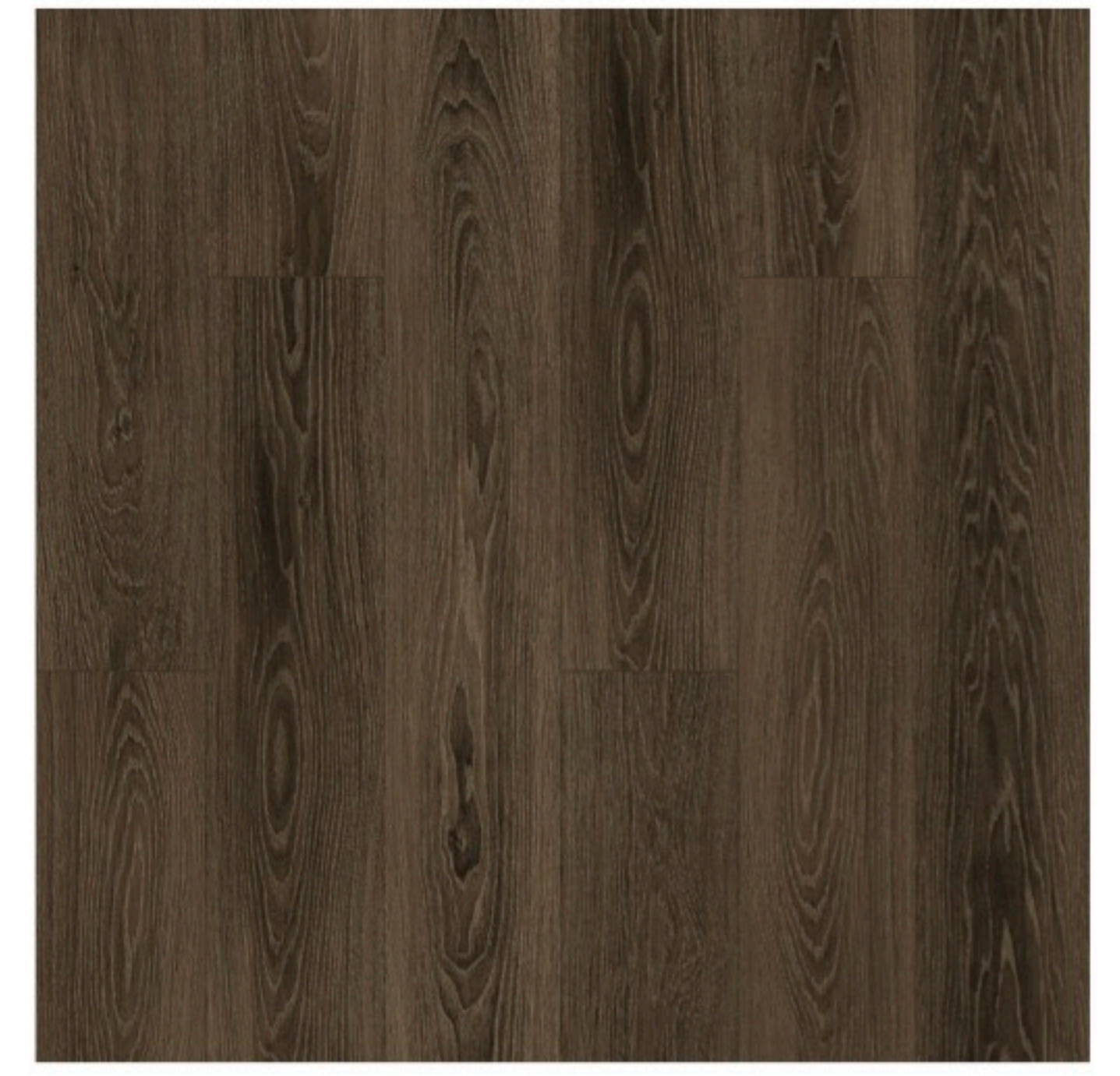
FN 08 TERRAIN