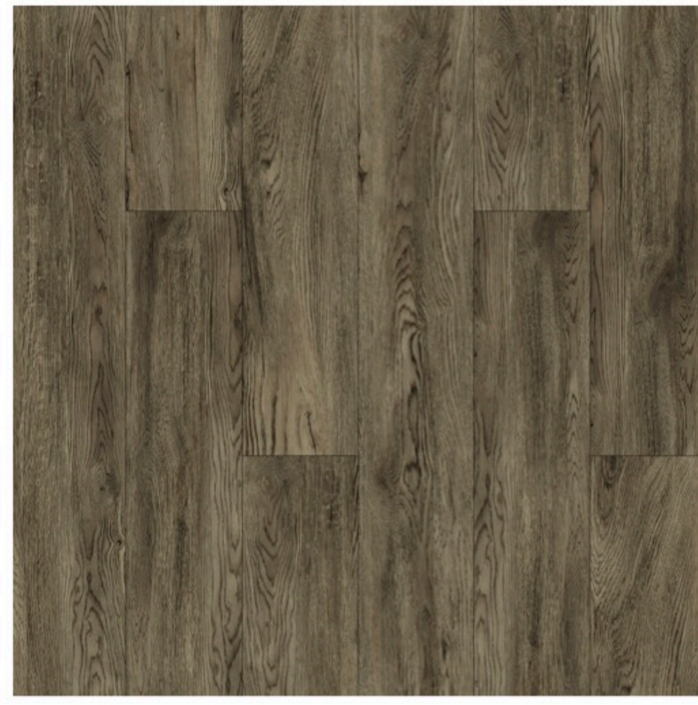
FN 14 VALLEY