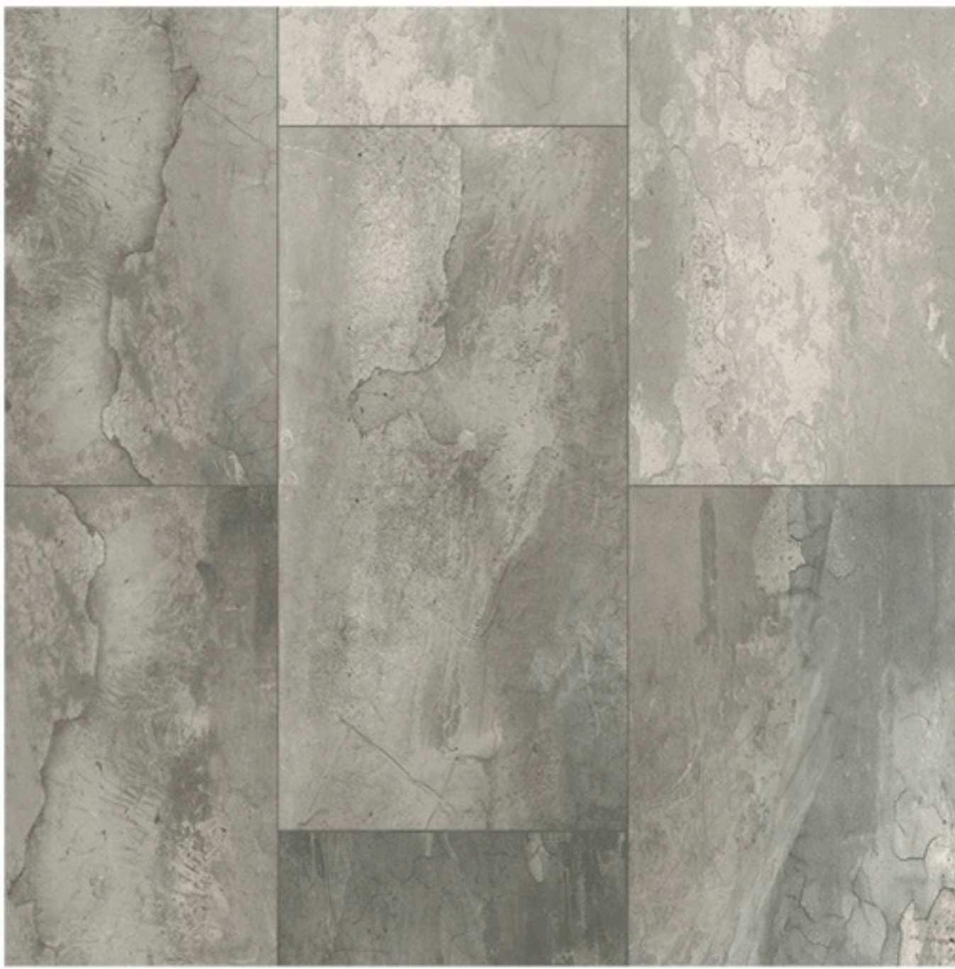
FN 20 BLISS