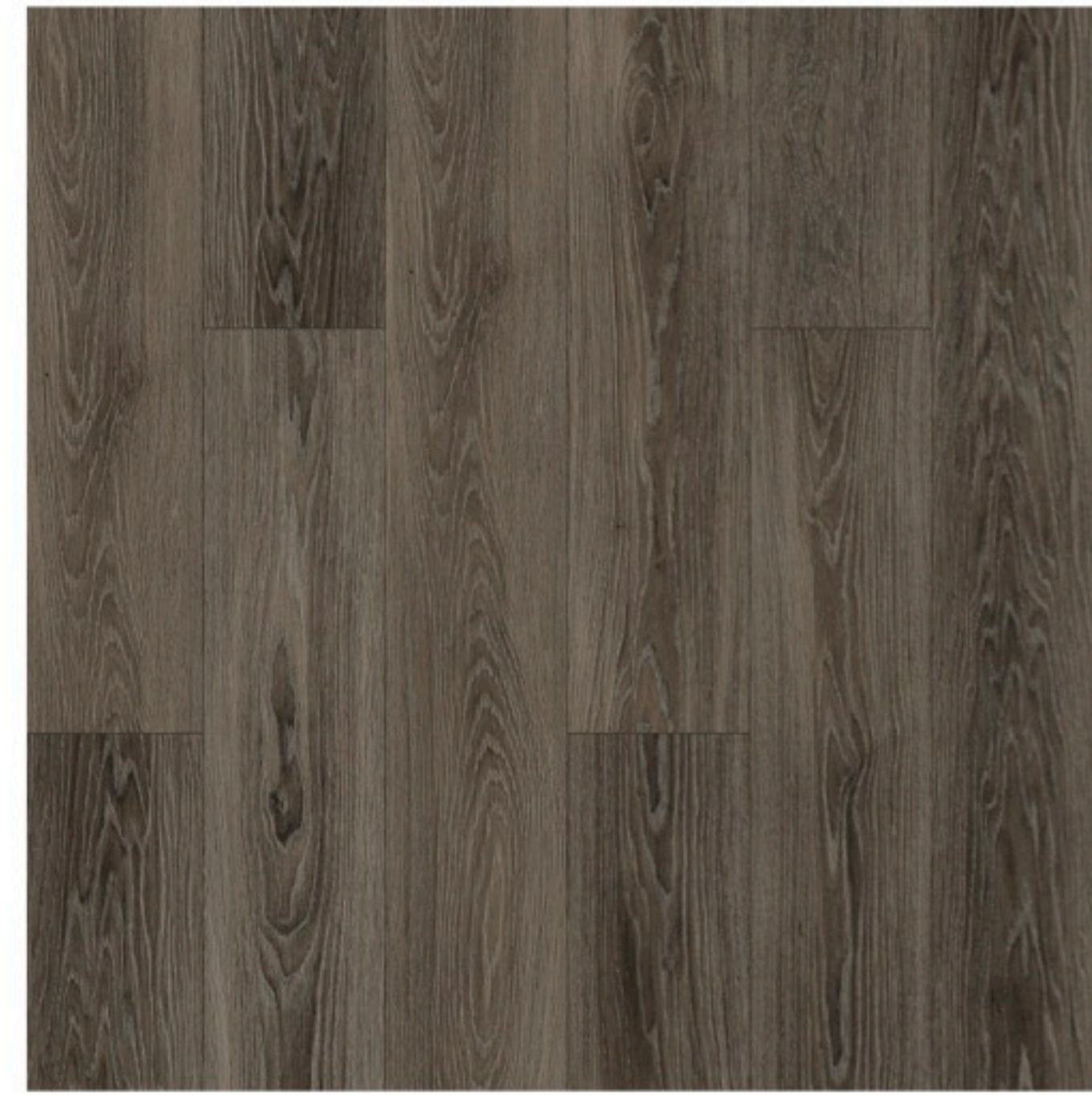
FN 06 PLYMOUTH