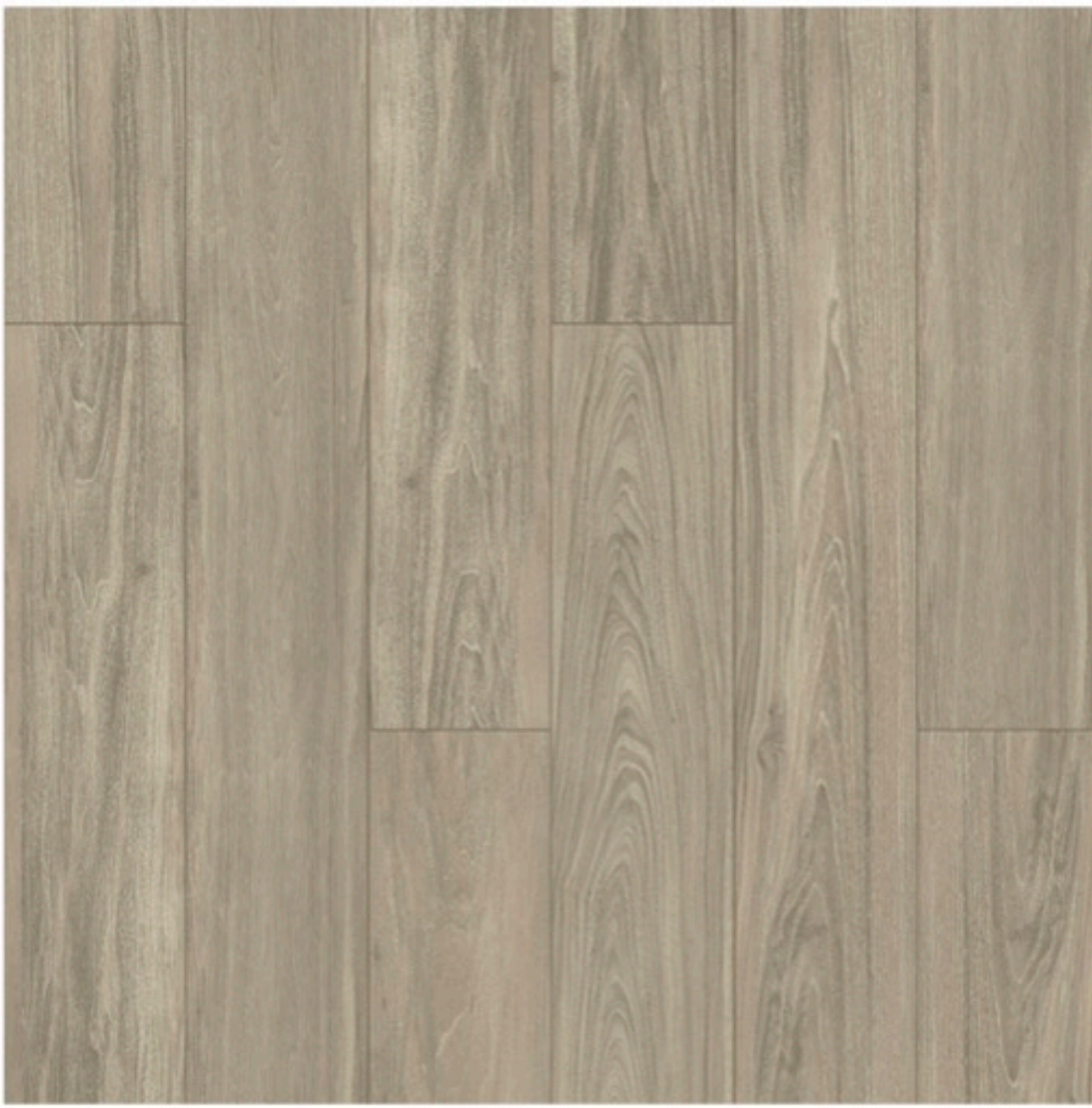
FN 30 MARTHA'S VINEYARD