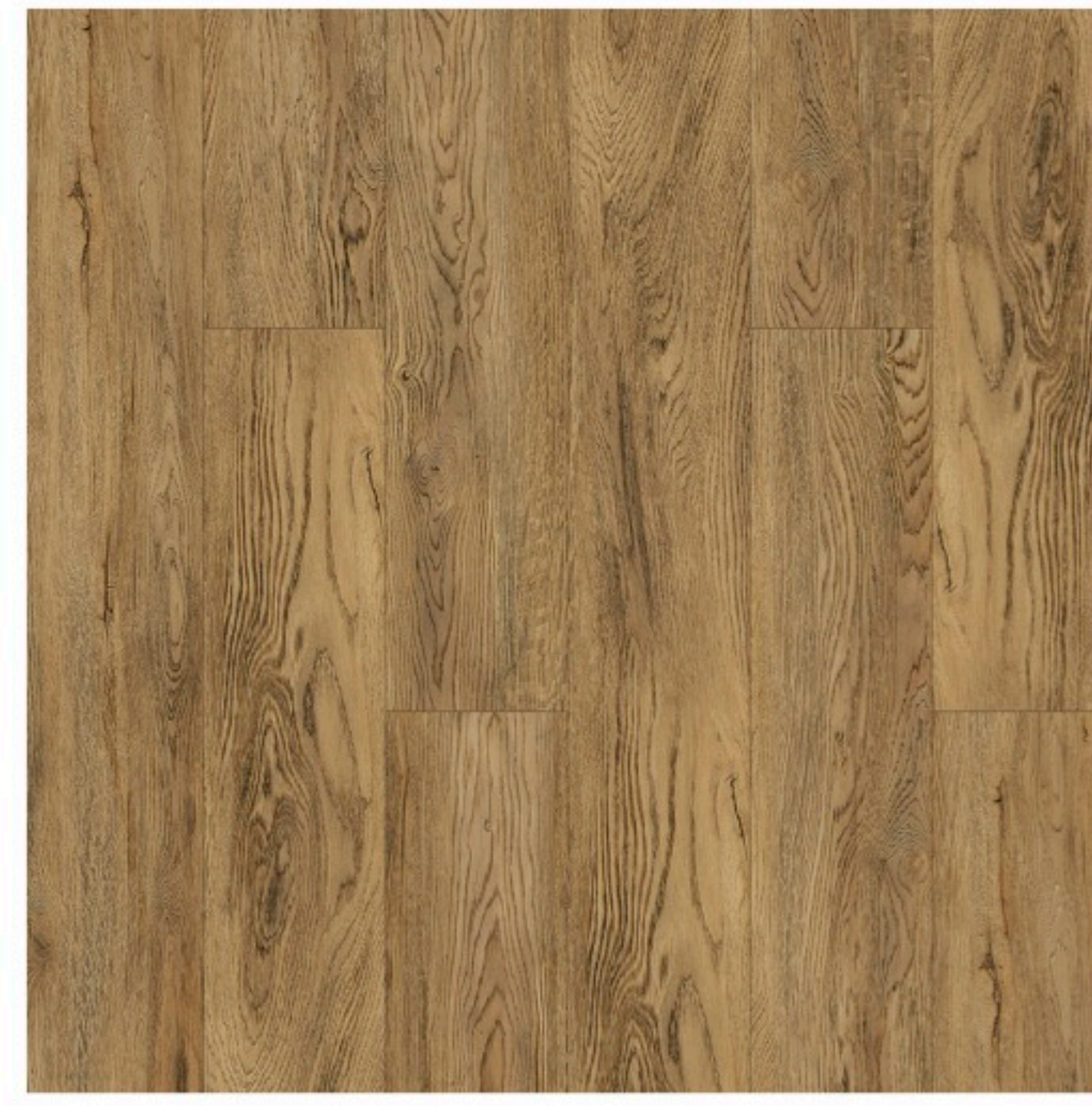
FN 11 APPLE WOOD