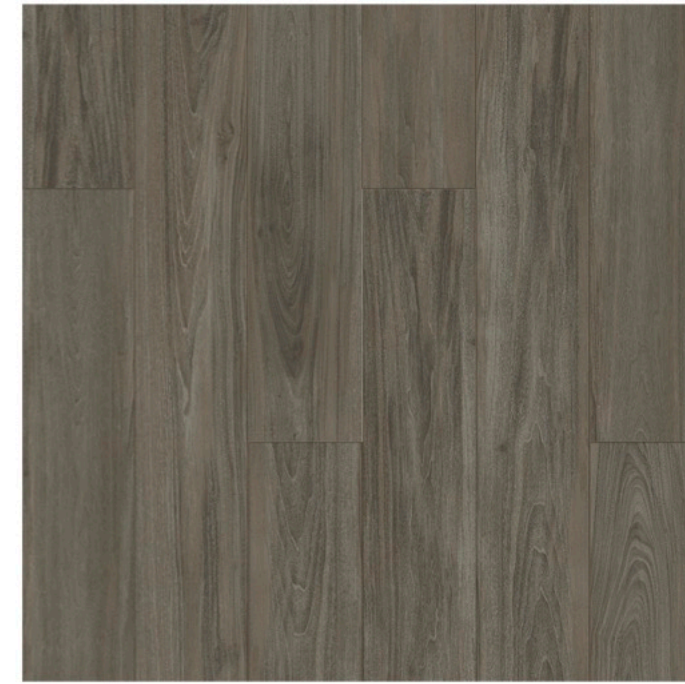
FN 31 BRISTOL