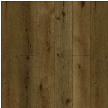
USA 308 SIERRA