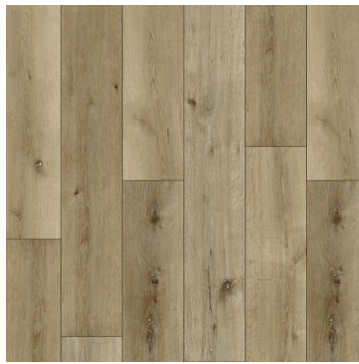
USA 301 SANTA BARBARA