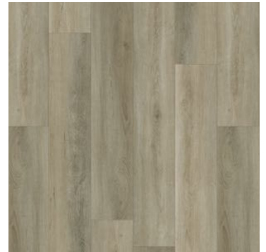
USA 307 MONTEREY