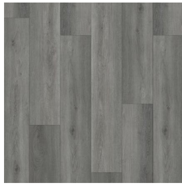
USA 302 PORTLAND