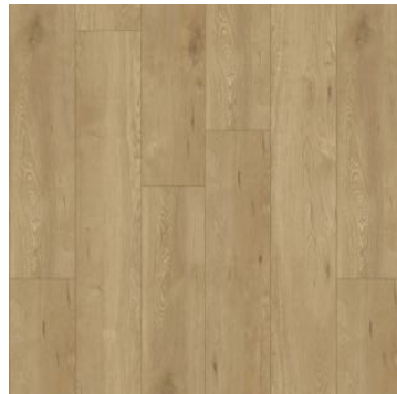
USA 309 WESTPORT