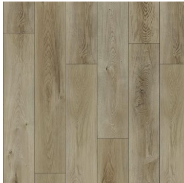
USA 305 DUNE