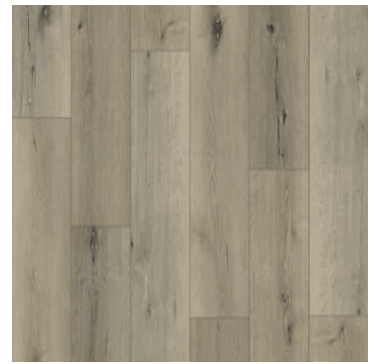
USA 303 SEAPORT