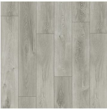
USA 300 AUSTIN