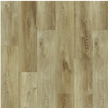
USA 304 NAPA