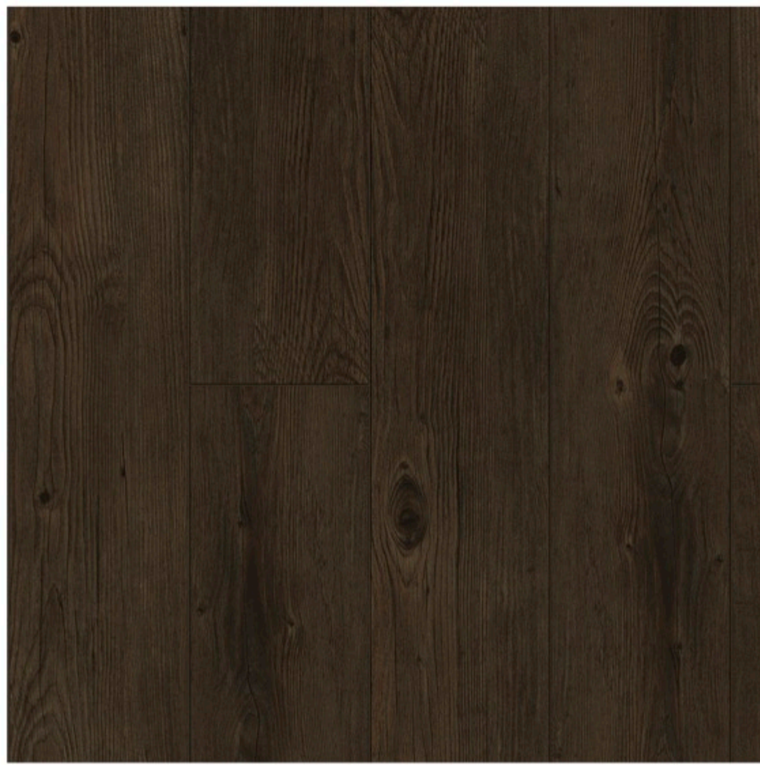
LOFT20 633 JACKSON HILL