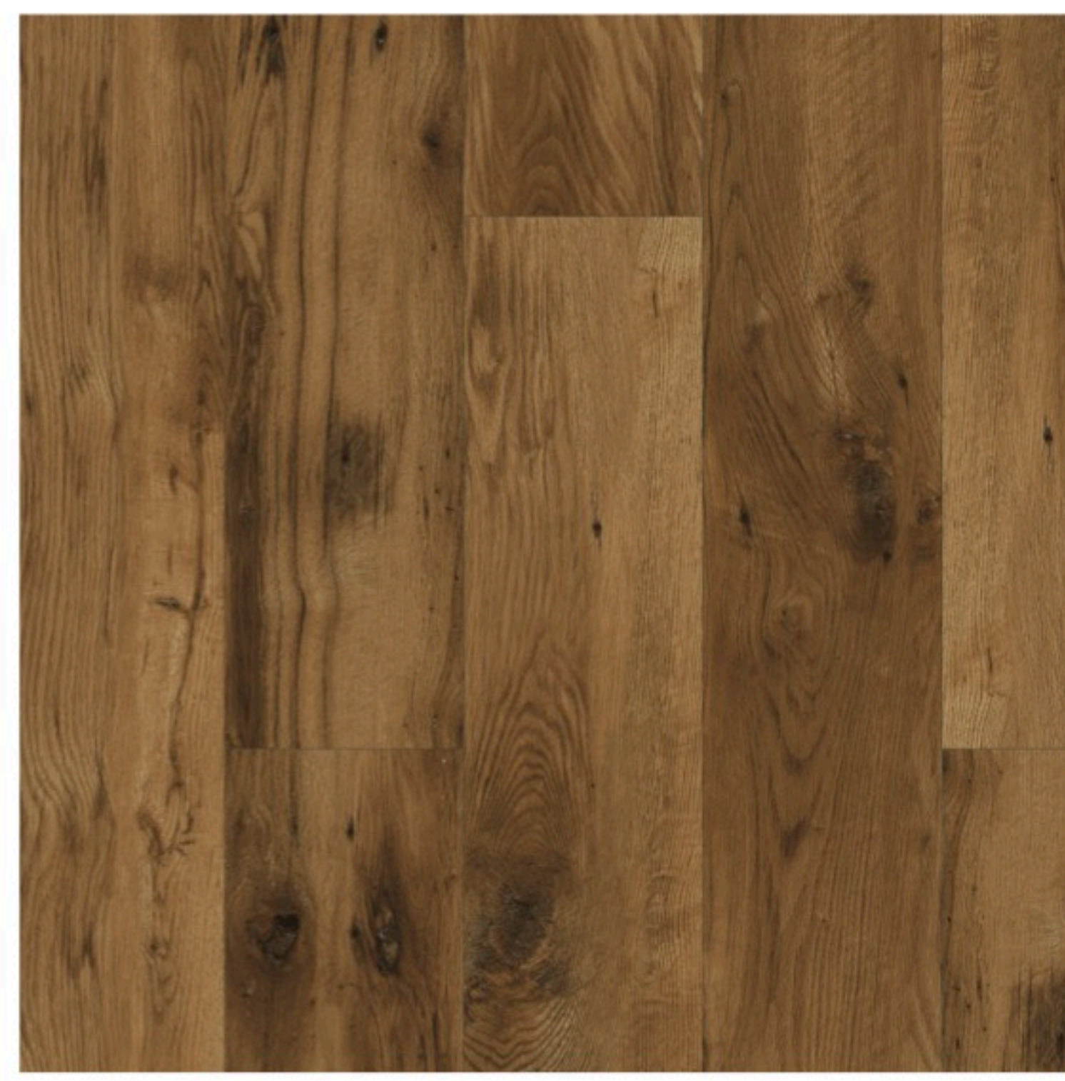
LOFT20 654 CINNABAR