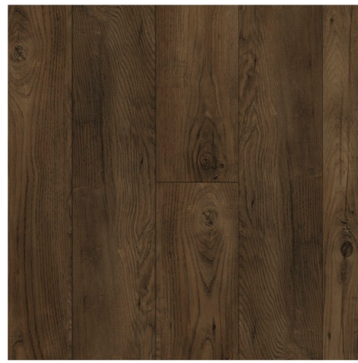
LOFT20 634 AUTUMN