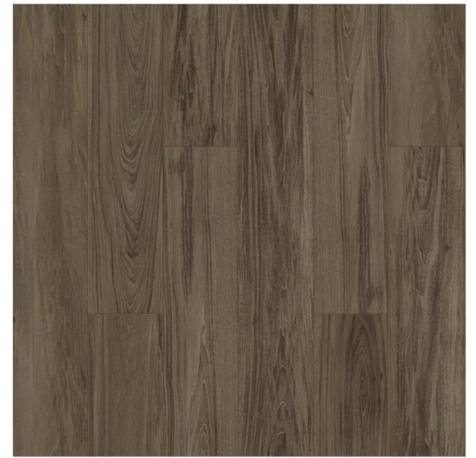
LOFT20 515 COCONUT GROVE