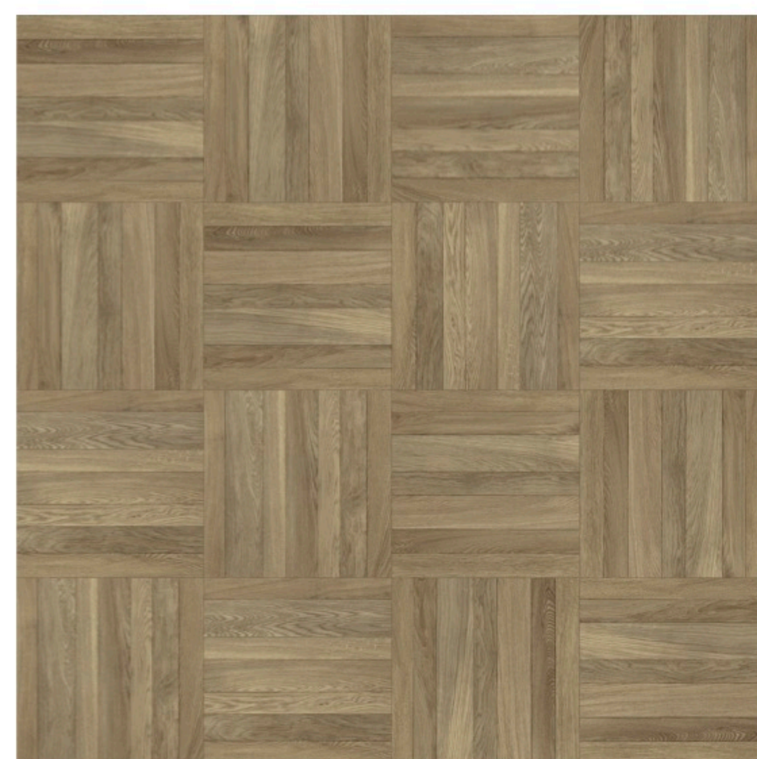
LOFT20 523 PARIS