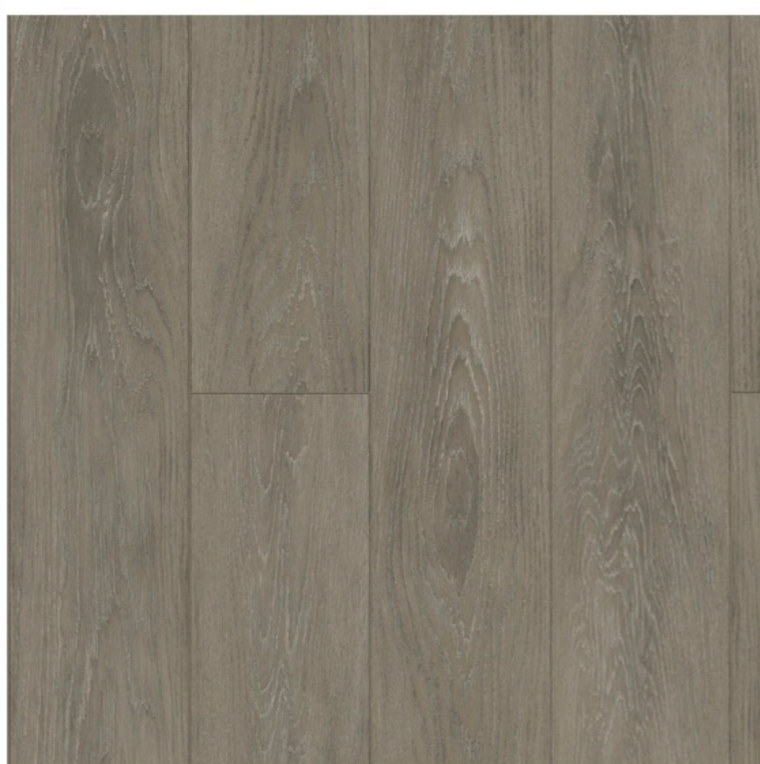
LOFT20 644 KEY WEST