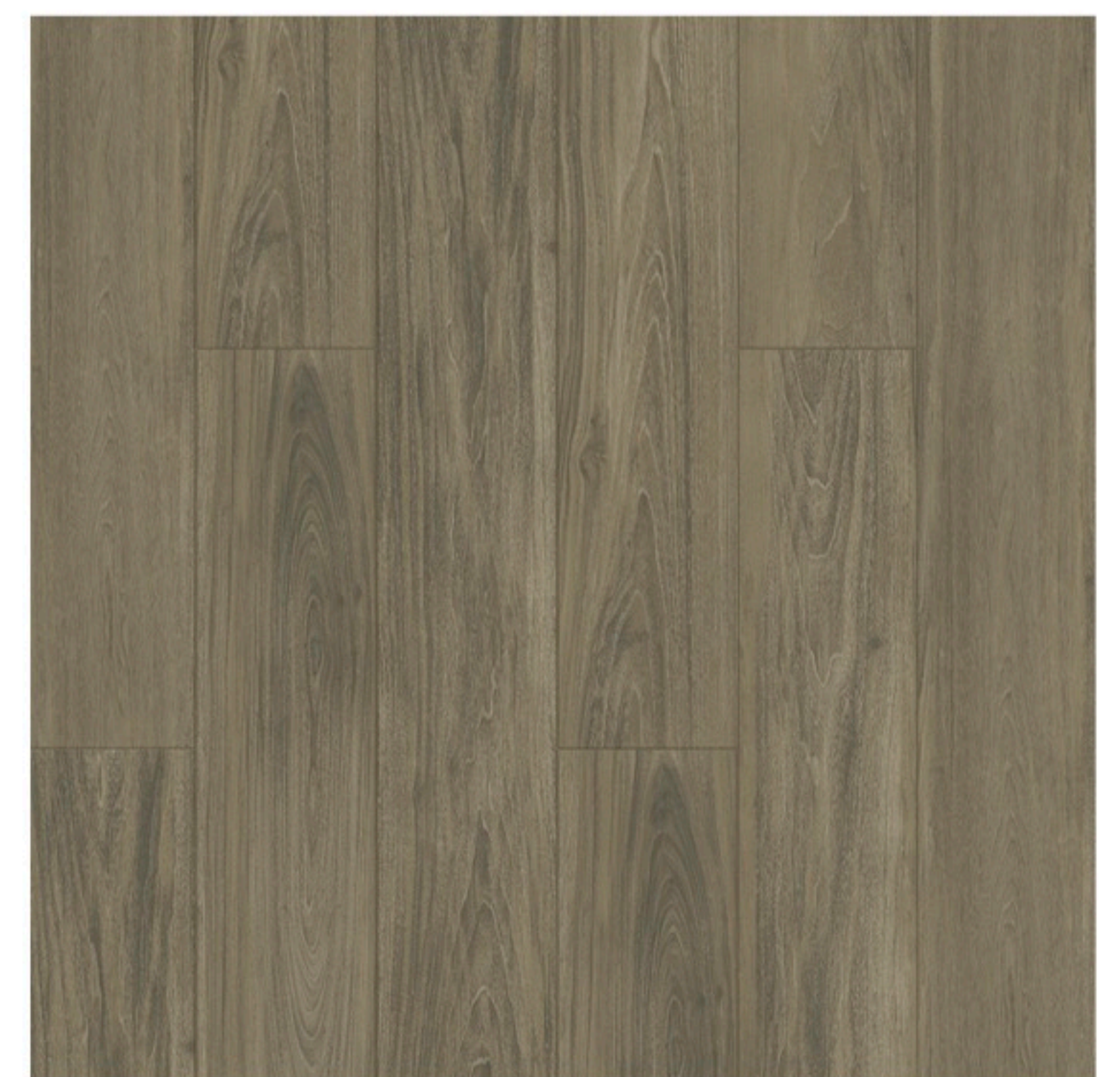
LOFT20 514 WYNWOOD