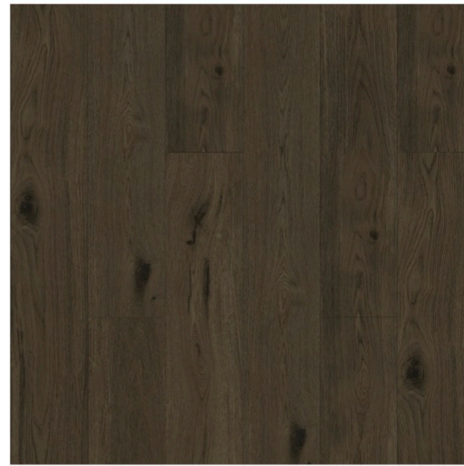
LOFT20 545 CAPRI