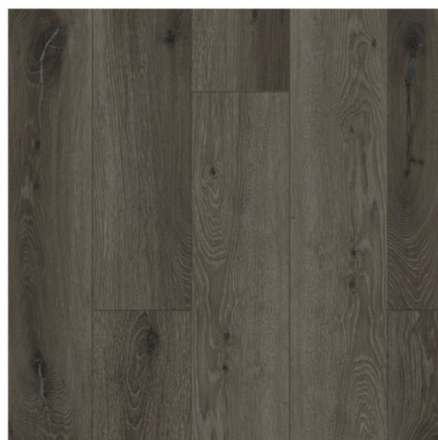
LOFT20 639 MONTAUK