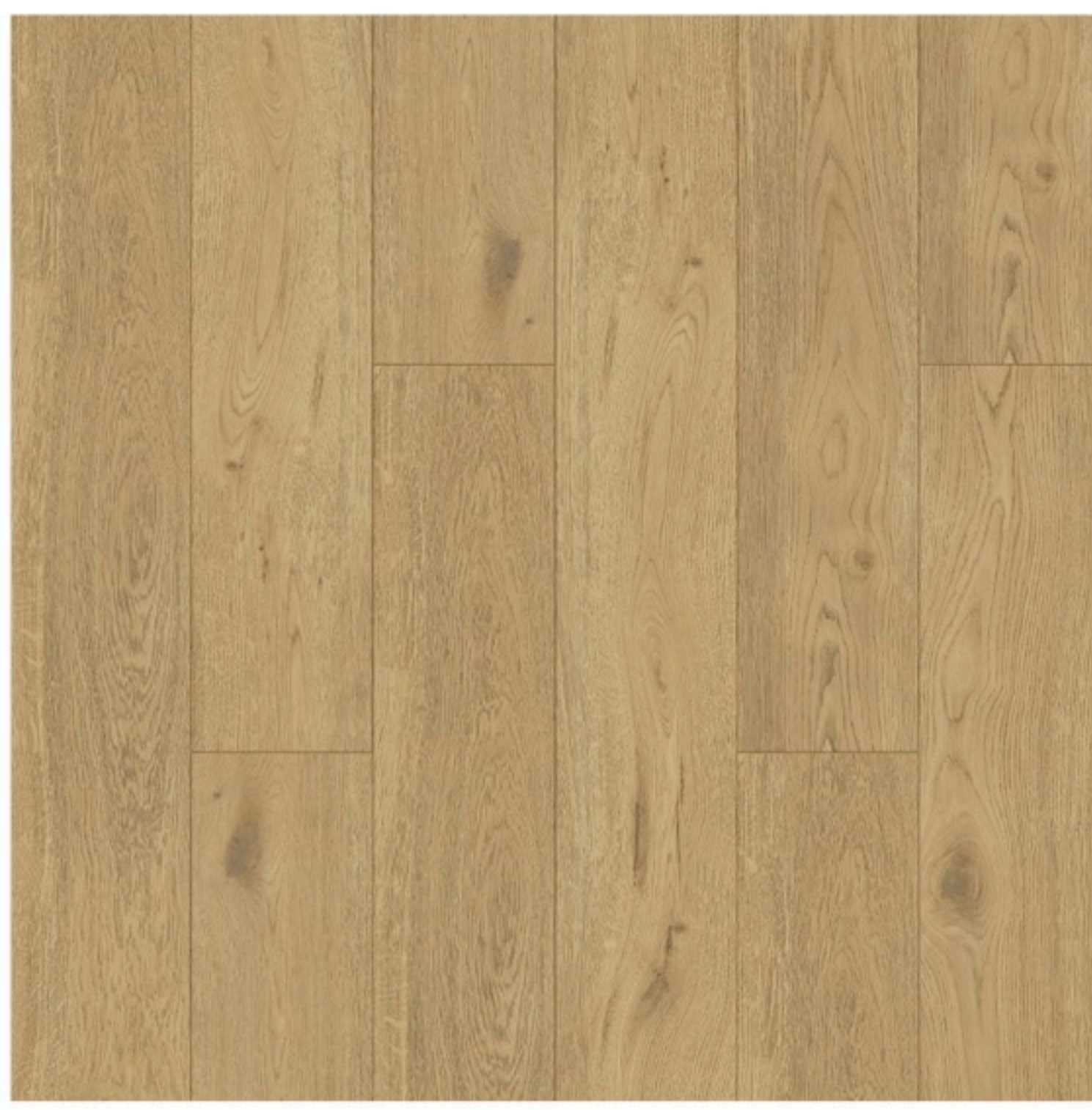
LOFT20 543 PORTOFINO