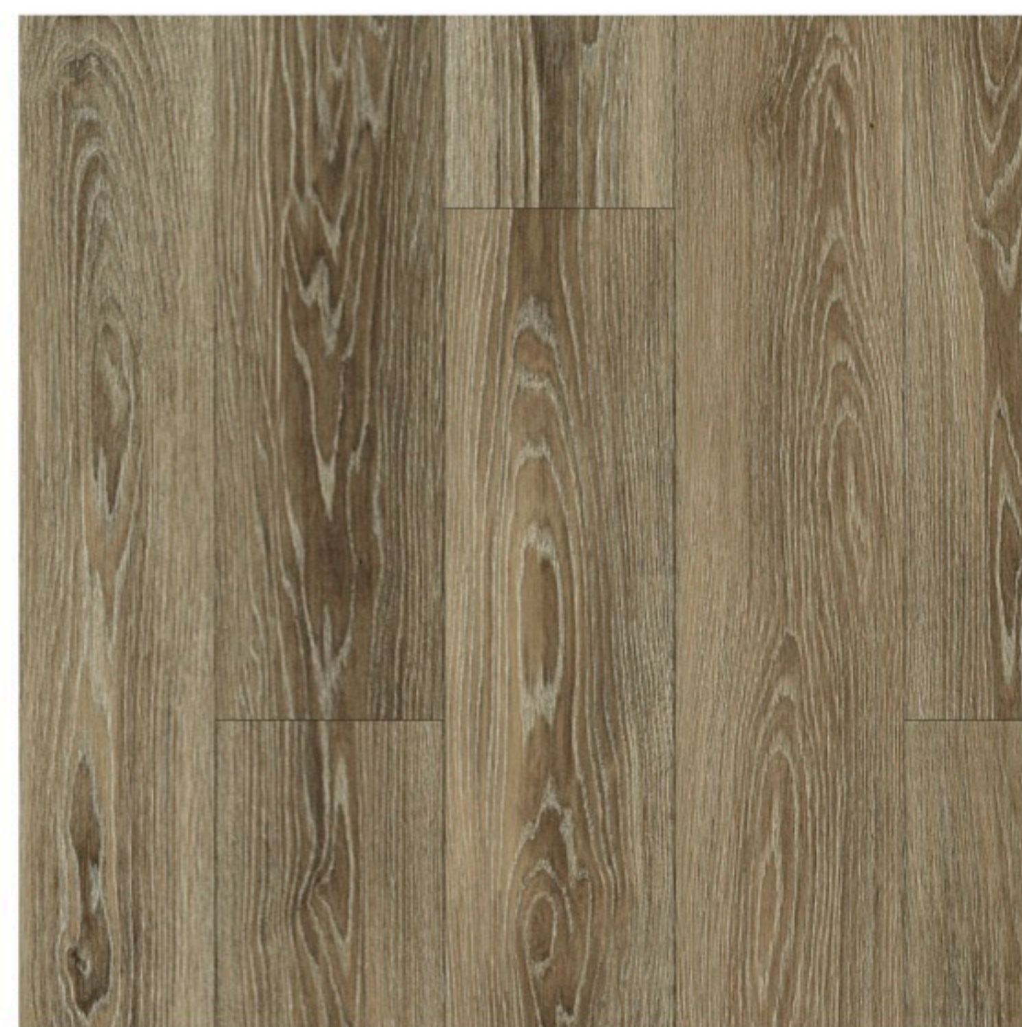
LOFT20 652 MALIBU