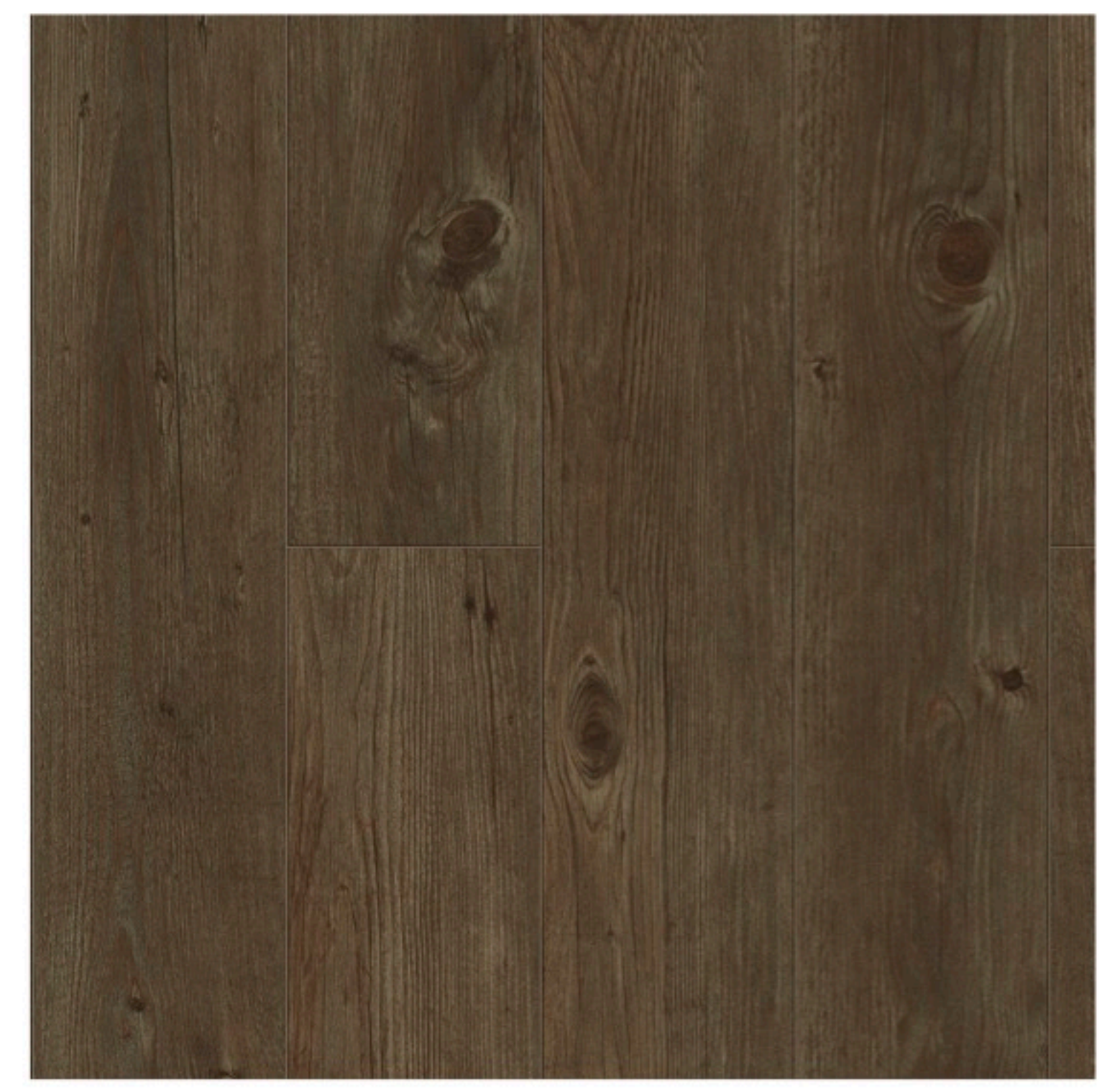
LOFT20 632 SENECA