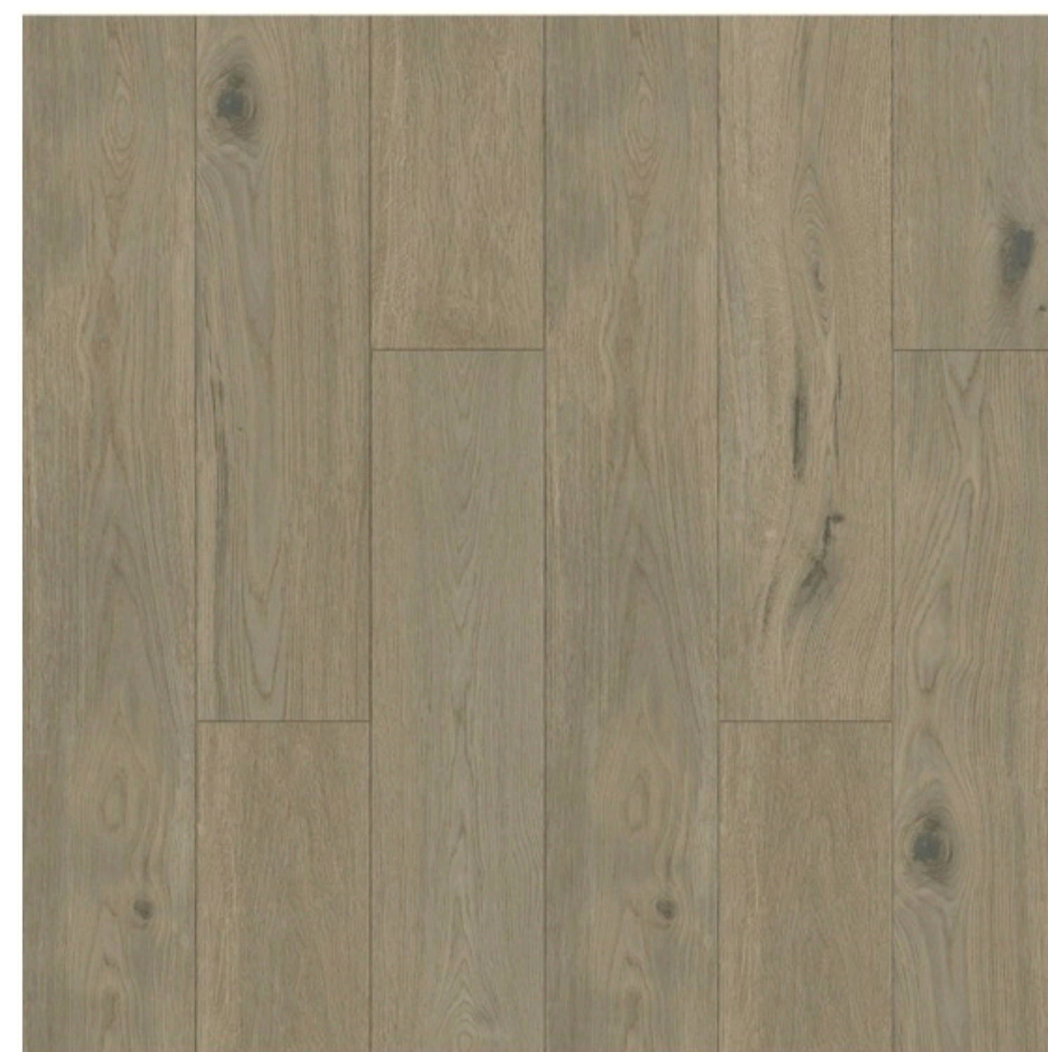
LOFT20 542 POSITANO