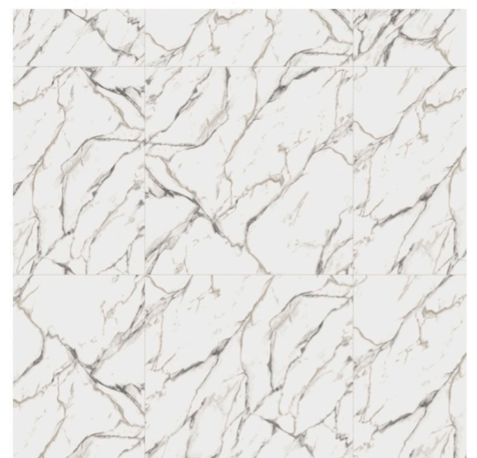
LOFT20 547 FLORENCE