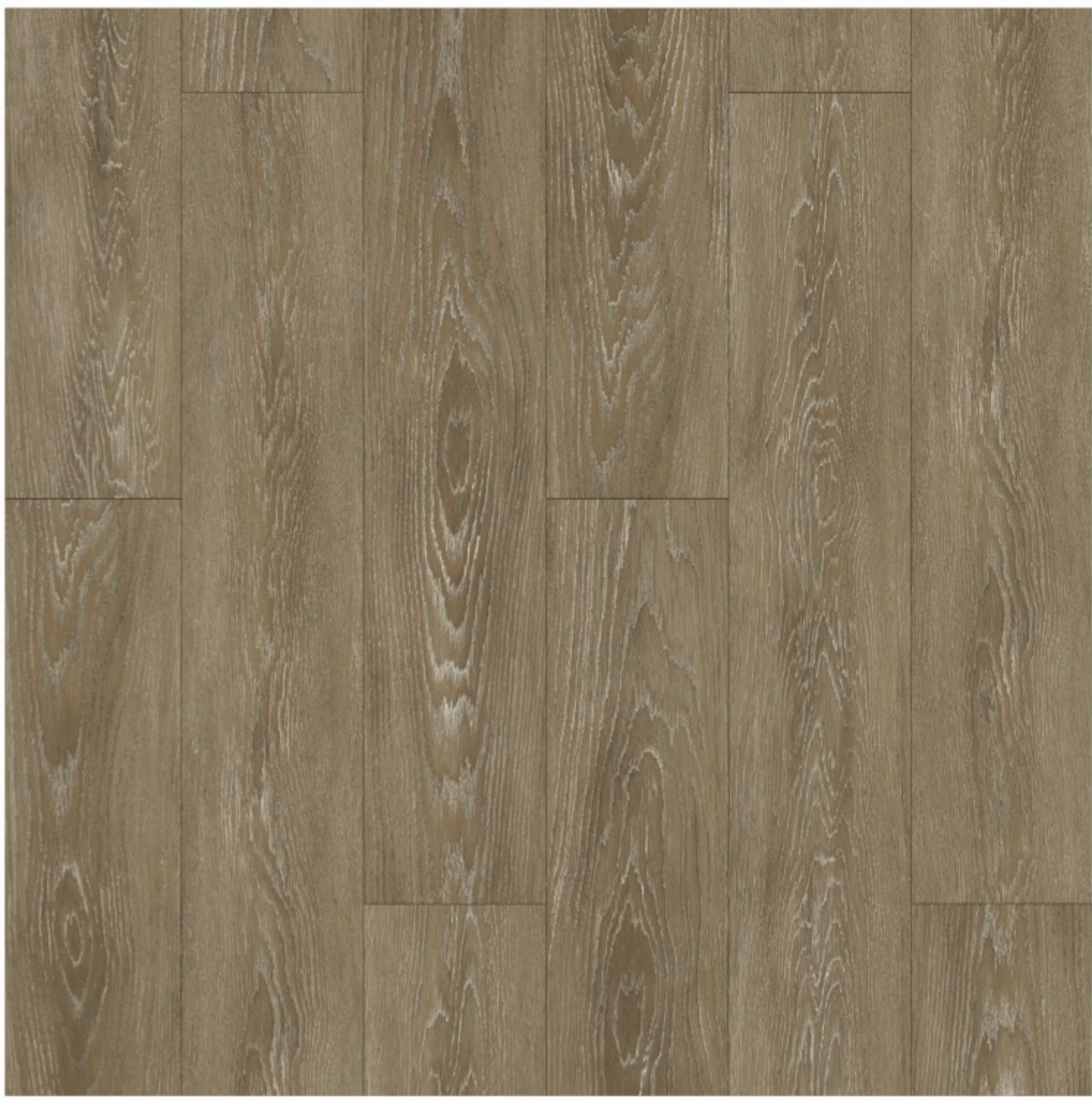
ELEV20 403 HAMPTON WHITE OAK