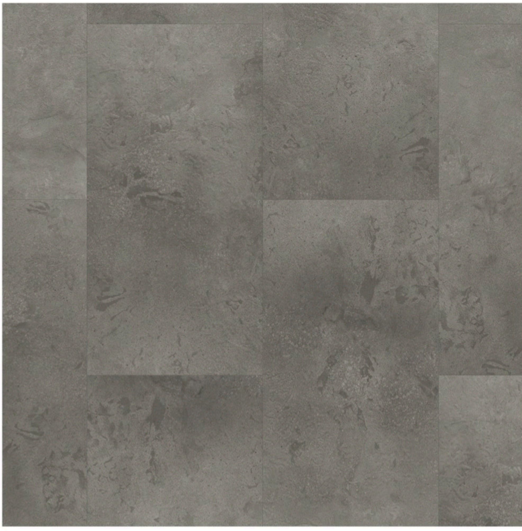
ELEV20 105 BOWERY