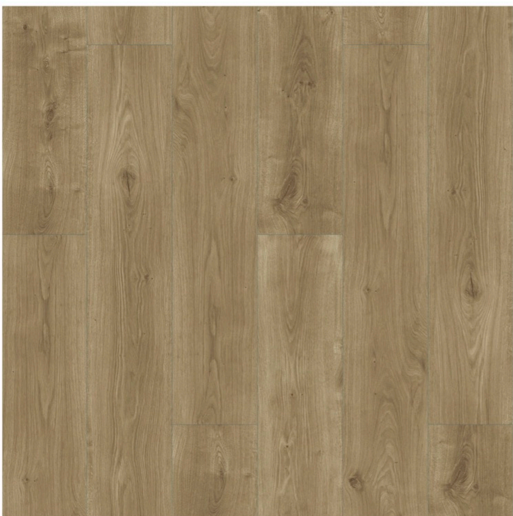
ELEV20 301 CHATEAU