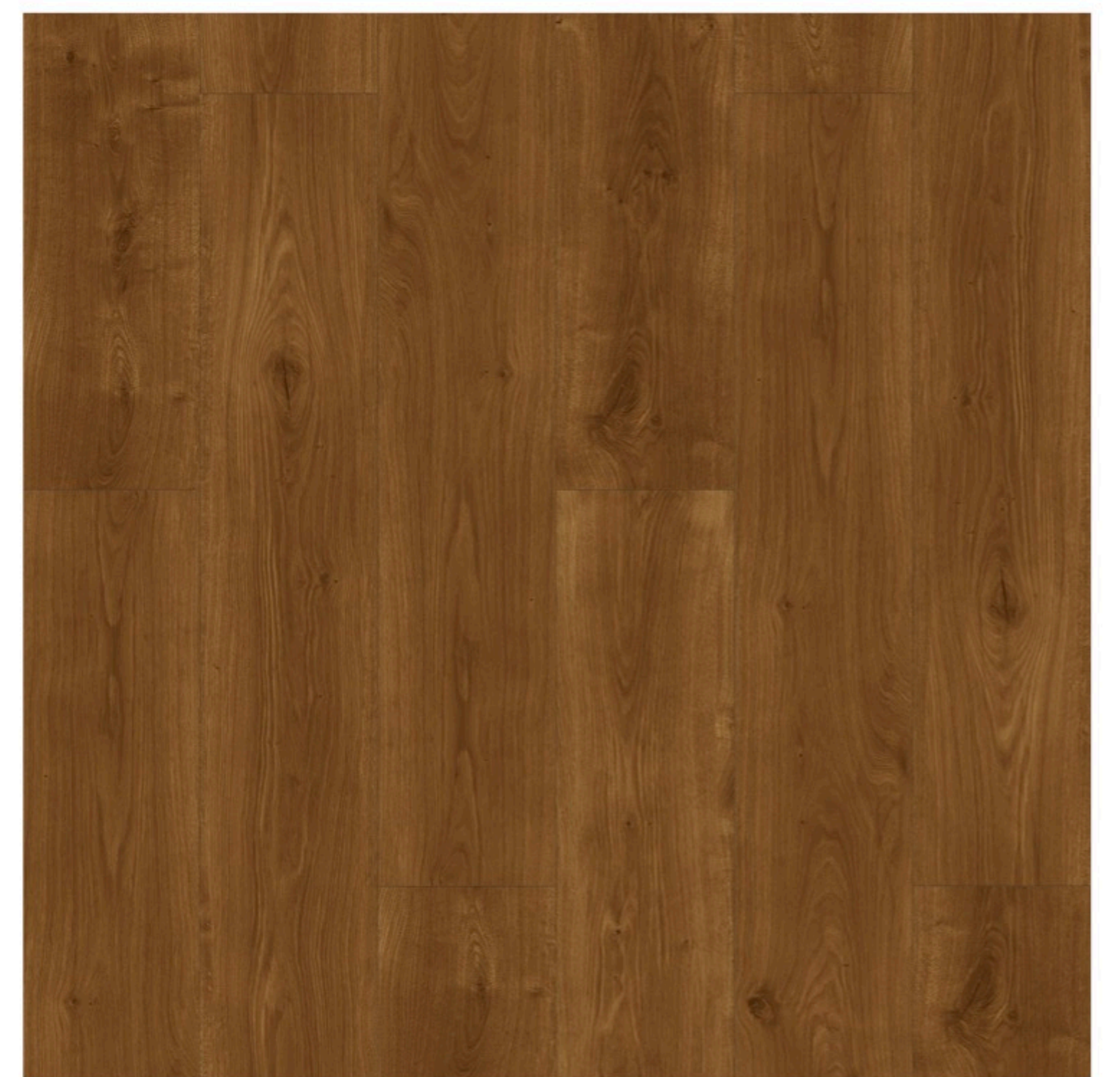
ELEV20 303 AVIGNON