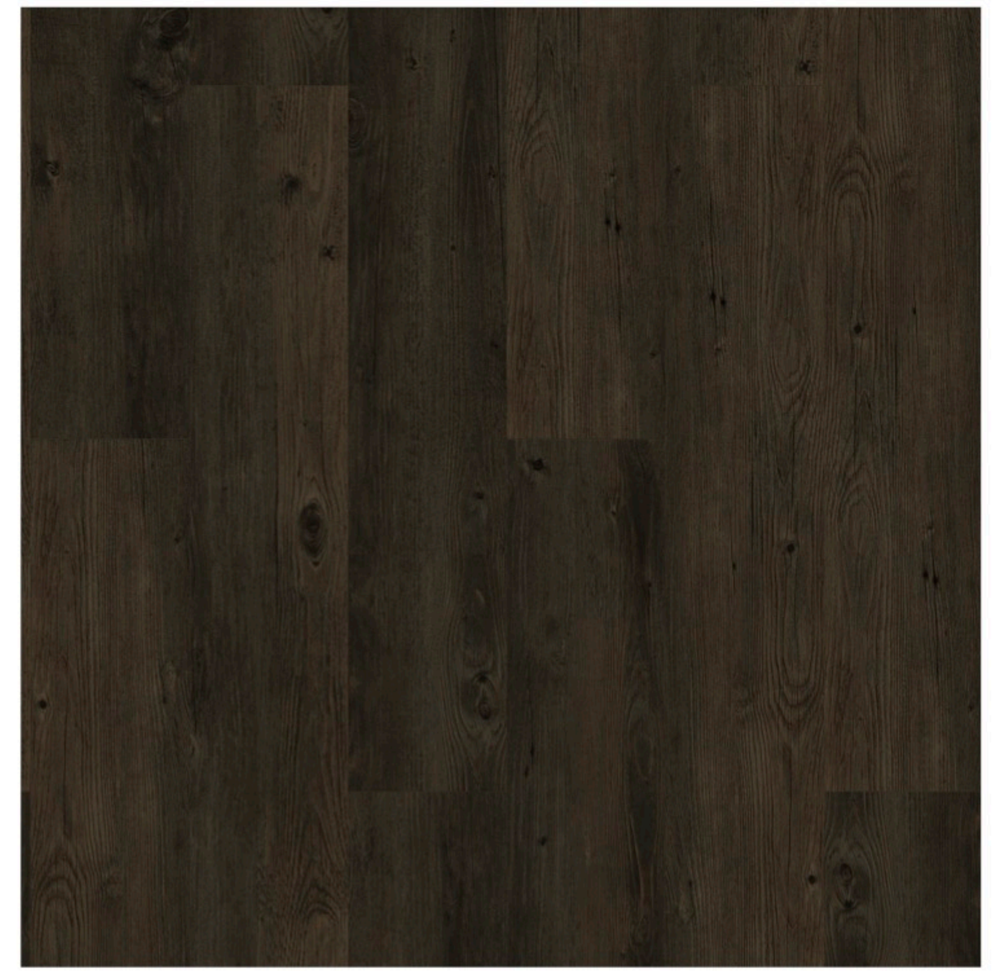
ELEV20 401 RECLAIMED WOOD