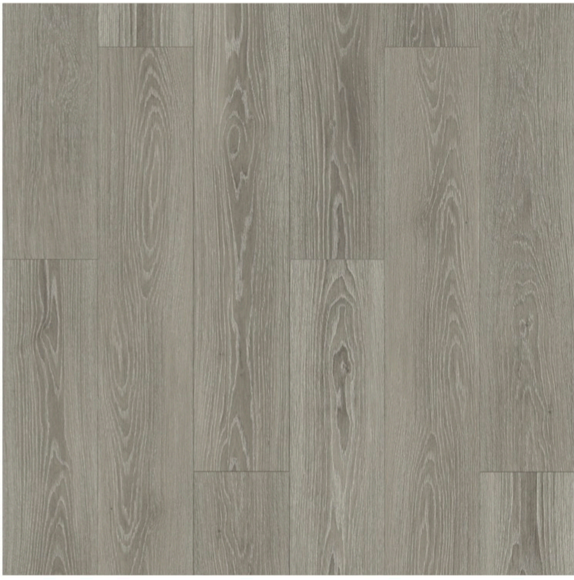
ELEV20 410 BIRCH