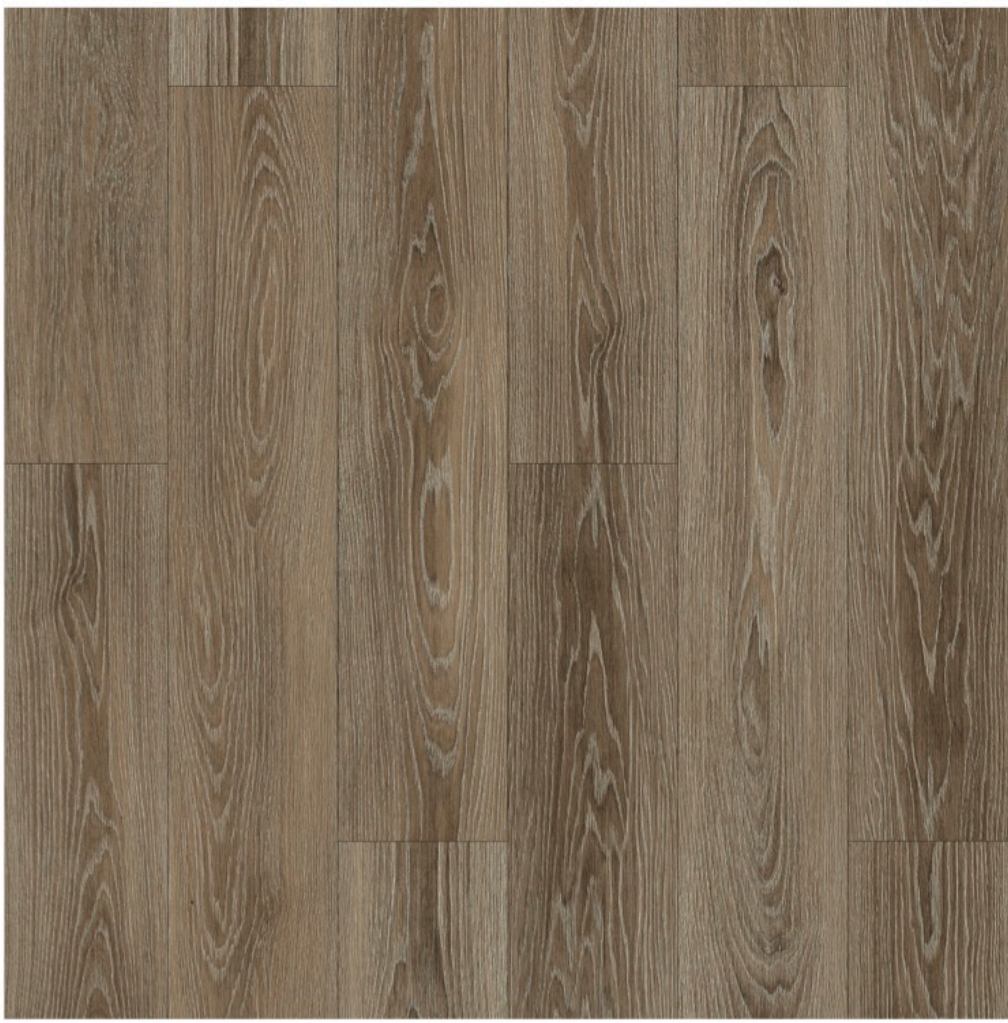
ELEV20 413 ROSEWOOD