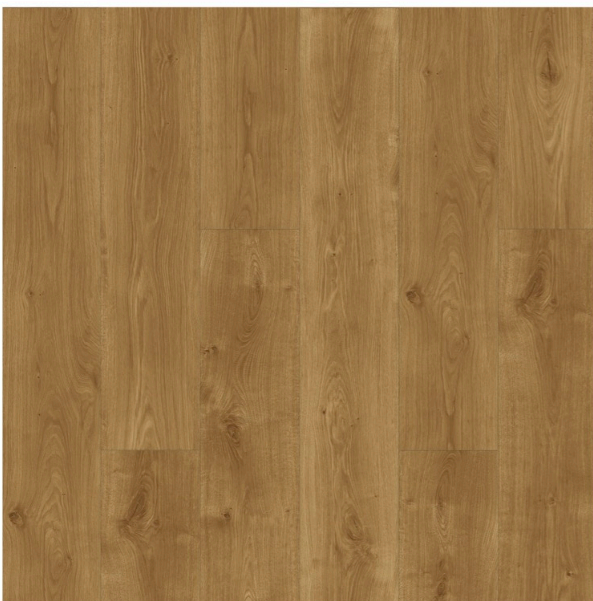
ELEV20 302 COUNTRY HOME