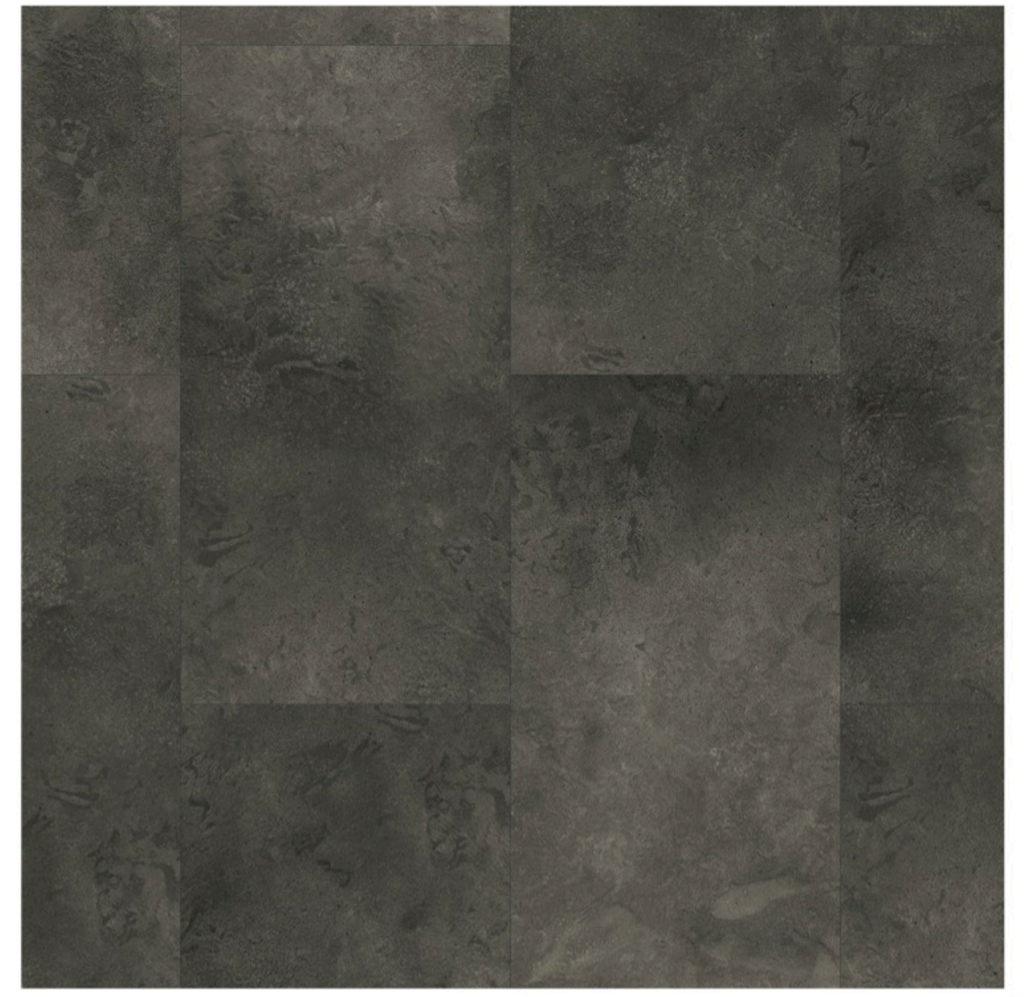
ELEV20 101 SOHO