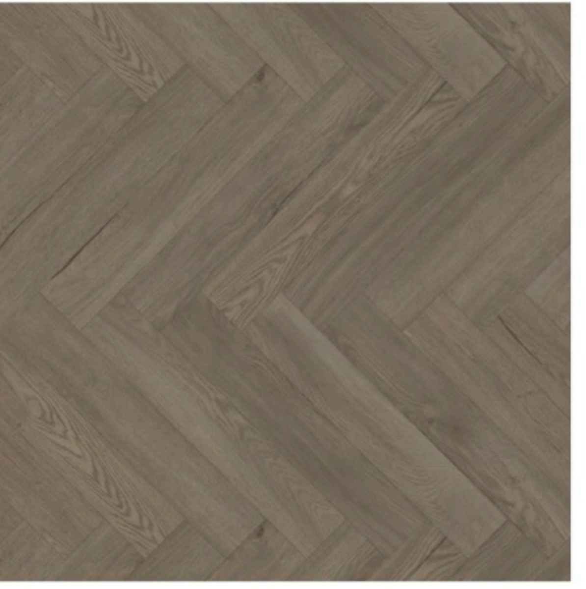
ACX 503 PARK SLOPE