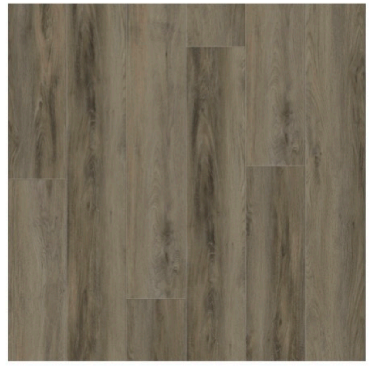
GEN 805 SALEM