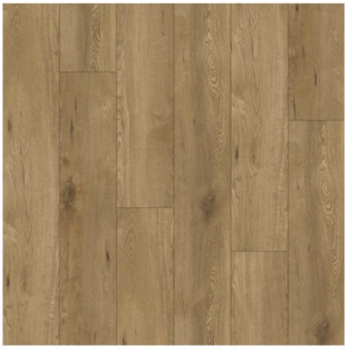
GEN 108 BEDFORD