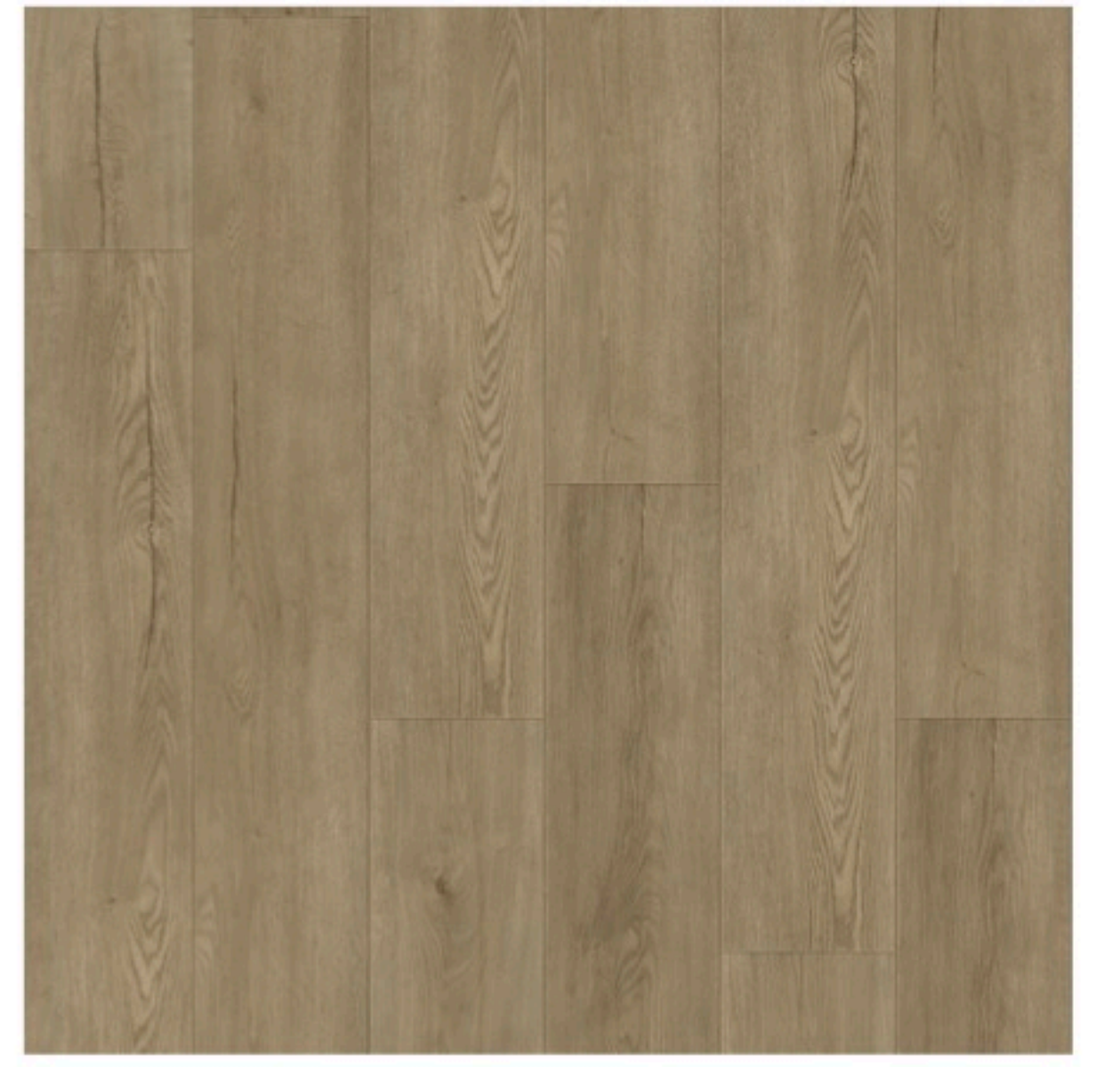
GEN 819 ST. JOHN