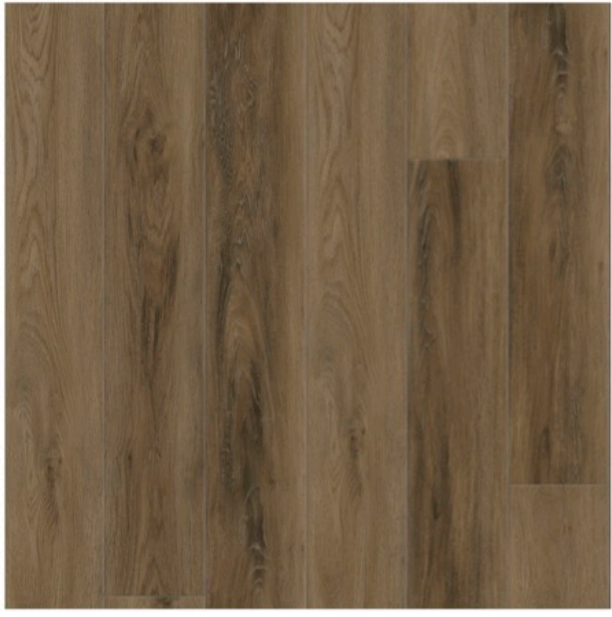
GEN 820 HAYWARD