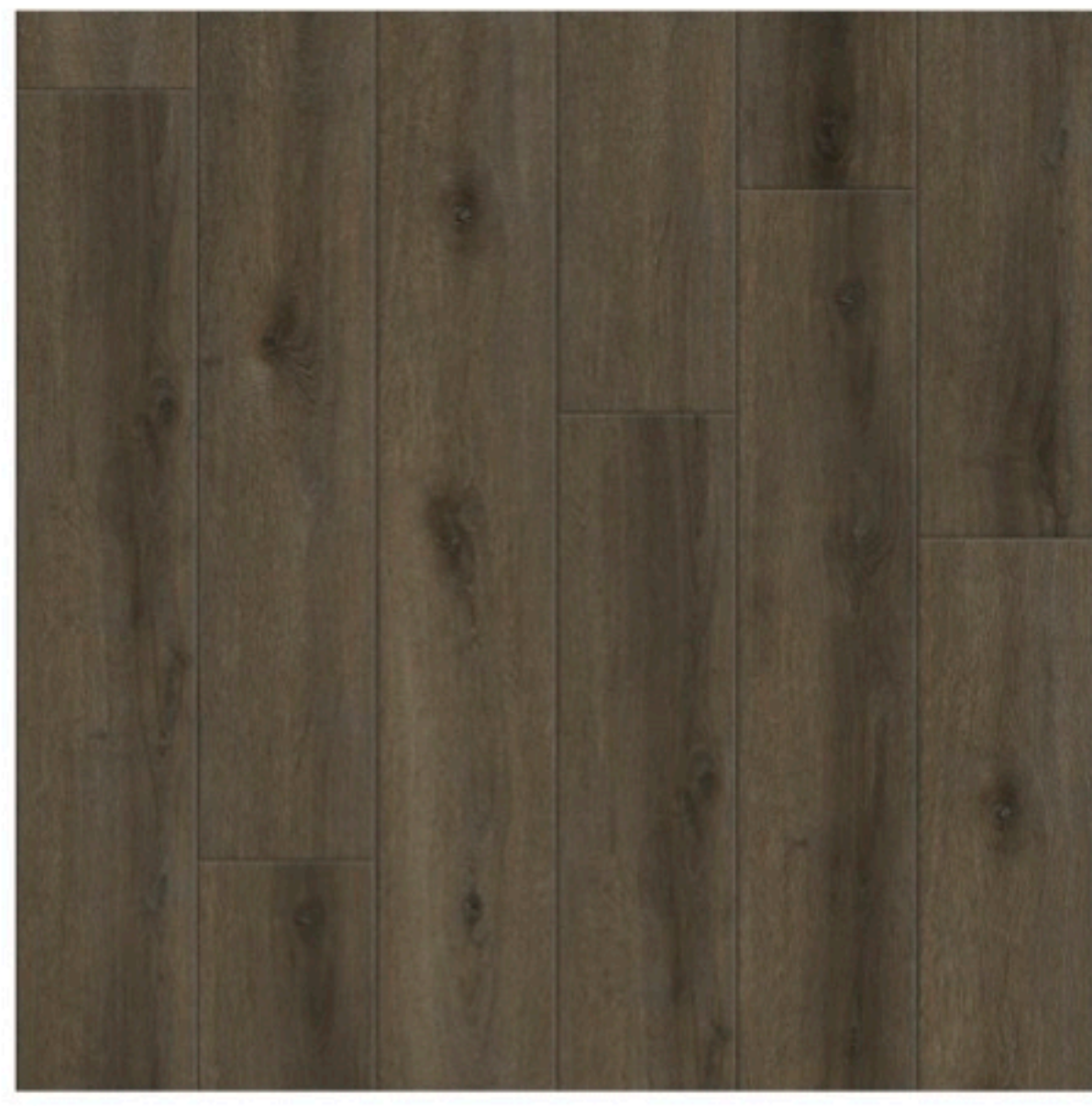
GEN 800 SPRINGFIELD