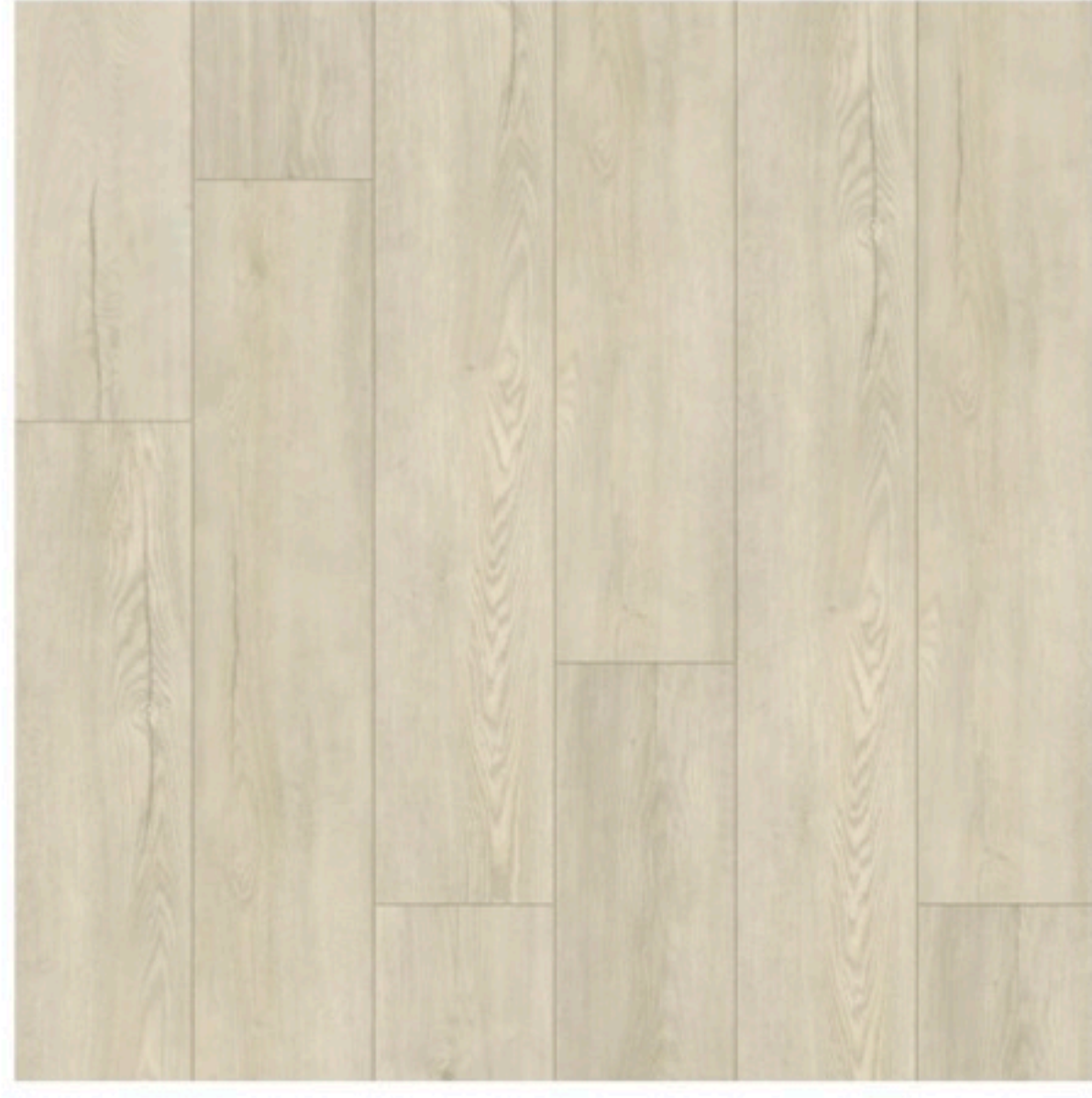
GEN 812 BRECKENRIDGE