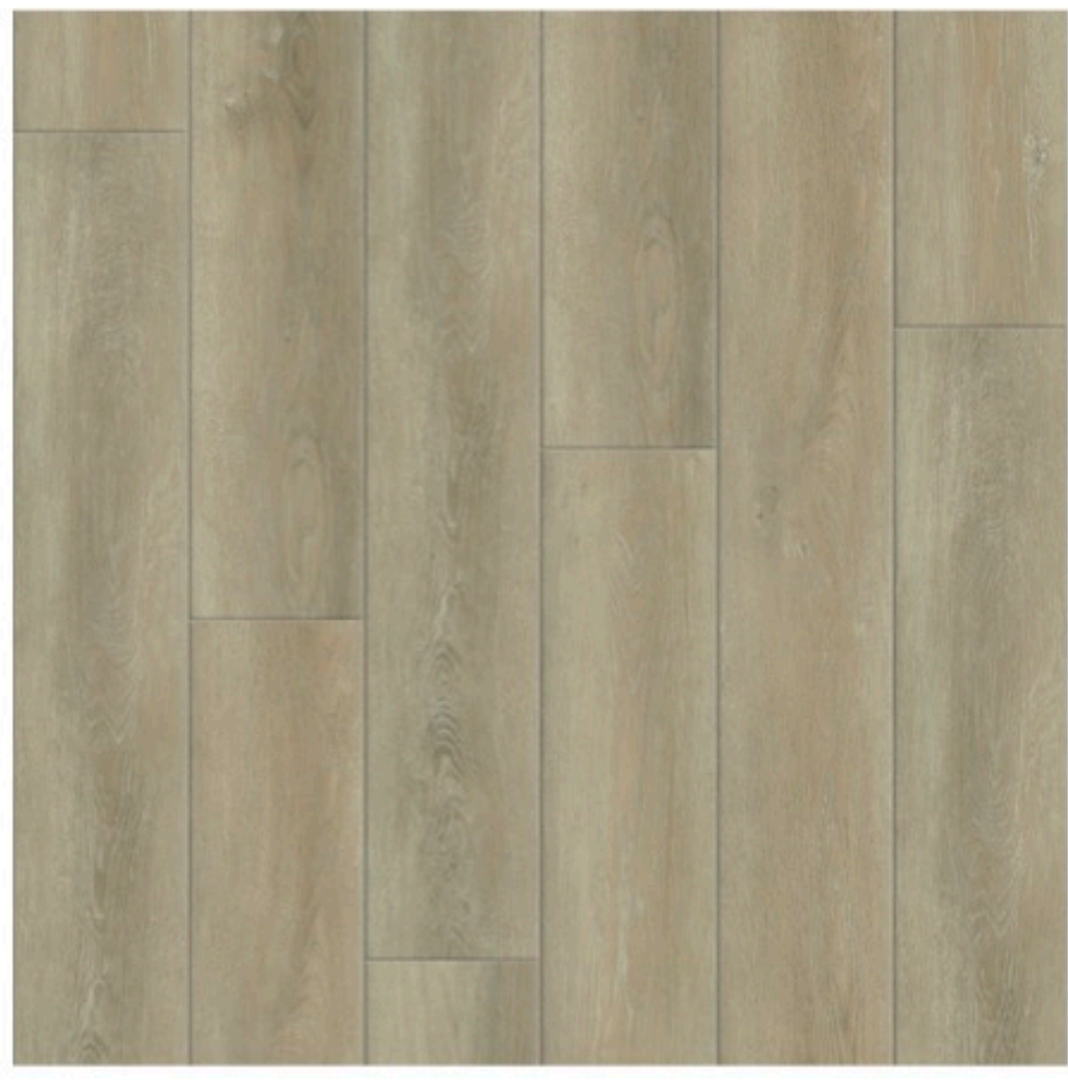
GEN 801 CLINTON