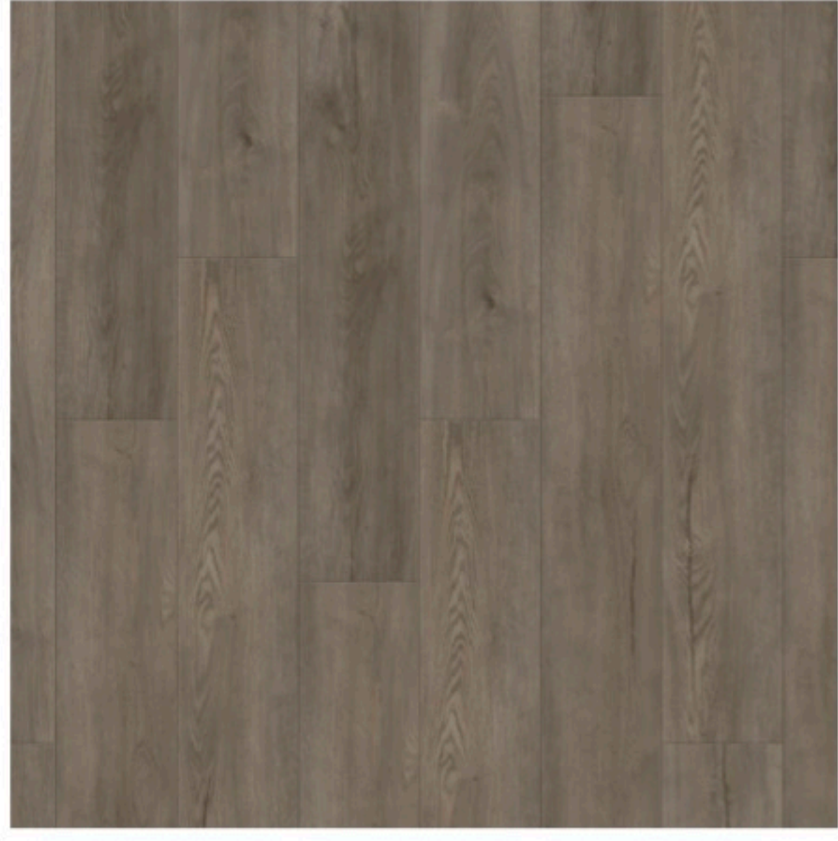
GEN 808 ROCKY