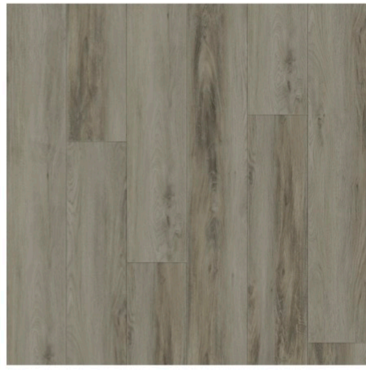
GEN 804 FAIRVIEW