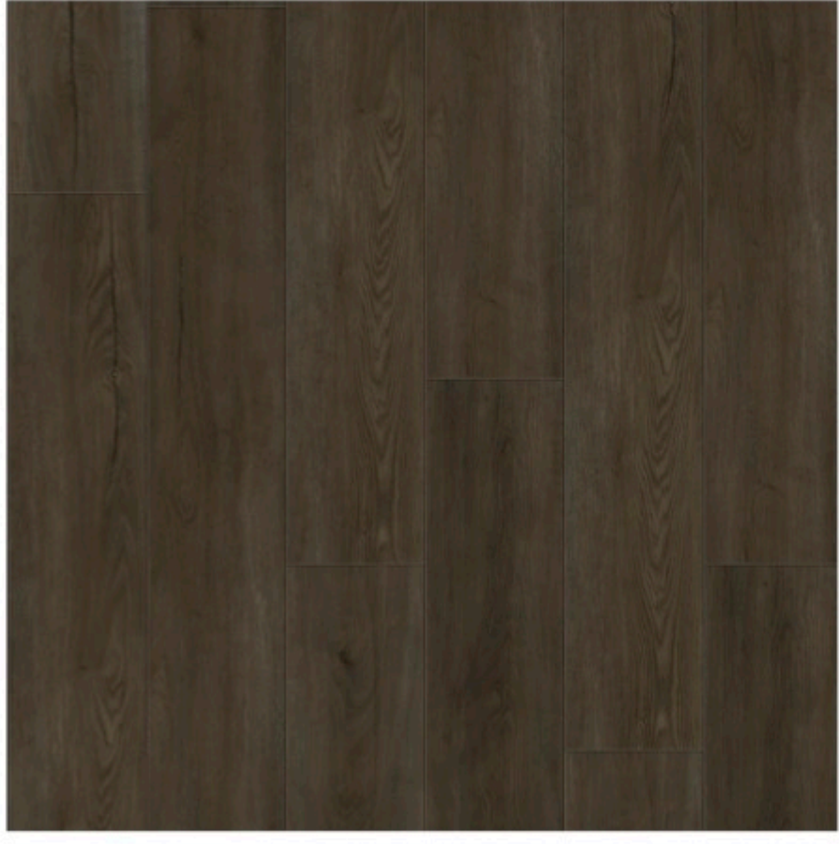
GEN 811 ROAN