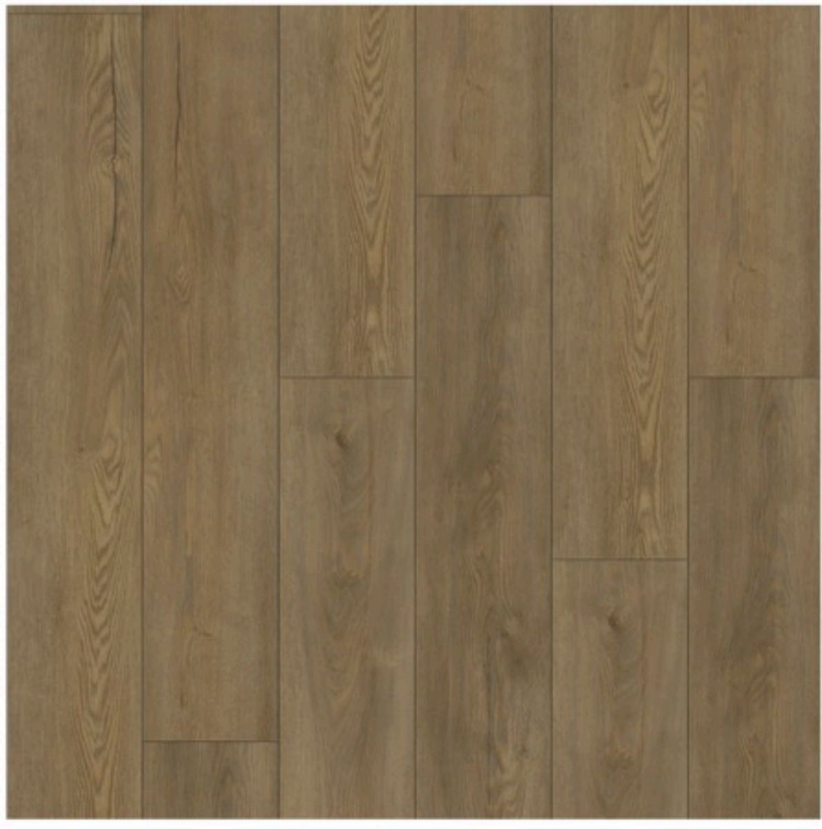
GEN 813 VAIL