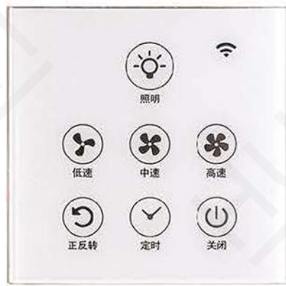
DC motor wall control