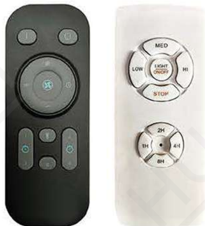
AC motor remote control