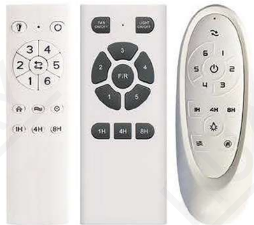
DC motor remote control