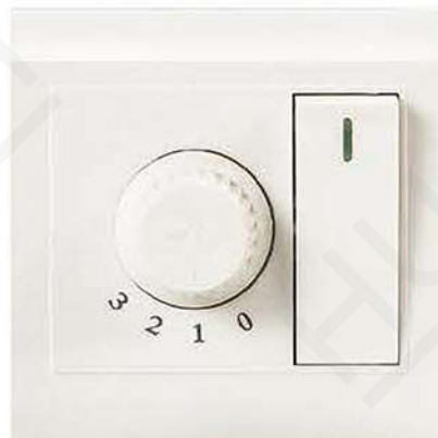
AC motor wall control