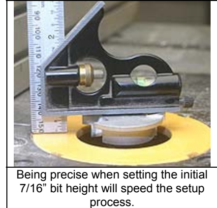
Being precise when setting the initial 7/16" bit height will speed the setup process.

For more on using the Drawer Lock Joint Bit see the "Instructions" section of www.infinitytools.com .