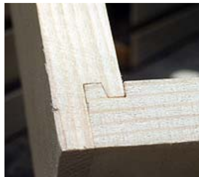
The Infinity Drawer Lock Joint Bit makes very strong joints that can be used in many applications besides making drawers.

Install the bit and set it to a height of \frac{7}{16} " above the table surface. Once the bit height is confirmed by test cuts, it remains constant when cutting the fronts and sides.