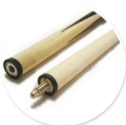
Two cue sticks