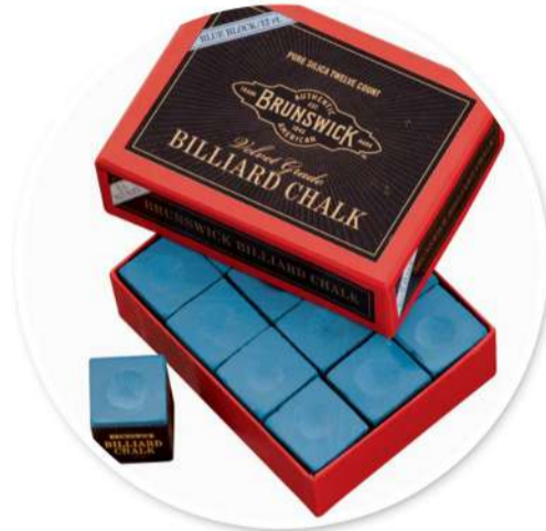
Chalk / Pool chalk