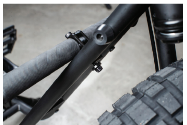
(Fig.7) Washer and M6 Nut.