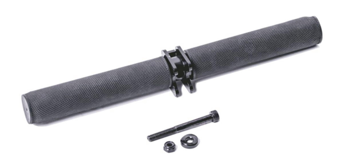
(Fig. 1) Kids Foot Rest and the appropriate hardware.

Kids Foot Rest- 1 pcM6 x 60mm Allen Head Bolt- 1 pcM6 Saddle Washer- 1 pcM6 Nylon-insert Lock Nut- 1 pc