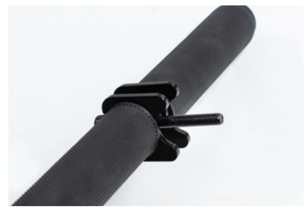
(Fig. 3) Orientation of the bolt through the foot rest.