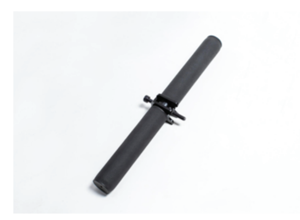
(Fig.2) Orientation of the bolt through the foot rest.

Insert the bolt through the mounting hole in the tube. (Fig. 5)