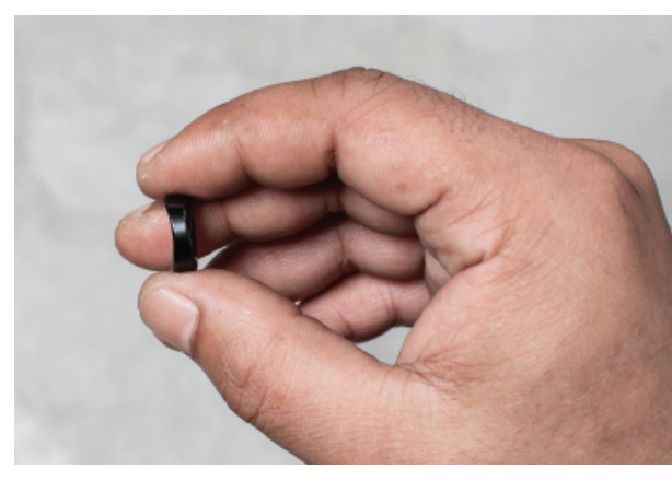
(Fig. 6) Note the orientation of the saddle washer.

Use a 5mm Hex wrench to prevent the bolt from turning. Tighten the M6 nut to 6 Nm . (Fig. 8)