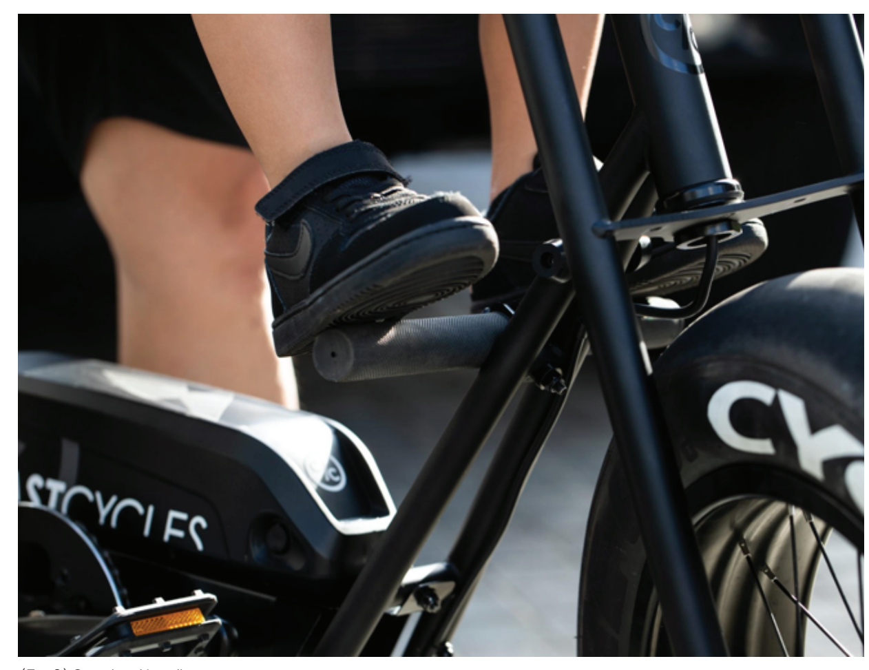
(Fig. 9) Completed Installation.