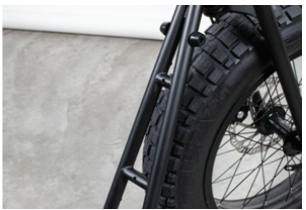
(Fig. 4) The mounting point will be the topmost bar on the down (Fig. 5) Insert the foot rest and bolt as shown. tube.