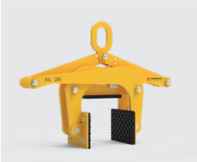
Product Code: ASL200