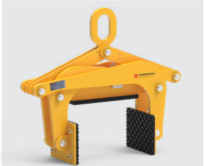
Product Code: ASL300