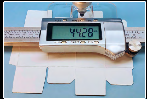
FOLDING CARTON MEASUREMENTS