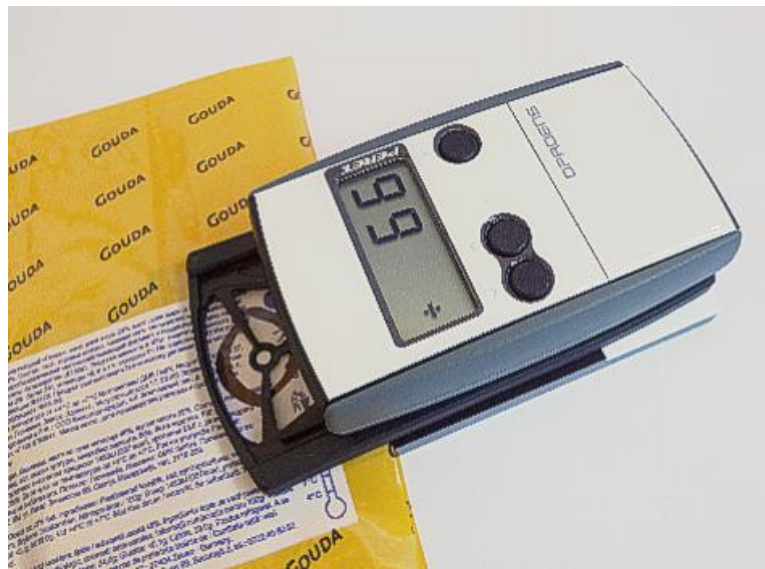
Fig.1 : Beta OPADENS

The OPADENS measures the opacity in relation to a white reference (100% opacity) and a black reference (100% transparent equal to 0% opacity)