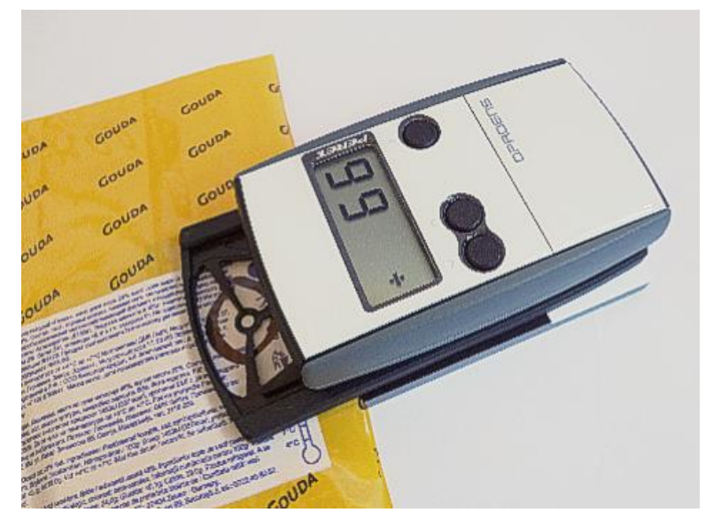
Fig.1 : Beta OPADENS

The OPADENS measures the opacity in relation to a white reference (100% opacity) and a black reference (100% transparent equal to 0% opacity)