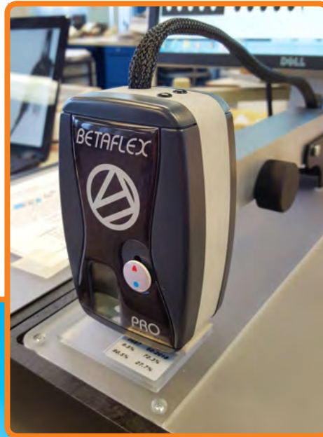
BetaFlex Pro Measuring Head & Calibration Plaque