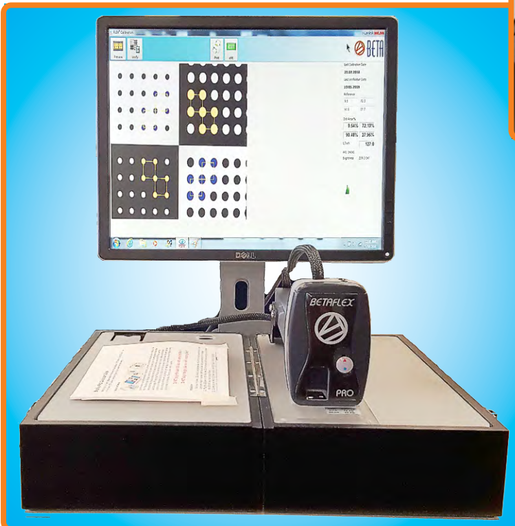
BetaFlex Pro Calibration Plaque, Targets Measured: 9.5%, 27.7%, 72.3%, 90.5%