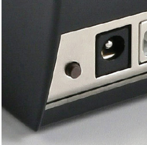
Innovative "C" button makes label Calibration simple and fast