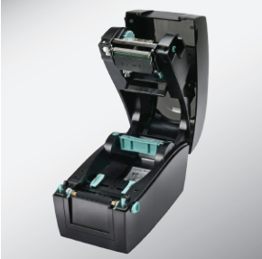
Modern clam-shell design makes it simple to load labels