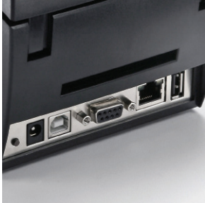
Ethernet, USB 2.0, Serial and USB host are standard features adding flexibility and power