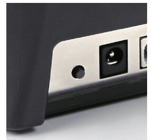
Innovative "C" button makes label Calibration simple and fast