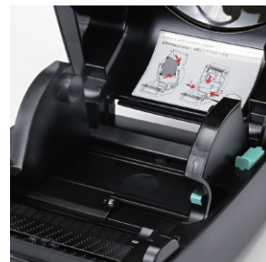
Rod-less label roll holder for easy loading and smooth feeding