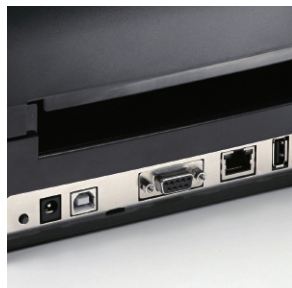
Ethernet, USB 2.0, Serial and USB host are standard features adding flexibility and power