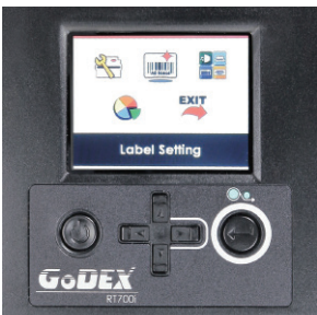
Color TFT LCD and operation panel for easy and intuitive operation

Full functions, powerful features, user friendly interface and high extensibility make the RT700i perfect for retail and industrial applications