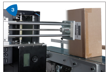
3 Versatile, applying labels from the top, bottom or sides in any rotation.