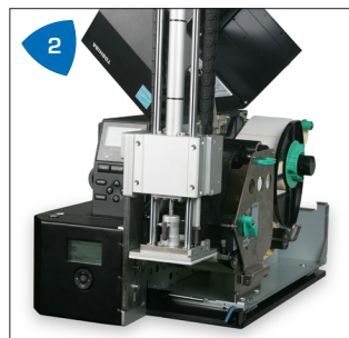
2 Compact, secure and easy to access for the operator.