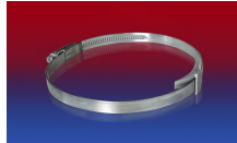
CLAMP 210 BRIDGE CLAMP