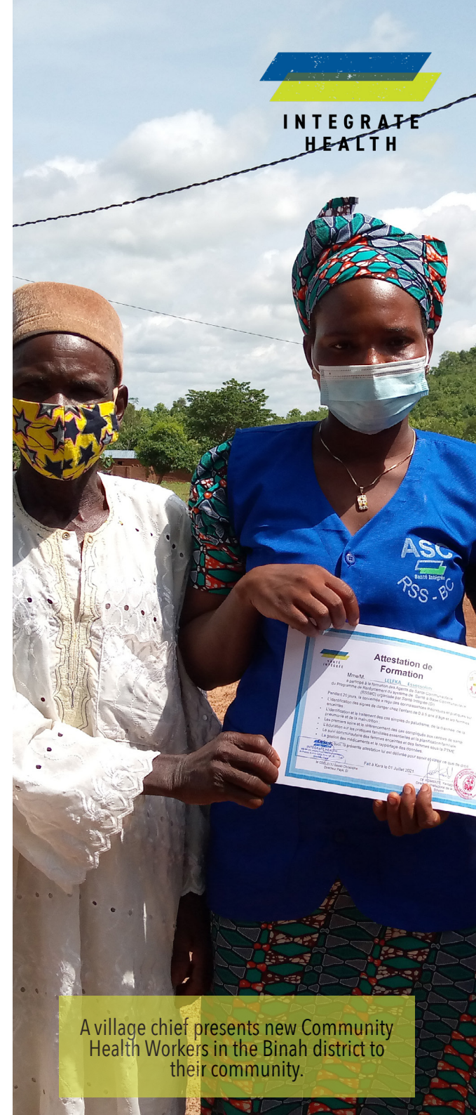
A village chief presents new Community Health Workers in the Binah district to their community.