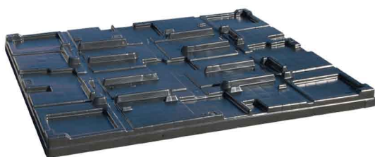
Bulk Pak Lid: APHD Lid