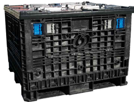
APHD BULK PAK & APHD LID

Manufactured and designed to withstand high impact resistance guarding against forklift or truck damage. Specially located areas on all four sides provide the ability to place card holders, ID plates, place cards or moulded logos.