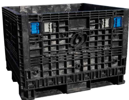
Bulk Pak : APHD