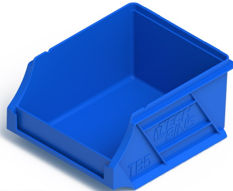
Tech Bin: APTB5 Technical Specifications

Dividers are also available with our Tech Bins to further maximise the efficiency in storing of items in the workplace, further enhancing accessibility and control.