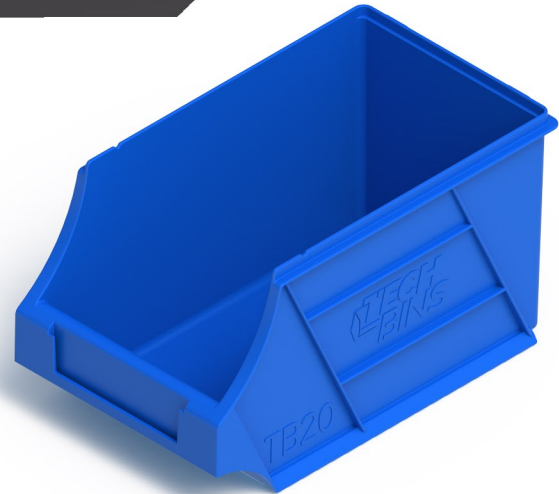
Tech Bin: APTB20 Technical Specifications

Dividers are also available with our Tech Bins to further maximise the efficiency in storing of items in the workplace, further enhancing accessibility and control.