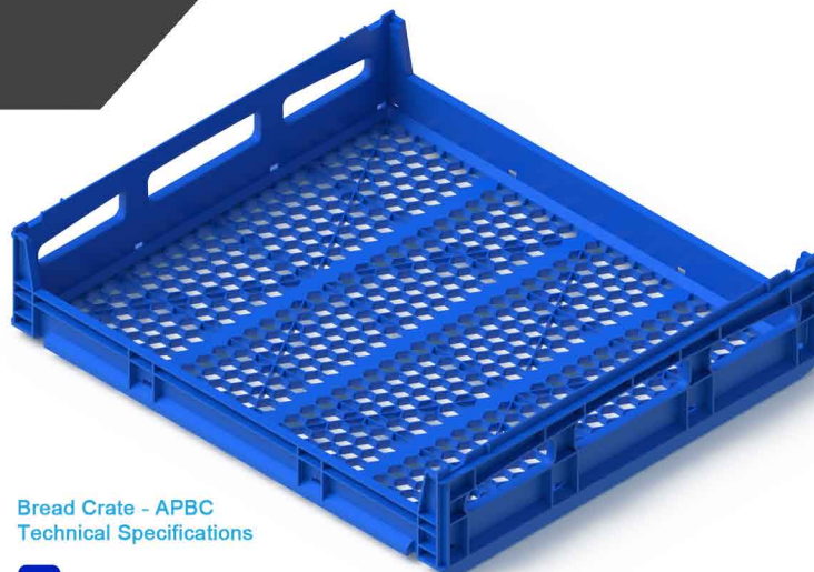
Bread Crate - APBC Technical Specifications