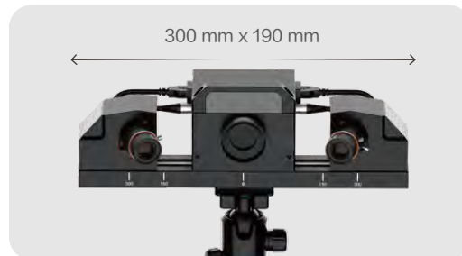
Outer Larger Field of View for scanning medium large objects