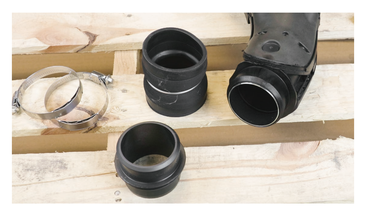
STEP 10 - Take the bushings and sleeves you removed in steps 6-7 and install them onto both ends of your GrimmSpeed intercooler. Ensure that the flat sides of the sleeves are facing the front (the side of the intercooler with the GrimmSpeed text).