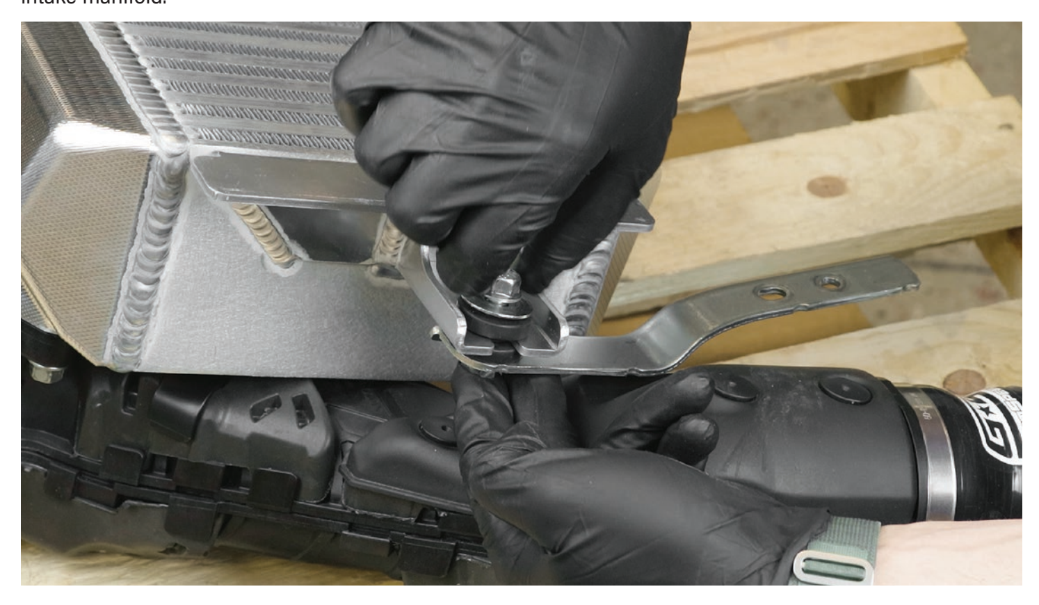
STEP 16 - Back under the hood, place the intercooler roughly in place on top of the engine. Ensure that the passenger side support bracket is roughly in place above the intake manifold.