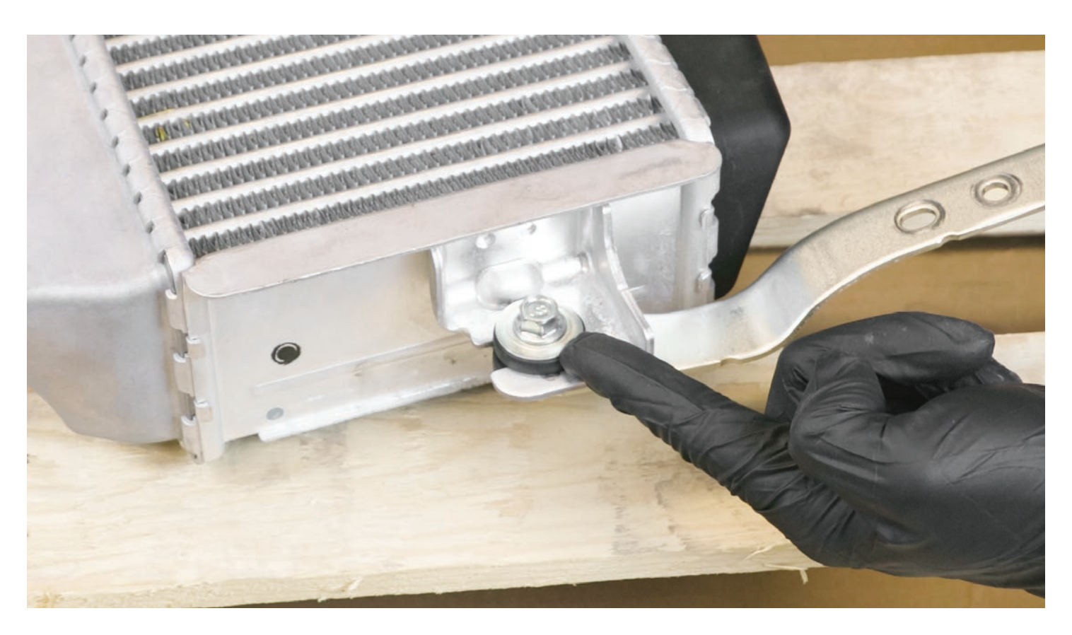
STEP 6 - Use a flat head screwdriver to gently pry the metal sleeve out of the intercooler support bushing.