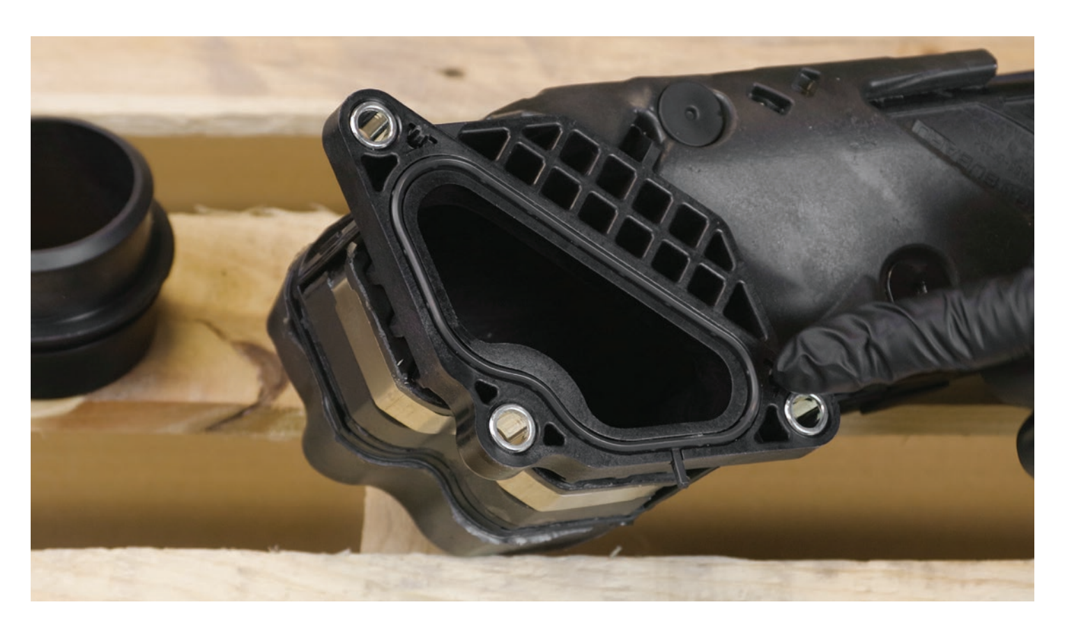
STEP 12 - Using 3 of the 12mm bolts you removed eariler, bolt the chargepipe onto the GrimmSpeed Intercooler, ensureing that the two dowel posts on the chargepipe are aligned with the pockets on the intercooler. Torque these bolts to 11.8 ft/lbs (16 Nm).