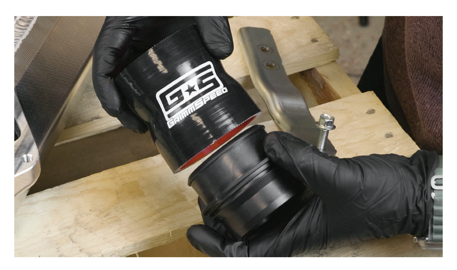
STEP 14 - Pop the other side of the coupler onto the top side of the charge pipe with the GrimmSpeed logo facing up. Slide the included clamps over the coupler, but don't tighten them quite yet in case you need to re-orient the coupler once the intercooler is on the car.