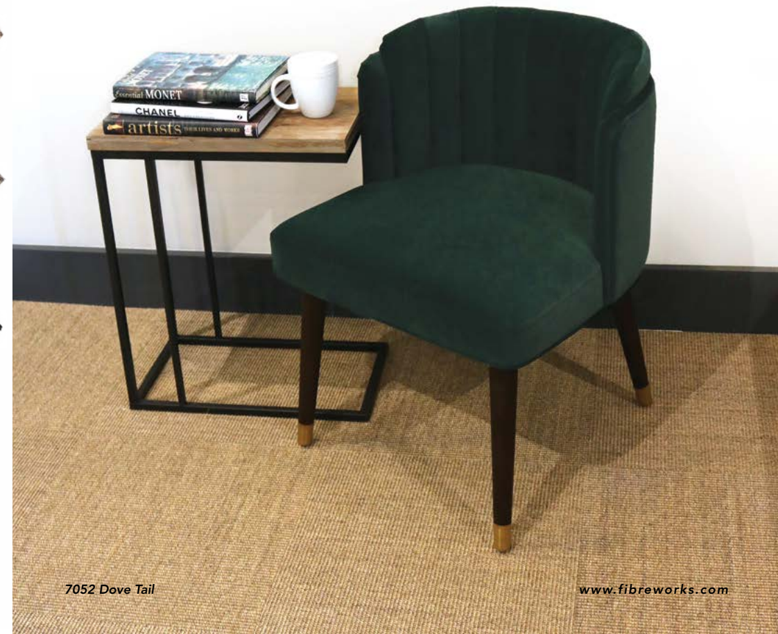
7052 Dove Tail

The surface of each tile is made from 100% natural sisal fibers. Sisal tiles can withstand moderate to heavy foot traffic.