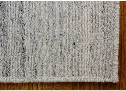
Wool serging yarn