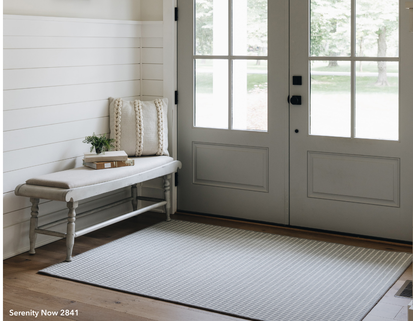
Serenity Now 2841

Claims will not be honored regarding the color variance in Serenity Now and Unity.