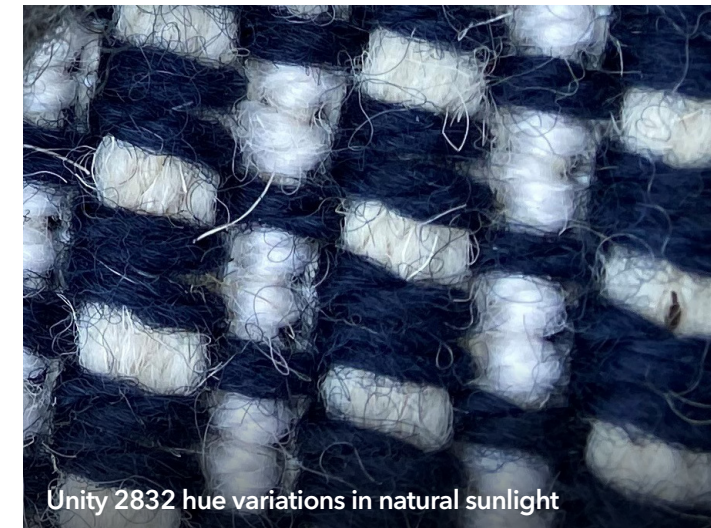
Unity 2832 hue variations in natural sunlight