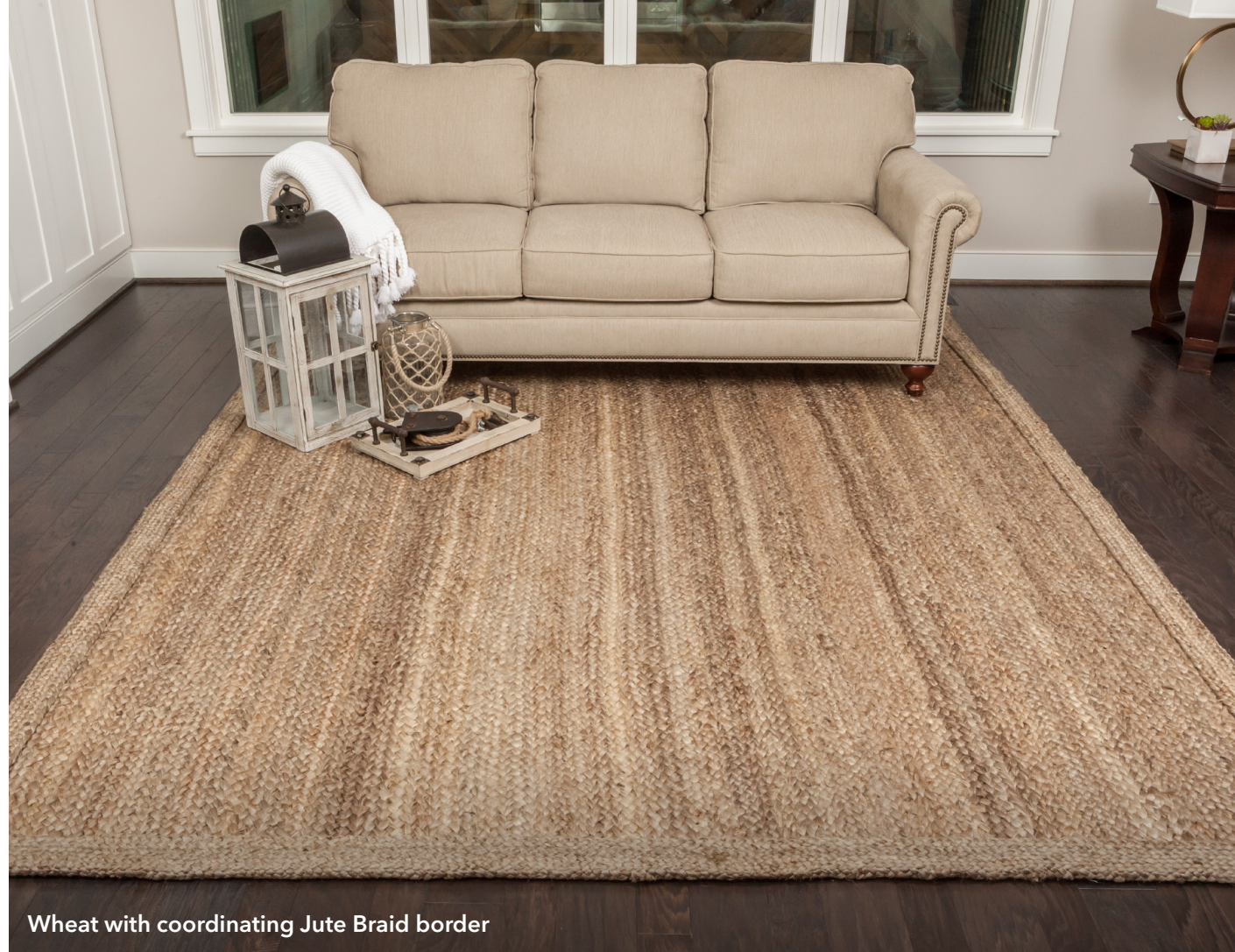
Wheat with coordinating Jute Braid border

These natural characteristics of Kochi are embraced and even cherished as they undoubtedly display the hand crafted nature of every floor covering.