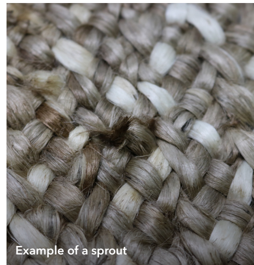
Example of a sprout