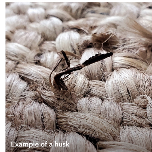
Example of a husk