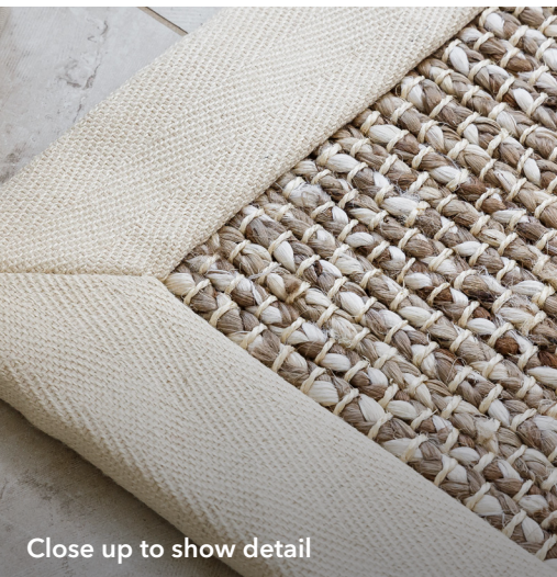
Close up to show detail