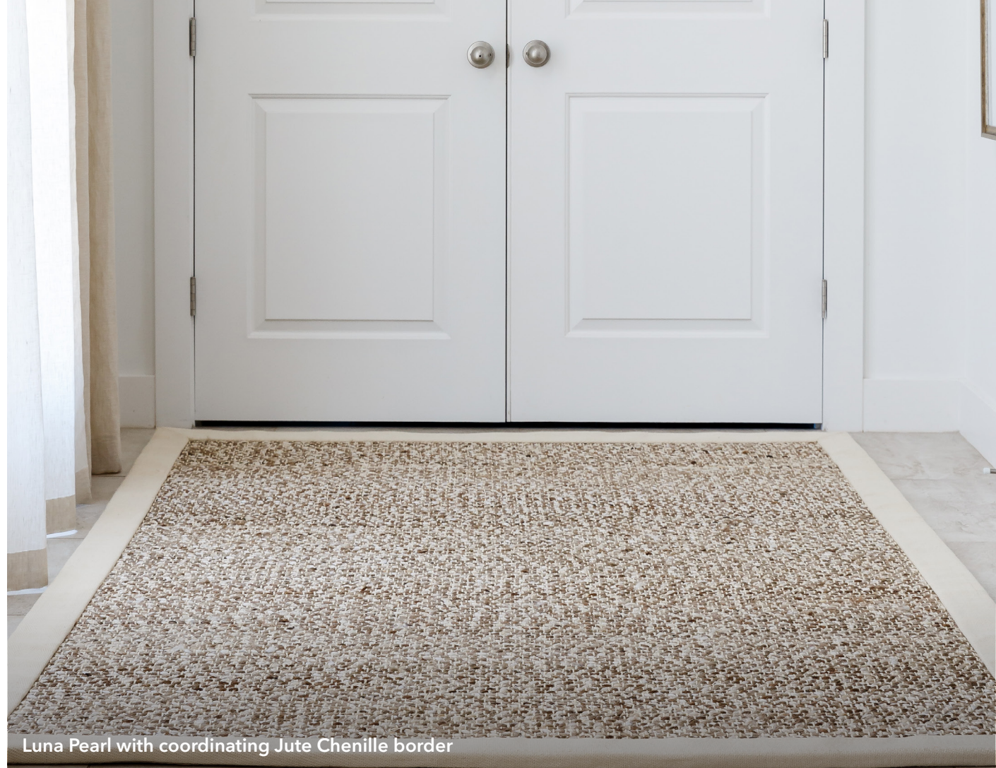
Luna Pearl with coordinating Jute Chenille border

These natural characteristics of Bombay are embraced and even cherished as they undoubtedly display the hand crafted nature of every floor covering.