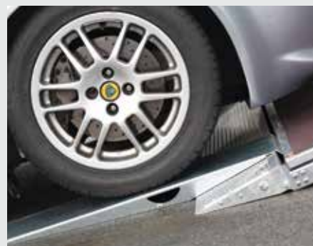
Ramp Skid Extenders Pair of ramp skid extenders to aid loading of vehicles with low clearance.