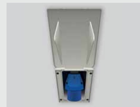
240v on-board battery charging kit Conveniently allows the on-board battery to be charged from a 240v supply outlet.