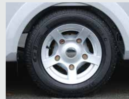
Alloy Wheels Give your trailer the wow factor by adding a set of exclusive alloy wheels.