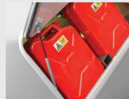
Front Wall Access Hatch The front wall access hatch allows for easy access to the front storage cabinet.