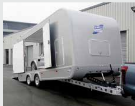
Tilting Drawbar To aid loading vehicles with low ground clearance.