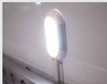
Floor Lighting LED Floor lights for low level illumination.