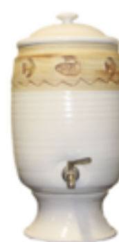
White Ocean **