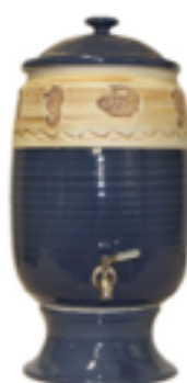
Blue Ocean **