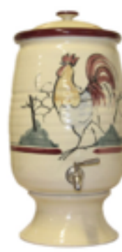
Red Rooster *