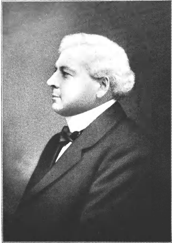
SIR RICHARD McBRIDE