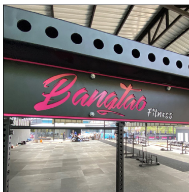
Custom logos / colours / designs available