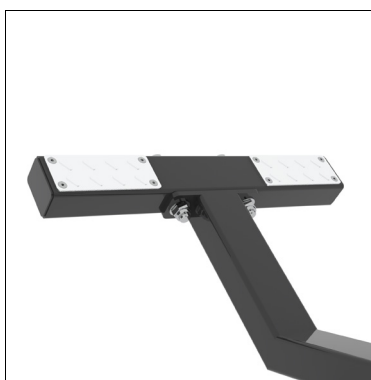
Checker plate foot plate