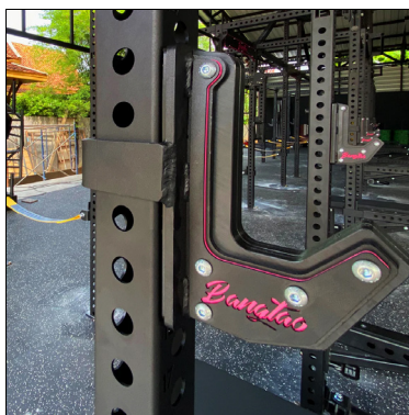
Customizable logo plate