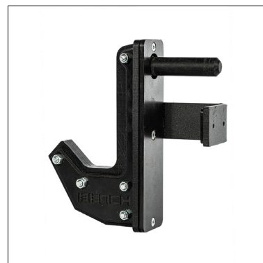
High Density Plastic to protect rack