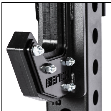
24mm wide high density plastic

Coming as standard with a Built Strong Matte black coating and satin black logo plates, our Revolve range offers you a full range of custom colours and logos available upon enquiry.