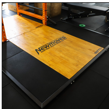
Custom Logos available

The REVOLVE Power Rack Platform Insert is designed to fit with REVOLVE Power Rack and can handle anything you can throw at it. With 2 layers of 20mm crumb rubber tiles, it will minimize noise and vibration whilst protecting the durability of your equipment. The multi-layer wood platform provides a solid platform base for all your big lifts.