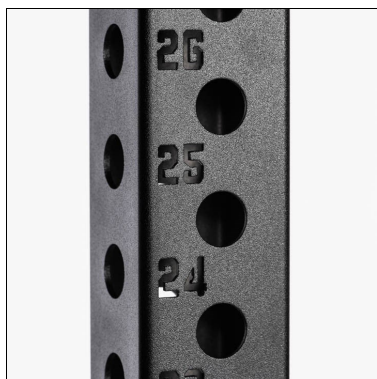
CNC 24 mm laser cut holes (50mm hole spacing)