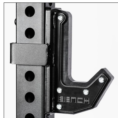
Sandwich J Hooks with high density plastic to protect barbell and rack