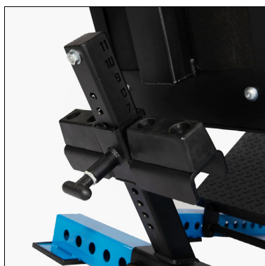
11 position stopper adjustment

Introducing the Exceed Pendulum Squat! This sleek and sturdy piece of equipment is perfect for athletes who want to target their quads, glutes, and hamstrings in a safe and effective manner. With its easy-to-use adjustable foot plate and built-in safety features, users can feel confident pushing themselves to their limits. Plus, the plate loaded design allows for customizable resistance and maximum gains. Don't settle for a subpar when you can Exceed expectations and become a true quadzilla with the Bench Fitness Exceed Pendulum squat. At Bench Fitness we are all about exceeding expectations and that has never been more true than our Exceed Plate loaded machines. Fully customizable with a huge selection of colours and the option to personalize even further by adding your own branding. All Exceed plate loaded machines are also compatible with our REVOLVE band pegs to take workouts to the next level.