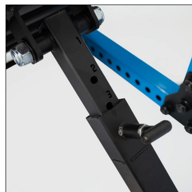
4 position angle foot plate adjustment