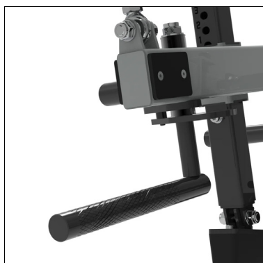
Multi position knurled handles

At Bench Fitness, we strive to exceed expectations, and our Exceed Plate loaded machines exemplify this philosophy. You can customize the complete range of machines with an extensive range of colors and even add your own branding for a personalized touch. Additionally, all Exceed plate loaded machines are compatible with our REVOLVE band pegs, which can help you take your workouts to the next level.