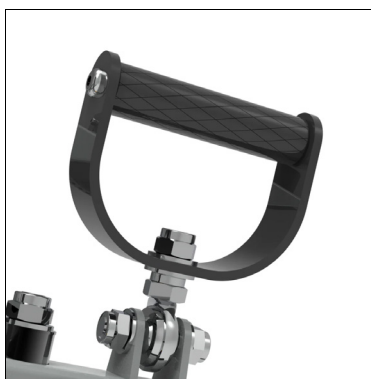
Rotating D handles