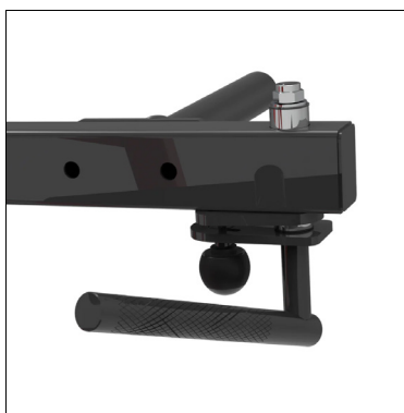
3 position knurled handles