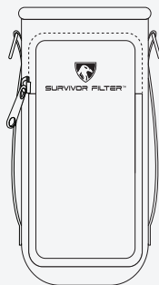
Neoprene Carrying Case