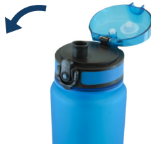
PUSH DOWN TO CLOSE