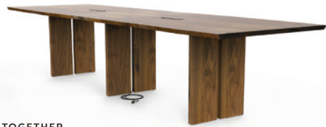
TOGETHER Shown in Live Edge Walnut