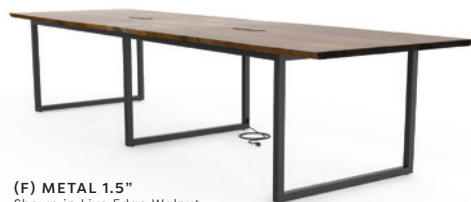
(F) METAL 1.5" Shown in Live Edge Walnut