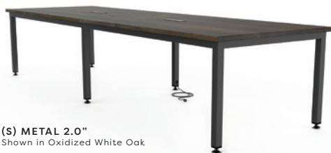
(S) METAL 2.0" Shown in Oxidized White Oak