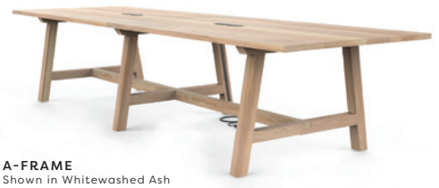
A-FRAME Shown in Whitewashed Ash