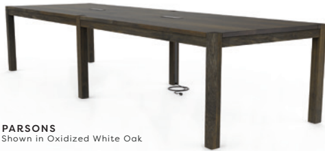
PARSONS Shown in Oxidized White Oak