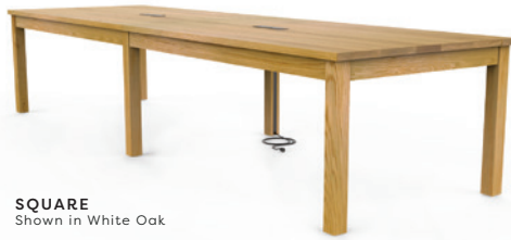
SQUARE Shown in White Oak