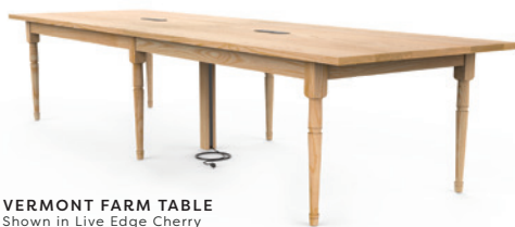
VERMONT FARM TABLE Shown in Live Edge Cherry