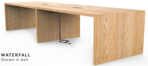
WATERFALL Shown in Ash