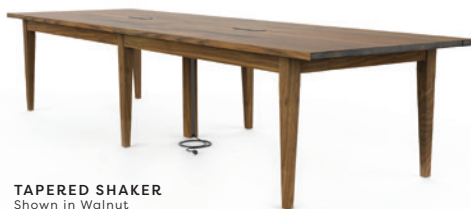
TAPERED SHAKER Shown in Walnut