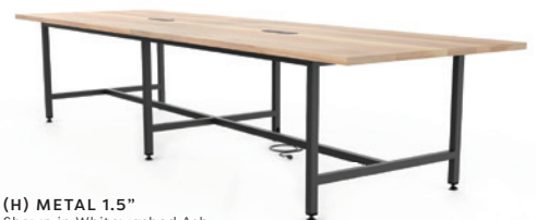
(H) METAL 1.5" Shown in Whitewashed Ash