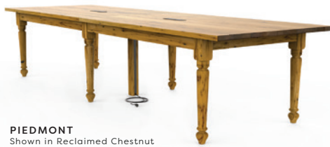
PIEDMONT Shown in Reclaimed Chestnut