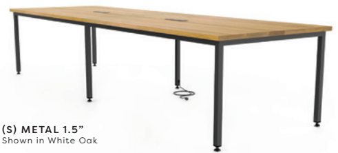
(S) METAL 1.5" Shown in White Oak